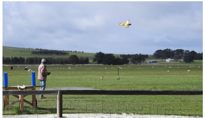
The ducks thought it was okay though and weren't too concerned about Alan's model overhead.