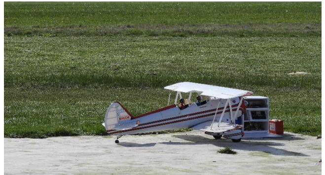
The old Super Stearman lost the OS200FS muffler nozzle.

On Sunday 4 th August I (Ed.) had taken off on the third flight for the day with my Super Stearman. After a few circuits it was heading out over the south west corner of the field banking around when small parts could be seen coming off the plane. Immediately I thought it must have been the spinner cone because the prop loosened when the OS200 was started and maybe it wasn't tightened sufficiently. I flew over the strip and could see the spinner was still attached but then noticed the back of the muffler was missing so landed straight away.