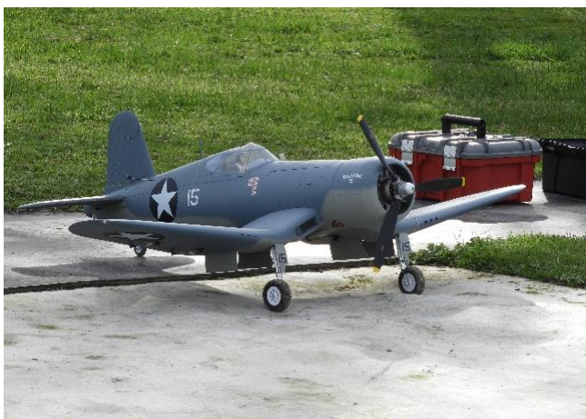
Another shot of Mark's F4U-1A Corsair.

It has a 1600mm Wingspan and comes complete with 60 size 5055-390KV electric outrunner motor, 80 amp ESC, 18 inch three blade prop and uses 11 servos.