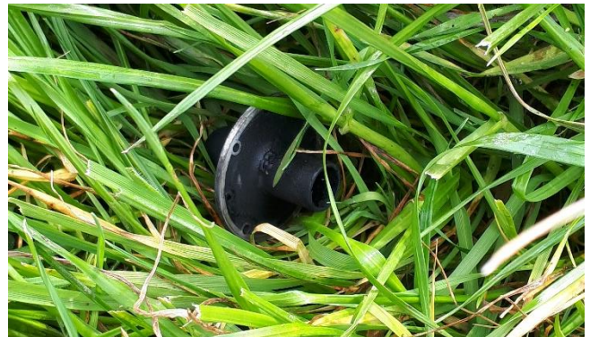
The baffle lying elusively in the long grass some 220m metres away.

wasn't long before the detector beeped. Once again I couldn't see anything in the grass and had to look really closely at where the beeping came from and there it was the elusive baffle.