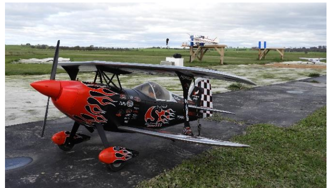
Looks fast just sitting on the ground. The full size is a custom version of a Pitts S-2S.

Video of the show routine https://www.youtube.com/watch?v=C3DQ9rcLBXE if you want to have a look.