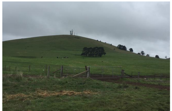
Mount Hollowback from the North West.

Mt Hollowback is an excellent, popular and well-known site for RC slope soarers and hang gliders. However, it's most distinguishing feature is a pair of communication towers providing TV, radio and mobile phone services for Ballarat. Until recently, this hasn't been an issue, but it is now clear that the recent installation of more and more mobile phone and Wi-Fi transmitters means that using 2.4GHz is no longer feasible.