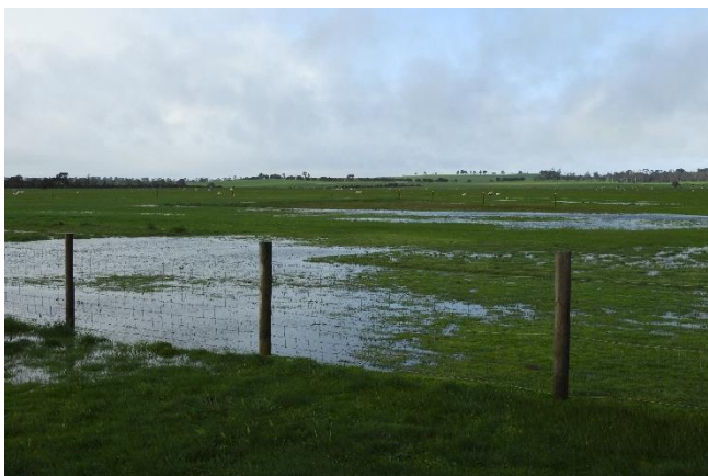
The East/west runway goes under water but it seems to drain away in a few days once the rain stops. Photo taken on Sunday 11 th August.