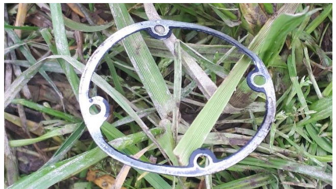
One of the gaskets found on a sheep track. (44mm diam.)

I then leisurely disassembled the Super Stearman and loaded it back in the car. Then I thought before leaving, why not have another quick search. I went out to where I was flying from and lined up on one of the trees in the south/west corner which I reckoned lined up with where the muffler came off. Then headed off in that direction and started searching when about 150-200m away. After about 10 minutes I found the muffler gasket sitting flat on one of the sheep tracks. It was the sheep track that saved the day.