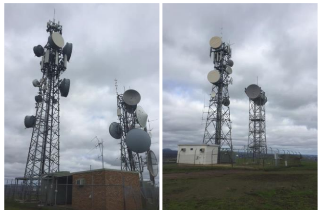
Several towers within the Mount Hollowback Complex.