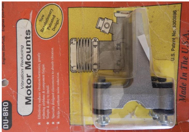
Suits a 50 – 75 two stroke glo engine.