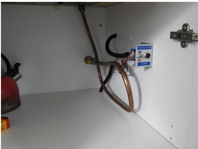
Isolation switch, red LED bezel and fuse. It was decided to place near the gas shutoff so it would be less likely to get left on when shutting up for the day. Most members are accustomed to turning the gas off so should see the pump switch.

Max replaced the burst copper pipe supplying the toilet taps on Sunday 5 th August. Let's hope the freezing cold nights don't cause any more trouble.