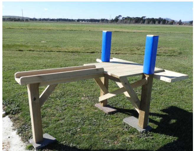
Side view of stand. The blue material is a hard wearing weather proof fabric over high density foam layer to protect wing leading edge.