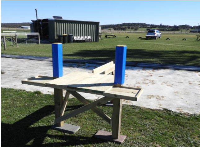
Front view of stand showing the tables on each side for transmitter, electric starter, tools etc.