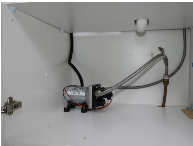
Pump sitting underneath the sink plumbed into the tap supply hoses. Round plugs were crimped onto the pump wiring and sockets crimped onto the supply lead. This facilitates removal of the pump or connecting to another battery if the solar system fails for some unlikely reason.