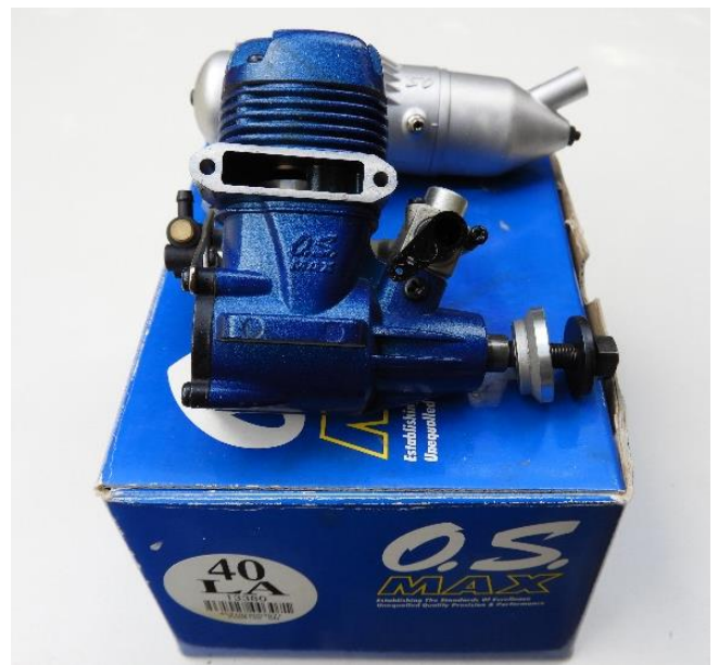
New in box – never run.