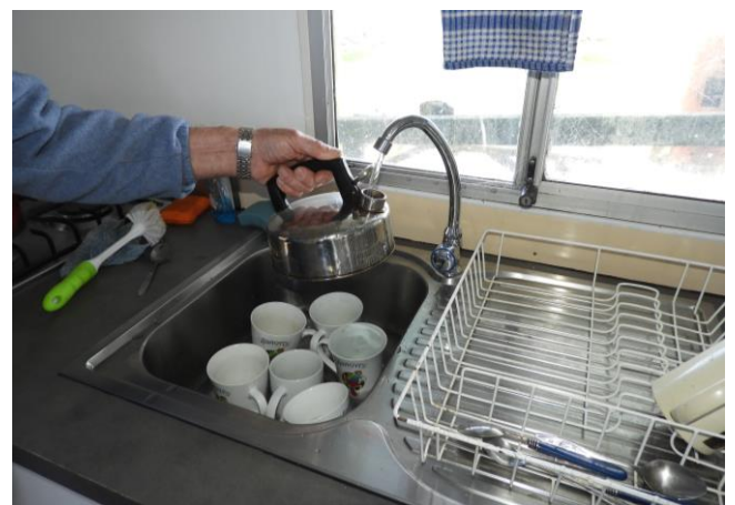
File photo of tap water flow with only tank gravity feed. I forgot to get a photo with the new pump providing the improved pressure and flow.

If the isolation switch is NOT turned on water will NOT flow from the tap. With the switch on, when the tap knob is turned on the pump starts providing a good supply of water and cuts out when the tap is closed. It makes very little noise or vibration. All up cost including the pump, plumbing and wiring came in at $203.85.