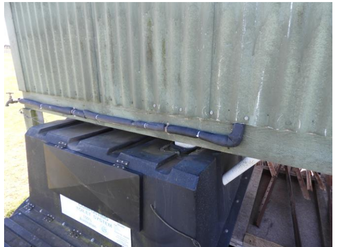
Max fitted new copper pipe along base of toilet.