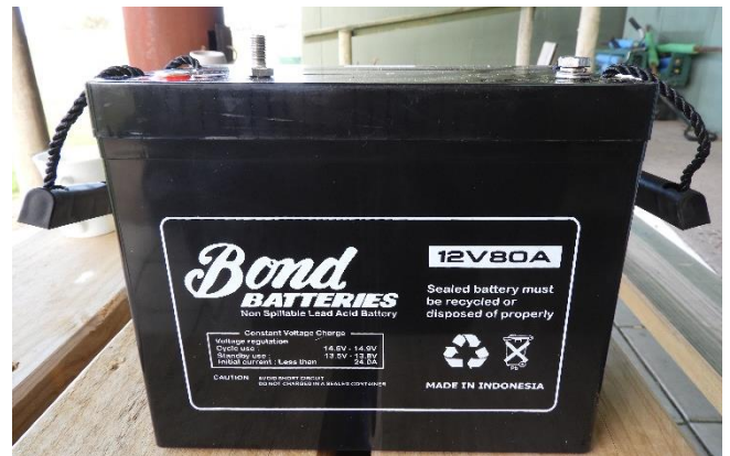
This is the battery we purchased for the solar powered charging system. It was recommended as a more suitable type over a conventional car battery for our needs.

The following weekend (12 th August) it was wired in connecting to the battery in the charging station with an isolation switch incorporating a fuse and LED bezel to indicate when the pump is powered.