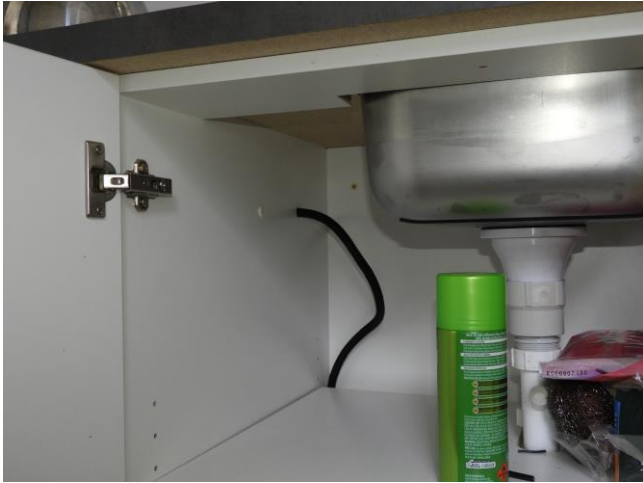
Power comes from switch though a hole drilled in the cupboard down the back to the pump.