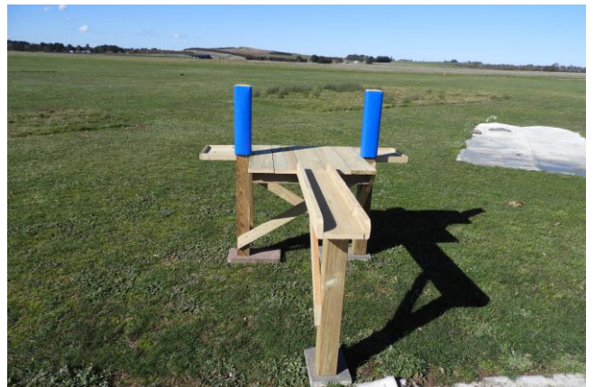
Tail section of the stand which supports tail dragger models.