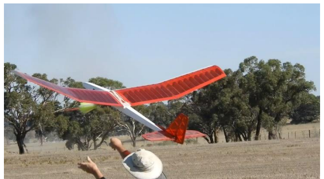
Glider is launched by the assistant.