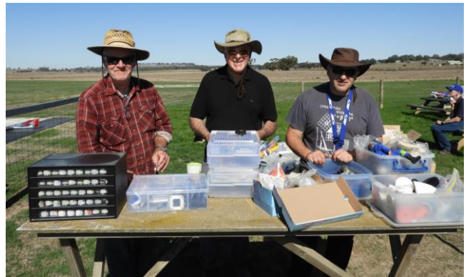
I brought out modelling gear for sale from the estate of the late Graham Waterhouse. We are gradually selling it off and basically down to the accessories items. Maybe some happy customers!!!