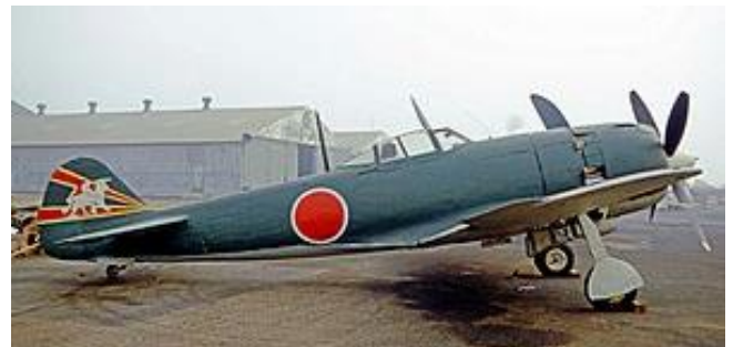
Ki-84 Hayate (Frank) preserved in California in 1970. As of 2014, this aircraft is displayed at a war memorial in Japan. Number built: 3514. Don’t look like any Subaru I’ve ever seen!!!