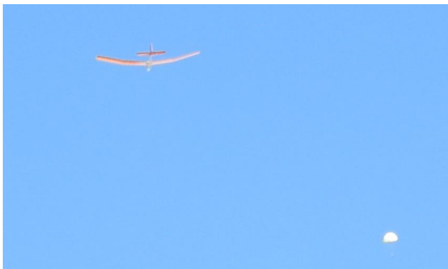
The pilot releases the tow line by diving briefly to allow it to slip off the hook. Then stooge around looking for thermals to stay aloft. The tow line floats down with the aid of a small parachute which then has to be retrieved for the next launch. Looks like plenty of exercise with gliders!!!