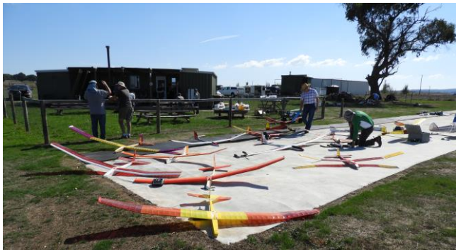
The BAMI members brought along a collection of gliders and old timer models taking advantage of the glorious flying conditions.