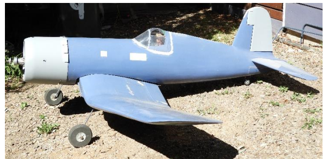
Scratch built (not by GW) and flown once at Yendon circa early 2000's. 2320mm wing span with painted finish. Super Tigre 4500 2 stroke engine. Aileron, rudder, elevator & flap servos. Fixed U/C 120mm lightweight wheels. Without engine $150.

F4U Corsair with Super Tigre 4500: $350 (Neg.)