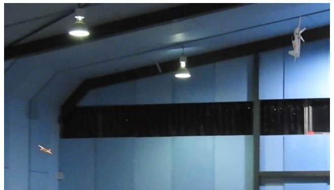
Alan Crisp doing some knife edge passes while lapping Rob Hutchings' slower model on the left.