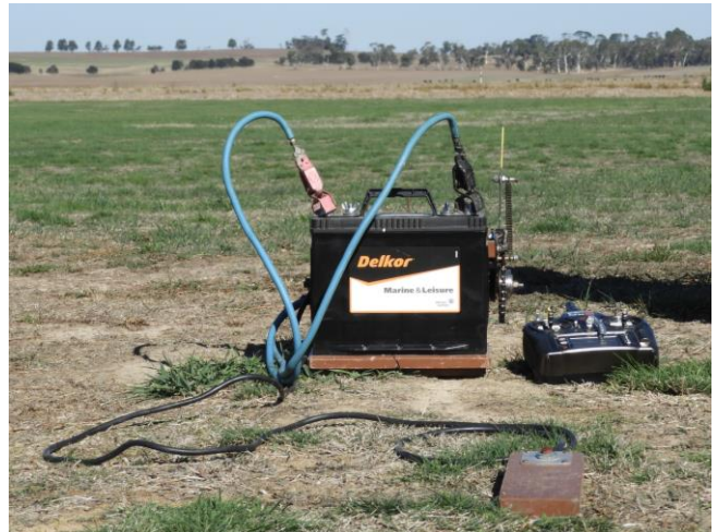
Two hundred metres out into the paddock is a stake with a pulley. The line from the winch drum goes out to the pulley and back so at least 400m of tow line. The pilot controls the winch pull by the foot operated control – a bit like a sewing machine.