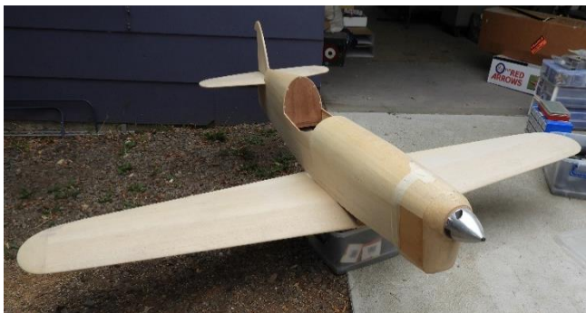
Partially framed up Mew Gull with plans. Not sure of wingspan but quite a large model. Fully built up one piece wing that requires U/C fitment, ailerons cut out and servos fitted. Plaster moulds for wheel pants available.