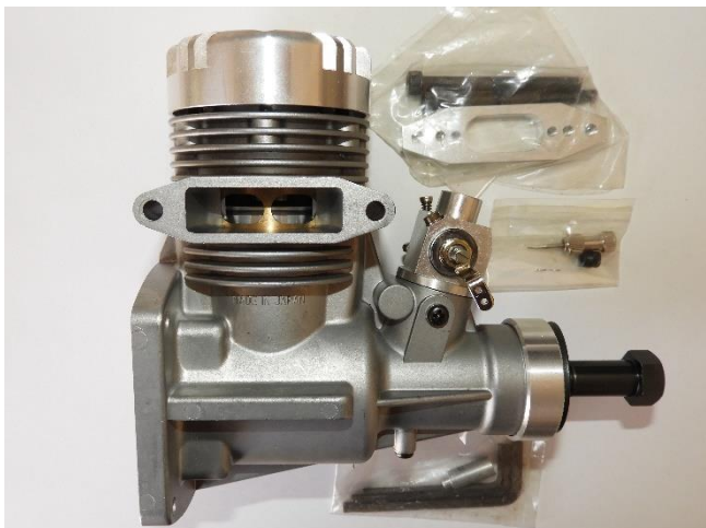
ENYA 180X TN engine, new in box – never run. Comes with a muffer adapter plate. A suitable muffer must be purchased separately."

If anyone is interested or would like more info please let me know ASAP via the editor contact details at the top of page 1.