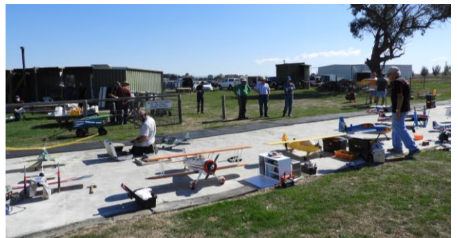
We had quite an array of models in the pits all day long.