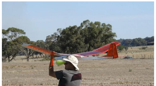
Assistant about to launch waiting for the nod from the pilot.