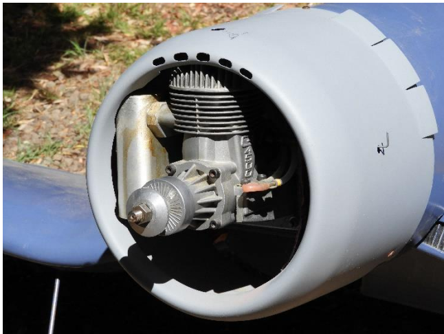
Mew Gull: $100 (Neg.)