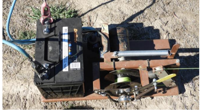
This is the winch the BAMI members use to launch their gliders.