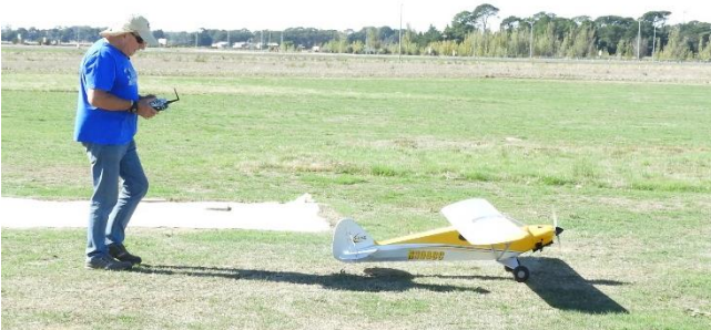
Graeme's Carbon Cub about to take-off.