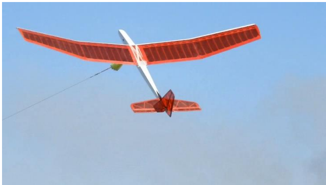
Glider is pulled up by the winch to around 150-160m. Must be somewhat less than the 200m line length from the stake out in the field.