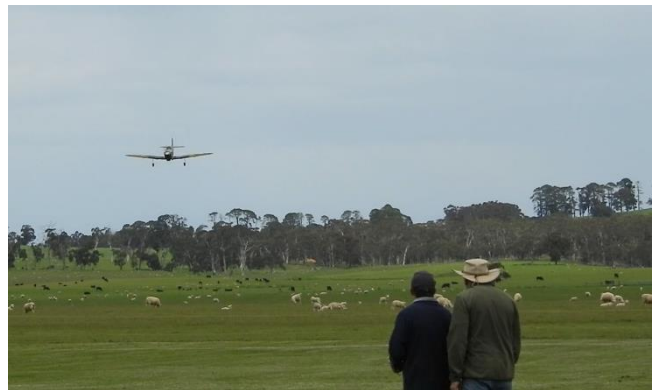
On the second attempt Max got the Spitty down safely although it was a bit hard on the landing gear.

On post examination we found it needed exponential on the controls and Max is I think pondering what needs to be done to the undercarriage, how much work is involved and is it worth it. (ROI – Return On Investment!!!)