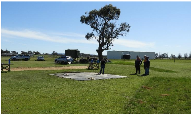
The rubber mats should provide a good base for the large model start-up area. Due to the wire cable reinforcement we can't cut holes for model restraints but small cut-outs along the edge where they butt up against each other should be possible.