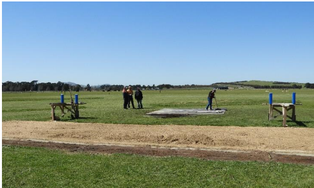
Four of the rubber conveyer belt mats have been moved to the large model start-up area.

As it turned out the Wednesday was great weatherwise and there were others out at the field to lend a hand. With the extra help we were able to shift the very heavy rubber mats from along the edge of the pits to form the heavy model start up area. With the recent heavy rain we knew exactly where the low spots were and adjusted the position of the start-up area to avoid where water lays.