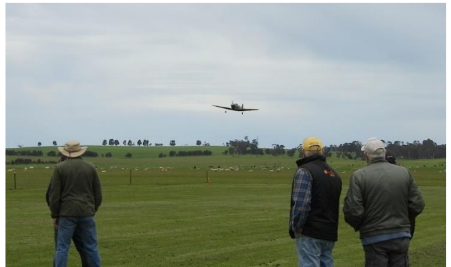
The first landing approach which Max aborted. By gee, Graeme likes to travel close behind Max!!!

The model was obviously very sensitive to elevator control making it difficult for Max to achieve a nice smooth approach. This caused a couple of go arounds but on probably the third attempt he managed to get it down safely, but the flimsy undercarriage didn't support the model and it skidded on the nose coming to a stop.