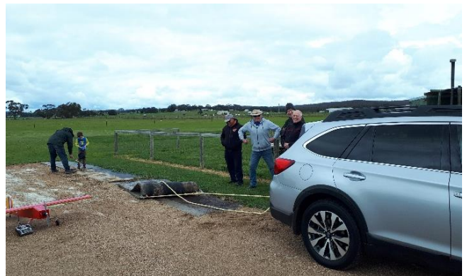
On Sunday 22 nd September we shifted the remaining three rubber mats so the pit area levelling could be finished off. And yes there's always one in every crowd!!!