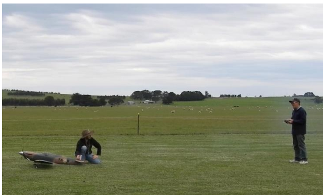
Alan holding the tail down while Max guns the OS120FS.

Max fitted an OS120 FS which seems to run quite well and most of all reliably. The main problem with the model is the undercarriage which is not really strong enough for the weight of the model notwithstanding the fact it is wrong scale wise. I think Max wanted to see how it flew before he considers doing any work on it to improve its scale attributes.