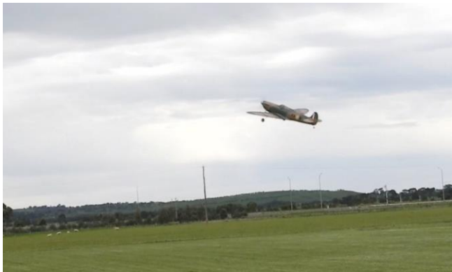
On about the third or fourth attempt Max managed a clean lift off.

Max had several attempts to get it off the strip with ground support from Alan, but it nosed over stopping the engine each time. Finally though he did manage a successful take off. The controls were a bit over sensitive however, but Max managed to keep it under control and flew it around for probably seven or eight minutes before attempting a landing.