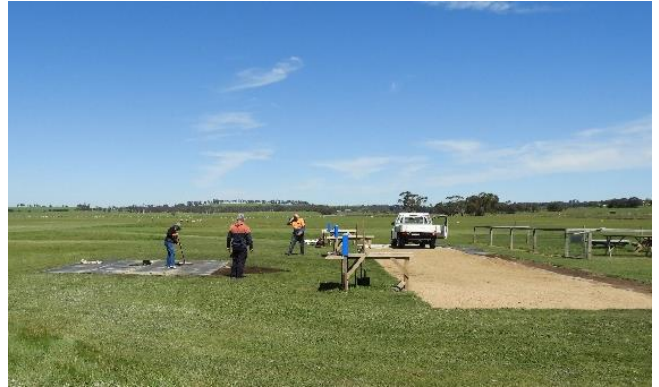
Murri has been taking granite sand out to the field over the last few weeks to level the pit area.