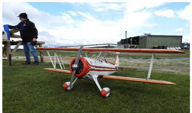
I (Ed.) had the old Super Stearman back in the air on Sunday 1 st September after finding the wayward OS200 muffler nozzle in the paddock with the aid of Alan's metal detector.

W e are currently working on the pit area in preparation to lay the matting we picked up from the Albury club earlier this year.