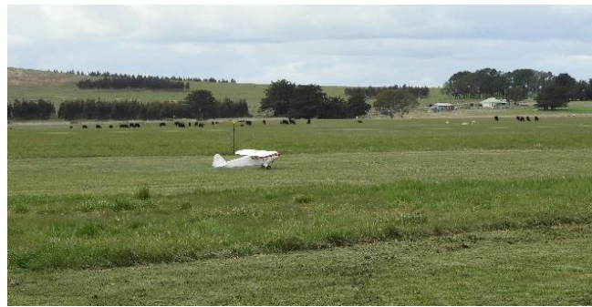
Peter Evans taking off to do a bit of cattle mustering!!! Sunday 2^{nd} September.