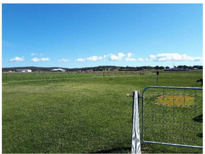
The fence encloses the field and terminates at the boundary fence along Church Road via a spring loaded insulator.