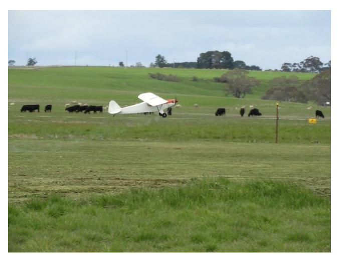
Peter's OS91FS powered Piper Cub on take-off.