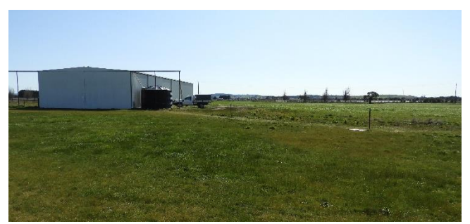
The fence commences at a star picket adjacent to the water tank next to the farm shed. It can be dropped down there for vehicular access via the spring loaded connector. At this stage the connector must be hooked on to the insulator and NOT the star picket.

It's been up for almost four weeks and seems to be keeping the cattle out. On club flying days or when anyone feels the need the fence can be laid down where desired to avoid any nasty accidents.