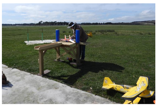
The new start up benches are getting plenty of use.