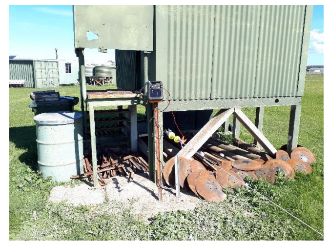
The power charging unit is mounted on a post next to the toilet and chained as well for security. We replaced the earthing rod with a length of gal star picket which seems to have made the unit work much better.

The general opinion is we should run another wire around to make sure any smaller cattle can't get in. The unit is capable of energizing 4.5km cable length. It's about 650m around the three sides which encloses the field.