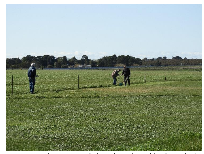
Laying out the posts and threading the cable through the insulators on Thursday 23^{rd} August.