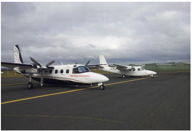
This shot was taken on the tarmac at Ballarat Airport after the short flight from Stawell.