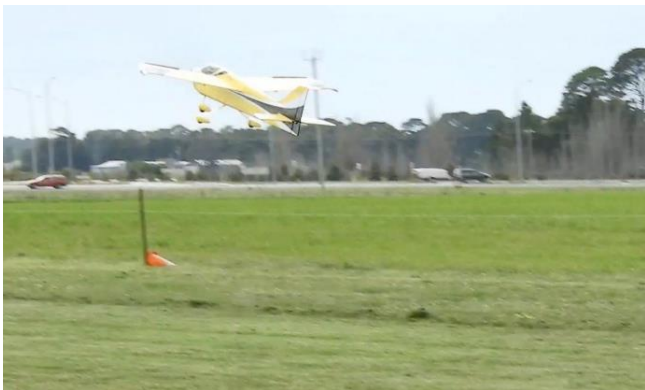
From memory there was a moderate northerly breeze but it didn't seem to bother the Stev S 30E given that it is a very light model. Certainly had plenty of power.