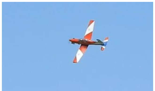
The OSGT22 seems to pull the PC-9 through air with plenty of authority.