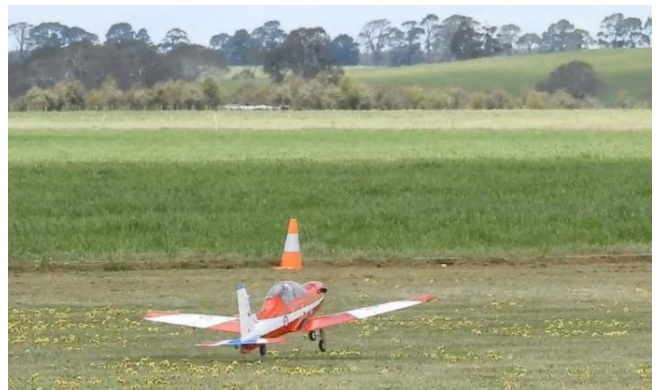
And we have lift off. I think this was about the third flight.