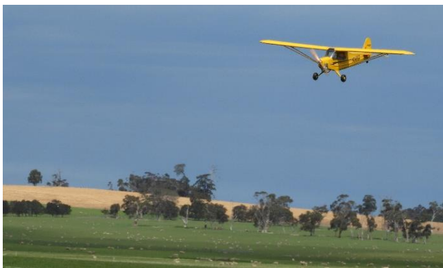
I managed to get this shot on a slow pass over the field or maybe it was a landing approach. Most of the time the Cub is doing aerobatic manoeuvres.