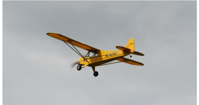
The Cub looks very realistic and is a great performer.