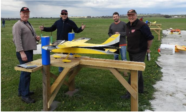
I wonder what they're all on – whatever it is I'll take a kilo. The model stands have proved very popular.