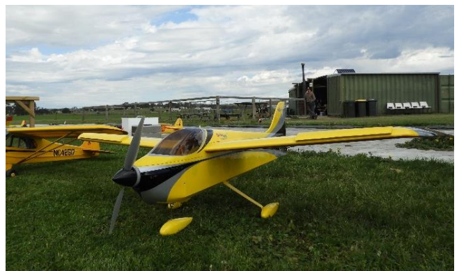
Note the anti-stall slats fitted to the outer wing leading edge.