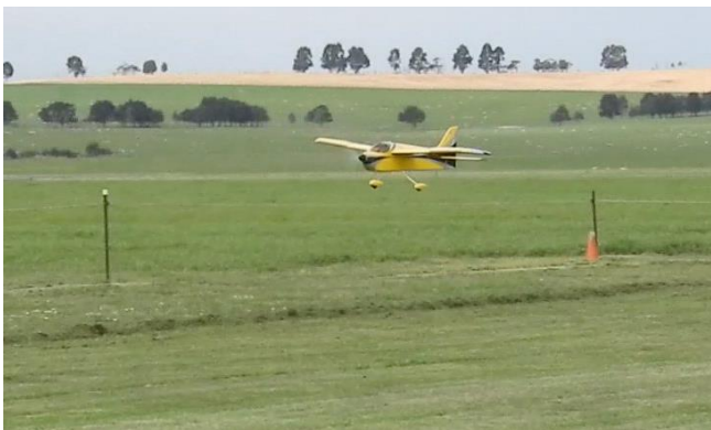
After about 3 or 4 minutes Nigel brought it in for a pretty good landing – just a couple of bounces.

A nthony Mepstead test flew his new PC-9 on Sunday 21 st October and had several flights during the day, following on from the first making minor trim adjustments along the way to improve flight performance.