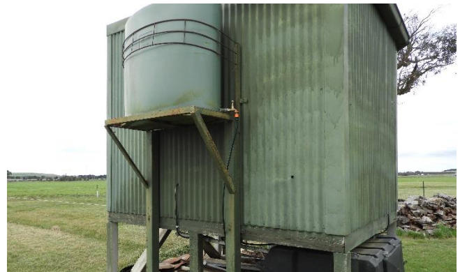
All the copper pipe from the tank to taps has been replaced with garden hose.