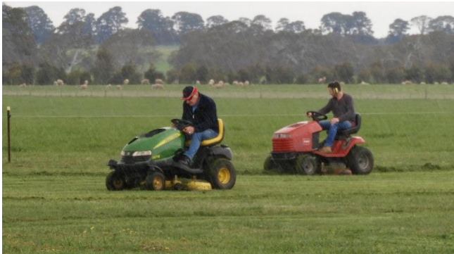
Looks like they’re havin’ a drag. I think the John Deere is slightly faster than the Toro down “conrod” straight. Photo Sunday 7 th October.

The mowers have to work pretty hard for a couple of months of the year to keep the runways operational and also maintain the general appearance of the field and car park area.