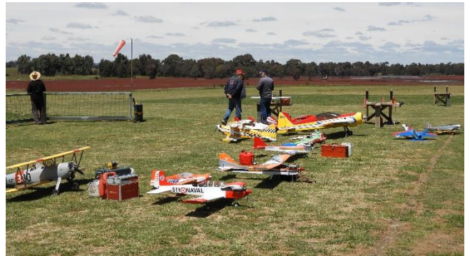
A line-up of some of the models at the event.