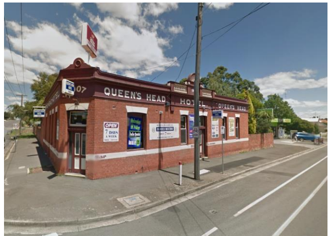
The Queens Head Hotel, corner of Humffray St North and Queens St North.

The Queens Head Hotel, corner of Humffray St North and Queens St North has been booked for 6:30PM Friday 15 th December. It's still a little way off but handy to know in advance when it comes to organizing your busy Christmas schedule. It would be great to have as many there as possible. Numbers 'maketh' the night!!!