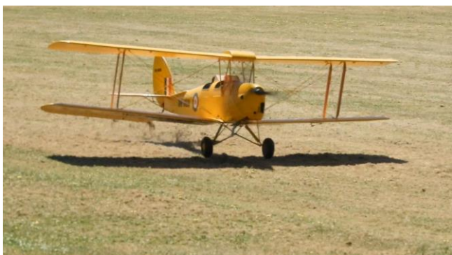
And the Tiger Moth is back on terra firma having flown again for the first time in over 20 years.