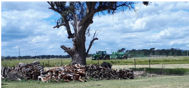
Just as the last of us were packing up to leave around 3:15PM on Sunday 19 th November a Trawalla Estate tractor towing a spray boom came in and started going around the crop from the outside working its way in. I guess an insecticide or herbicide before it is harvested.