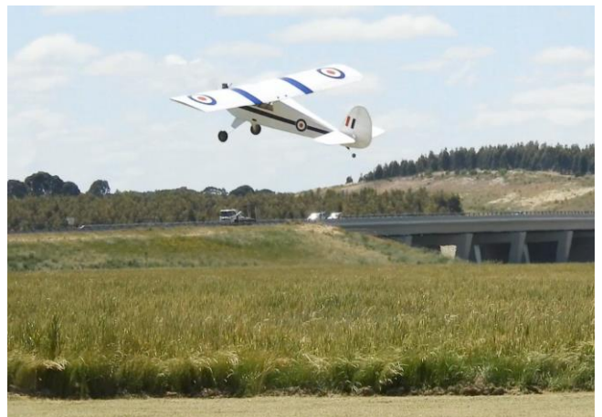
There was a northerly breeze blowing but pretty much straight down the strip. The LA handled it without difficulty.