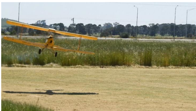
A few frames further on and moments from touch down. There was a crosswind component to contend with which accounts for the bank and sideslip.