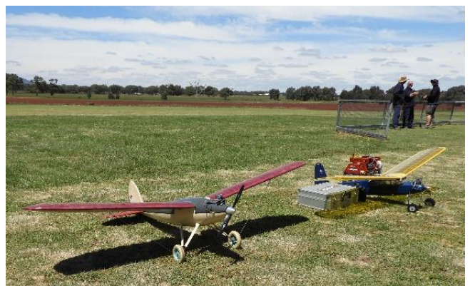
An Ararat club member had these old timer models on display. From memory he said they are about 15 years old.