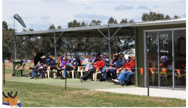
The Ararat club has great facilities with a covered area to sit under and assemble models.

A few more photos of the day with captions follow on to conclude this article.