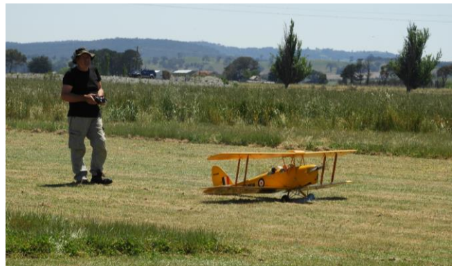
Lined up on the runway and about to take off for the first time in over 20 years.