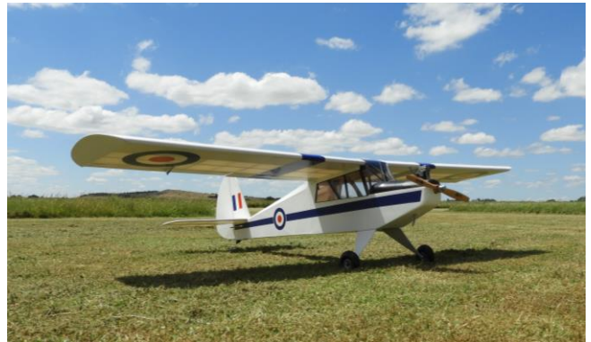
Noel Findlay's new LA Special out at the field on Sunday 19 th November for its maiden flight.

Noel Findlay came out to the field on Sunday 19 th November to test fly his new scratch built LA Special (a design by the late Len Astbury). The LA is covered with tissue & dope then painted – the way model aircraft used to be built. And Noel being one of the countries great builders it looks extremely good, a refreshing change from iron on covering and foam. It's powered by an old OS 40 four stroke. (For interest, according to the OS Engines Manufacturing Timeline they were first produced in 1981.)