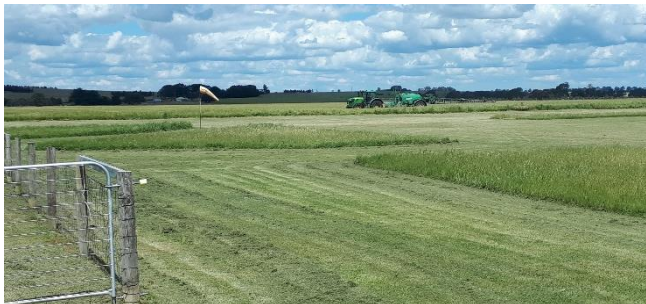
According to my photo album the last crop was harvested between 15 th & 29 th January this year.

At the last committee meeting held on 1 st November it was decided to place an ad in the Courier newspaper Community Diary page to promote the club. An ad was submitted on 14 th November to start on Thursday 16 th November and run for 5 weeks at a total cost of $10. The ad submitted had the following wording: