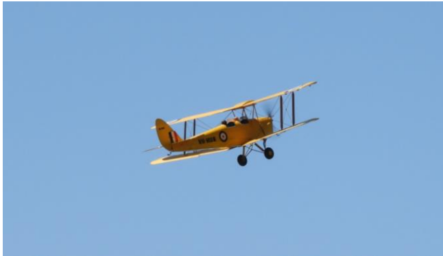
The climb out looked good however it needed a fair bit of aileron and rudder trim to counteract roll to the left.

matched by JB Auto Paints which they put in a spray can. The result was quite effective, worth the effort and made the model safe to fly.