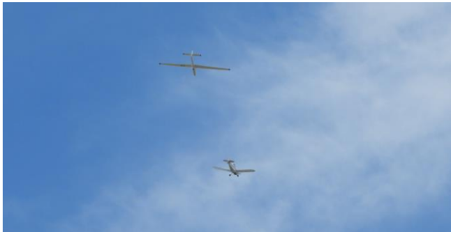
It must have been a fairly active day at the Ararat airport with glider towing. Quite often you could see them to the south of the field towards the airport but this pair came overhead.