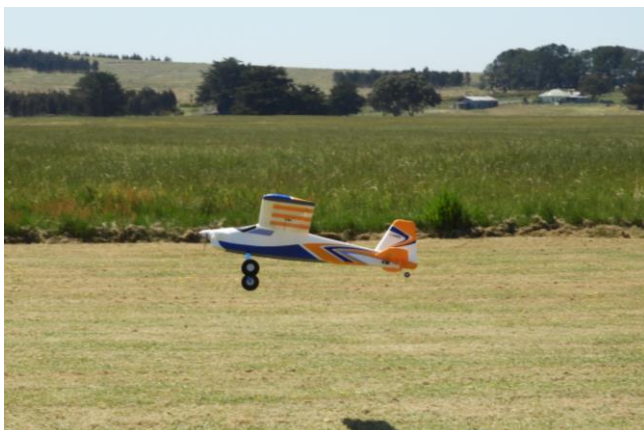
And away she goes!!!