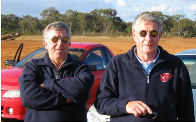
11 th July 2005 Richmond Nationals. Oh dear those eyeball glasses!!!