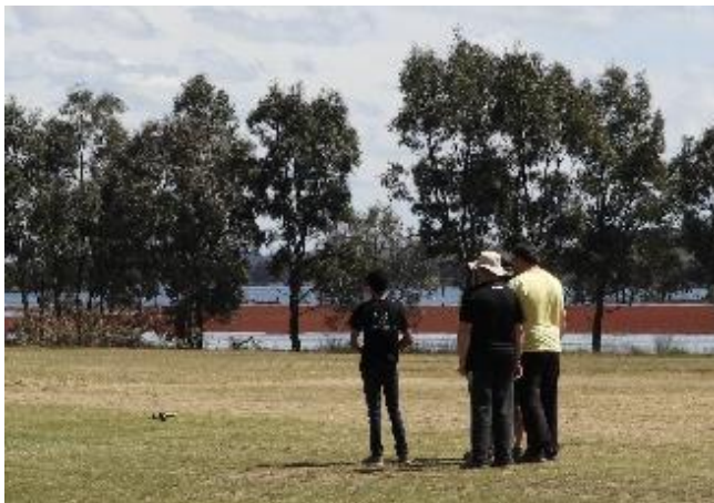
Young local member flying his FPV quad copter. It was quite small and extremely manoeuvrable, rather difficult to photograph. It is near ground level to the left.

The Ararat club were excellent hosts and had lunch on which was most enjoyable. Later in the day, I guess around 2:30PM, they made presentations to the pilots who registered. Names were pulled out of a hat and you went up to the table and had your pick of the modelling accessories that they were able to get hold of for the event.