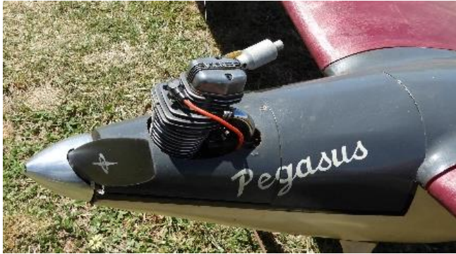
This one is powered by an Enya 60 four stroke.