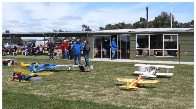
Ararat club house in the background with mostly BRMFC member models in the foreground of this shot.