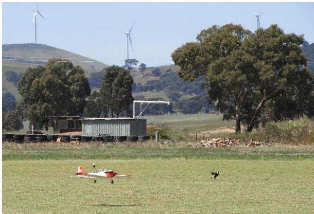
The Magpies are used to models coming in to land and don't take much notice. The wind towers weren't there two years ago when I was at the field last.