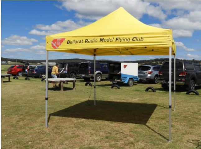
The new club marquee purchased a couple of weeks ago from Outdoor Instant Shelters located in Cheltenham.