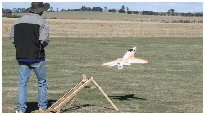
This launch was successful although the previous attempt ended in a tip stall due to lack of airspeed.