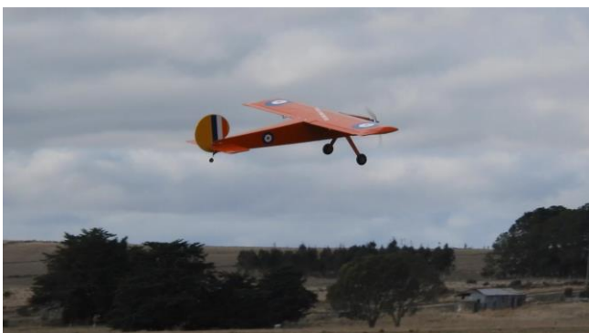
A low pass over the field.