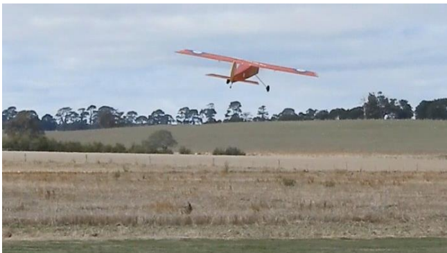
On climb out after take-off. The power of the OS motor provides authority in the air.