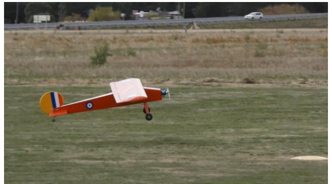
And in for a nice smooth landing.