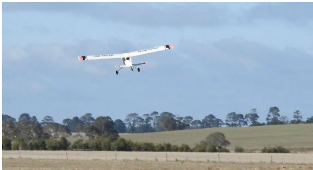
And a nice gentle climb out heading south east.