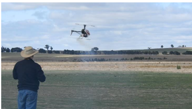
Nigel is flying the Raptor (Don't look like an F-22!!!) around in fairly large circuits and had it up for quite a while. A little bit of trimming was needed on the first flight.

Alan Crisp has constructed a catapult to launch his ducted fan electric model. It has a bungee cord anchored to the base running around a pulley at the business end and tied to a plate at the rear of the aircraft. The launch plate is pulled back stretching the rubber bungee cord until it locks on a trigger release.