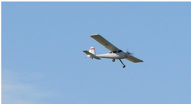
A pass over the field and all looked good.

Alan passed the transmitter over to me (Ed.) and I flew it for several minutes before having the honour of landing it on the east/west runway due to the westerly breeze at the time.