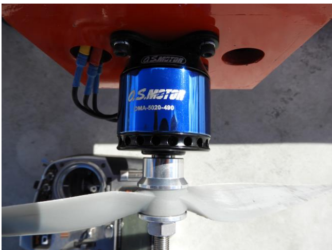
A close up of the OS electric motor powering the Ugly Stik.