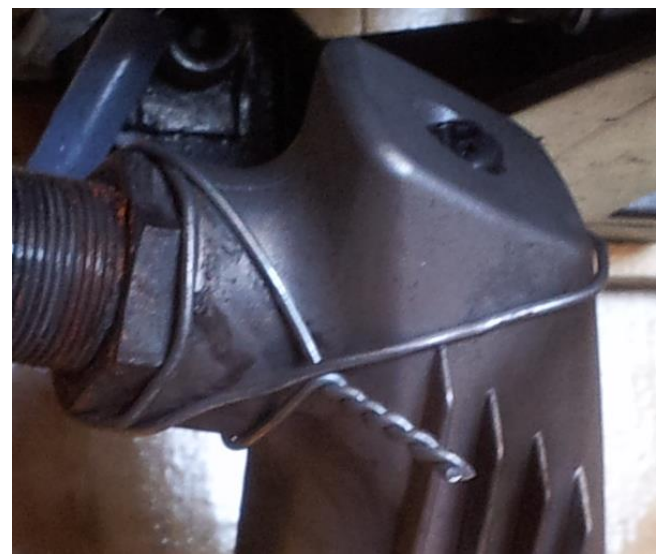
Close up of lock wire around lock nut and muffler of OS 155 Alpha. Hopefully it is successful in the long term.

Before heading down to Warrnambool for their fun fly on March 5<sup>th</sup> I tried lock wiring the nut to the muffler and so far after 7 flights it has not moved which is an encouraging sign.