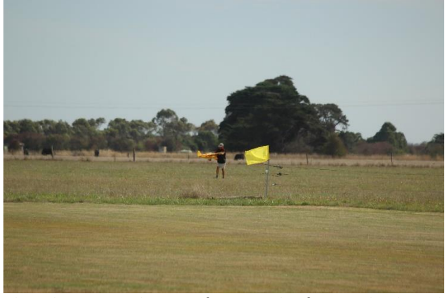
The Shoestring down safe-n-sound after a dead stick landing in the outfield north of the strip.

My second incident was minor but the outcome quite astounding. On one flight when I landed the WACO YMF-5 it wouldn't turn easily to taxi back which I thought strange