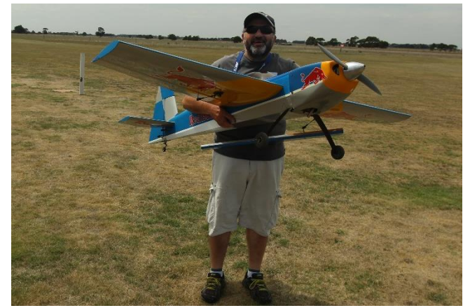
A lucky escape from disaster. Port aileron pulled out in flight on Nick's Edge. Easily fixed and was back in the air soon after.

I don't recall seeing any major mishaps although some of our members had a few incidents worthy of note.