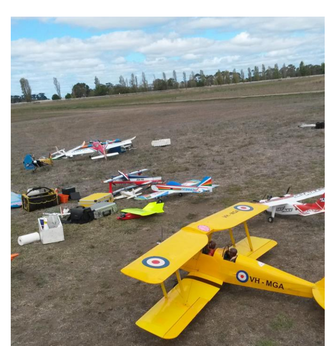
Murri's Tiger Moth in the foreground with a collection of sport models behind.