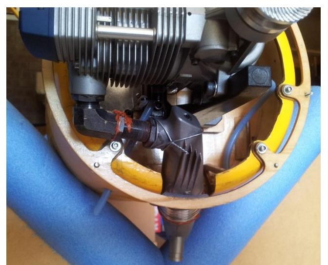
OS 155 Alpha muffler setup on WACO YMF-5 which comes loose after two or three flights.

Some time back I tried a clamp around the muffler body tied back to one of the firewall engine mount bolts, but that didn't work. It only comes loose where the threaded extension pipe screws into the muffler body. No troubles where the adapter screws into the head or where the pipe screws into the adapter.