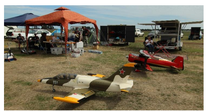
The Aero L-39 Albatros jet with Pitts Special known as "The Beast" also flown by the pilot of the L-39. The Beast was there last year as well.

We all know the F15 but the L-39 is a Czechoslovakian built jet trainer. I grabbed this opening paragraph from the <u>Wikipedia</u> article: The Aero L-39 Albatros is a highperformance jet trainer aircraft developed in Czechoslovakia to meet requirements for a "C-39" (C for cvičný – trainer) during the 1960s to replace the <u>L-29 Delfín</u> as the main training aircraft. It was the first of the secondgeneration jet trainers, and the first turbofan-powered trainer produced, and was later updated as the <u>L-59 Super</u> <u>Albatros</u> and as the L-139 (prototype L-39 with <u>Garrett</u> <u>TFE731</u> engine).