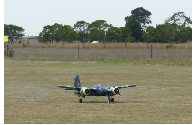
Grumman Tigercat safely back on the deck after losing port engine mid-flight. Here's a YouTube clip of a full size: <u>https://www.youtube.com/watch?v=e1IM6nXsdQc</u>

That's what I remember happening. Of course amongst the few incidents there were many flights had by all that don't rate a mention. Ironically flights are memorable when something out of the ordinary happens!!! Glenn flew the old Beagle Pup several times without incident after it was repaired mid-week following the firewall pulling out the week before at our field.