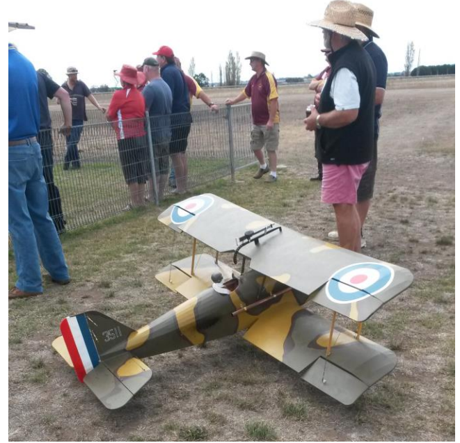
Looks a nicely detailed model but unfortunately no info is on hand. Maybe one of our readers can cast some light on it and the Spitfire. It is probably an S.E. 5a. (Scout Experimental 5 variant a)