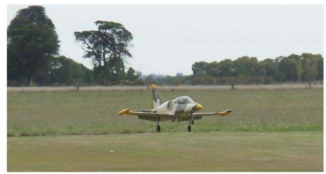
Aero L-39 Albatros on landing approach.

several great flying displays with his Aero L-39 Albatros and new F15 Eagle.