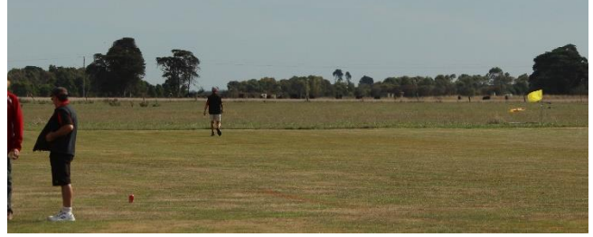
The camera Nazis were out!!! The walk of shame.

I (Roger) had a dead stick landing with my old faithful Shoestring. After 320+ flights the ASP91FS engine decided to quit in an awkward spot. It was heading north along the main runway while the fairly strong breeze was from the east. I thought about turning to land on the strip but decided against it as altitude was not in abundance. The Shoestring continued on well north of the strip and landed safely on what turned out to be a pretty smooth paddock. When it ran on for a while after touchdown I thought everything must be okay. At Warrnambool you have to watch out for the fences at either end of the field which they lay a section down for events. The locals say they don't bother on normal weekends. I put a new plug in and it was alright on the next flight – can't remember ever changing the plug which did look a bit frosty.