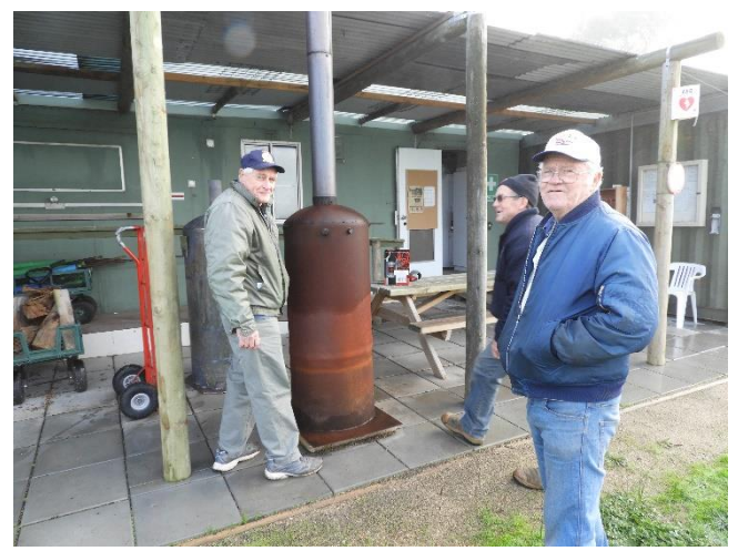
The old heater was full of holes up on top and was bellowing out about 400mm up from the base. The cylinder wall was very thin at this stage after 4+ years of service.

There were a few members on hand to help remove the old heater which was just a matter of disconnecting the flue, moving the old heater away and positioning the new one to line up with the flue. Once in place we gave Max the honour of lighting it. It smoked for a little while inside and out until it burnt off the residual heater insulation material on the cylinder. After that it was really pushing out some heat and definitely a lot more than the old one.