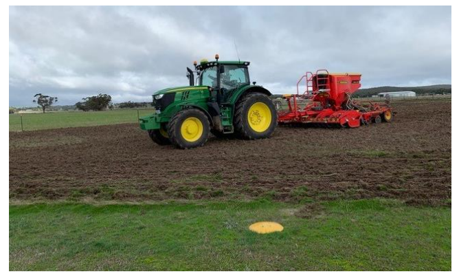
While the contractors were seeding the paddock the farm manager got them to level off and seed our runway extension. It was a very kind gesture and very much appreciated.

Following on from the levelling and seeding of the east/west runway extension by the farm manager's contractor on Thursday May 30<sup>th</sup>, Murri Anstis and Peter Weston have been smoothing it off further by towing an old gate over it with the mowers. Initially we thought more machinery might be required but it seems to be coming up quite good. We have to remember it is only the runway run off rather than the take-off part of the strip. With the extension we'll have about 110m of mown runway and about another 40m to the boundary fence which will be reasonably smooth but not mown short. We don't fly off it all that often, but it's comforting to know the runway is available and safe to use.