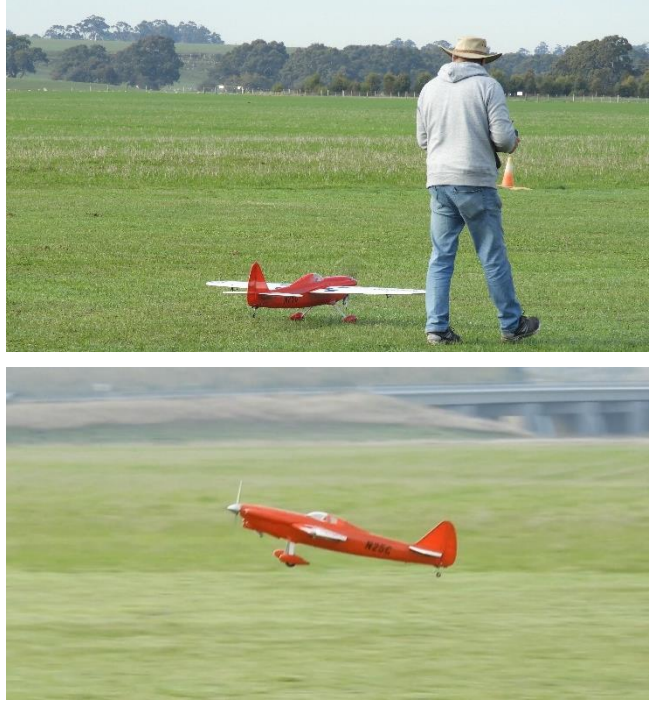
And the Shoestring takes to the air for the first time...