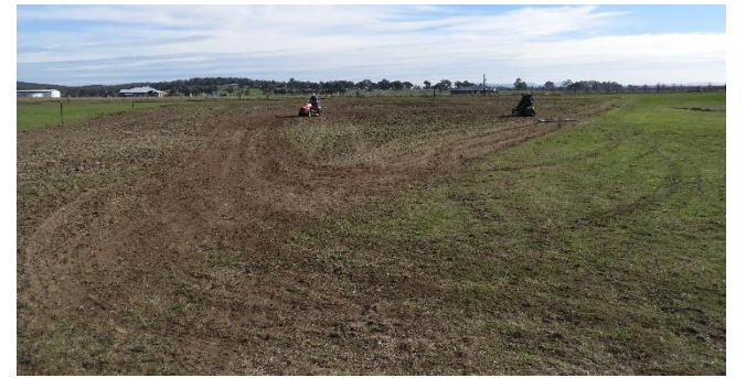
This shot is looking due west along the extension.