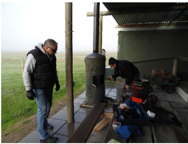
As you can see it was quite foggy in the morning but it turned out a nice day.