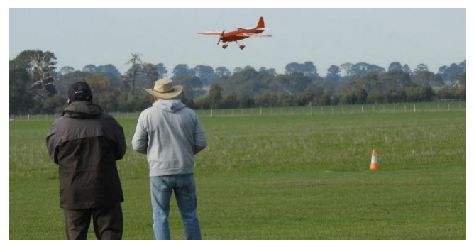
And almost back on terra firma...

Whilst I am happy with the way the model fly's, I need to do some work with the motor as it cuts out at low throttle. It's a problem with the low range adjustment on the motor which I will retune.