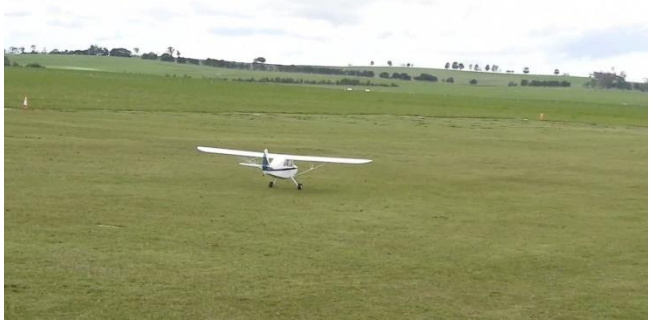
The moment of touchdown. What a relief !!!

Fortunately it came in nicely and was easy to land – not even a bounce, very strange.