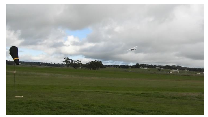
It veered to the right once it got up speed and didn't respond to rudder but lifted off and managed to climb out ok. At that stage it seemed under control.

After taxiing out to the centre of the strip I turned into wind, did a final control check and opened the throttle. It tracked straight for the first 20m or so, lifted the tail then it started to veer to the right. After lift-off it had this tendency to crab like it was side slipping and I gained height as quickly as was possible. The OS95 had sufficient power given the type of model and also it's not very heavy and probably under 7kg.