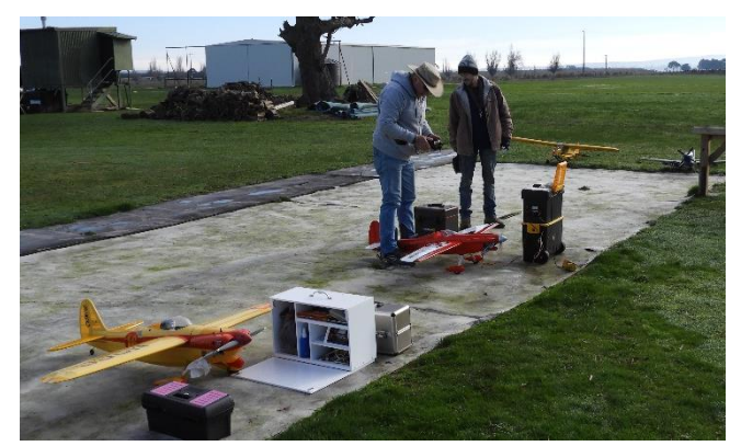
The Phoenix version of the Shoestring is about the same size as my old Great Planes Shoestring but it is much narrower in the fuselage. I guess more semi scale than the GP version.

Overall, the model was easy to put together for the most part, the only disappointing part was the rudder fin.