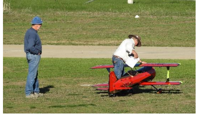
One of the Albury members was taking advantage of the perfect conditions to fly his big Pitts known as "The Beast". I'm pretty sure that's what it's called. He put on a good flying demo.