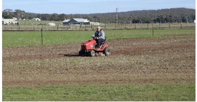
The old boundary fence cut across the E/W runway at an angle – that constraint has now been eliminated.

With the extension work we have also effectively pushed the E/W runway alignment further south by several metres (can't remember exactly how many). This has increased the clearance between the runway and our facilities as a matter of safety and to ensure we are in compliance with all the regulations.