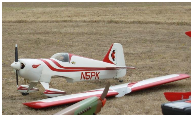
Library photo taken at Warrnambool on 2<sup>nd</sup> March 2014.

I (Roger) have for sale the Kraft Super Fli fitted with an Irvine 72 engine which belonged to the late Graham Waterhouse. It sustained some damage when it was last flown probably late 2016 or early 2017. The engine cut out resulting in a forced landing in the outfield which tore out the undercarriage. The U/C then damaged the underside of the wing. Graham repaired it up to the repainting stage.