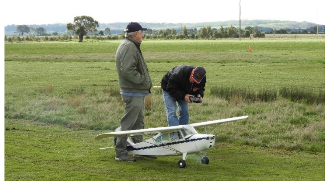
With yours truly at the controls it was time to taxi out to the strip for the maiden flight.

Glenn's having eye sight issues at the moment so he asked me (Roger) to do the test flight. I asked Graeme to get my camera and video the flight then taxied the Aeronca out to the strip. It handled nicely on the ground, no tendency to nose over or anything like that. Admittedly the conditions were near perfect for a test flight, just a light breeze from the south.