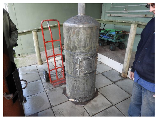
The new heater awaiting installation.