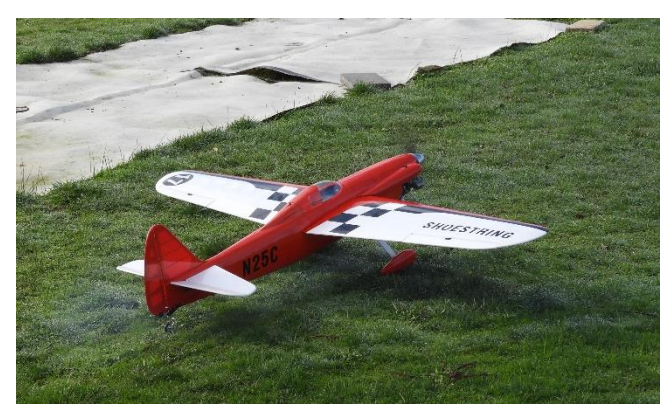
Graeme taxiing the Shoestring out for its maiden flight.

It wasn't a big job to fix it though as I just used a piece of the cut out film to recover the cut out section after the fin had been fitted.