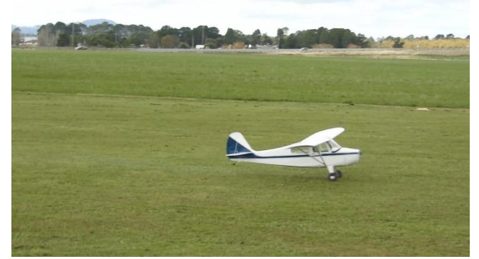
The take-off run has commenced, so far so good.

After taxiing out to the centre of the strip I turned into wind, did a final control check and opened the throttle. It tracked straight for the first 20m or so, lifted the tail then it started to veer to the right. After lift-off it had this tendency to crab like it was side slipping and I gained height as quickly as was possible. The OS95 had sufficient power given the type of model and also it's not very heavy and probably under 7kg.