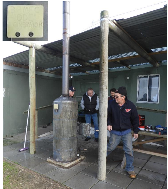
The plaque on the front says BRMFC MODEL INCINERATOR !!! Let's hope not.