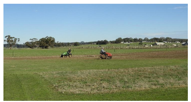
Murri and Peter W. smoothing out the runway extension with the mowers. Photo looking south and taken on Sunday 9<sup>th</sup> June.

Following on from the levelling and seeding of the east/west runway extension by the farm manager's contractor on Thursday May 30<sup>th</sup>, Murri Anstis and Peter Weston have been smoothing it off further by towing an old gate over it with the mowers. Initially we thought more machinery might be required but it seems to be coming up quite good. We have to remember it is only the runway run off rather than the take-off part of the strip. With the extension we'll have about 110m of mown runway and about another 40m to the boundary fence which will be reasonably smooth but not mown short. We don't fly off it all that often, but it's comforting to know the runway is available and safe to use.