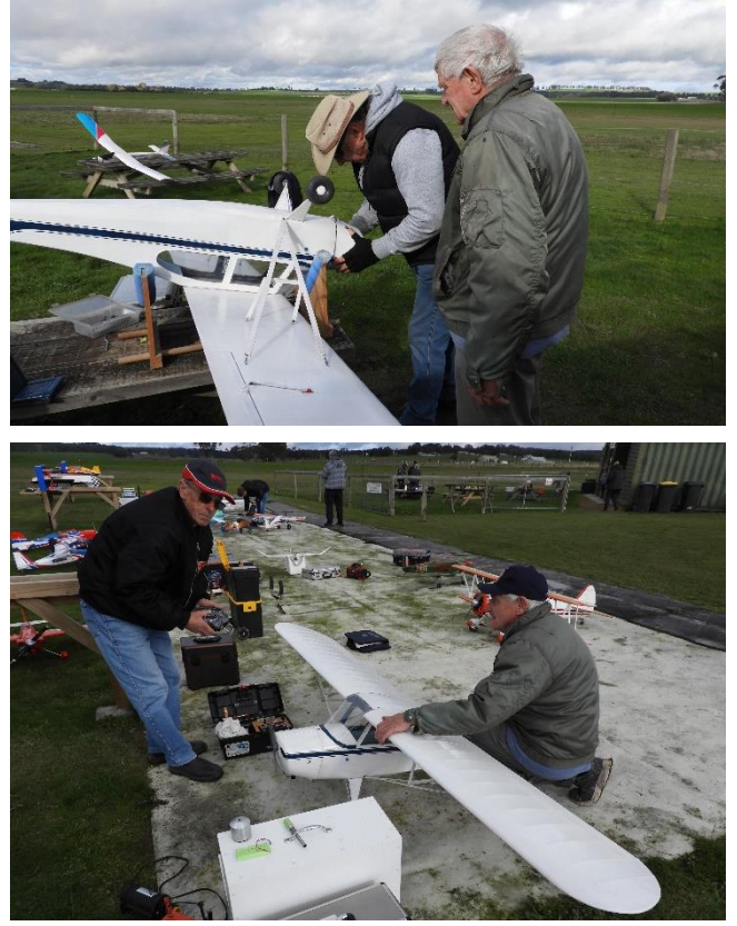
Time to fill the tank and run the OS95 FS. The engine ran like a Swiss watch with hardly any vibration.

We were happy with the CofG, it being about 25-30% back from the wing leading edge, the wings looked straight although no washout. With everything in place it was time to run the engine. It started and ran okay and the way it ran imparted confidence that it would be a reliable power plant.