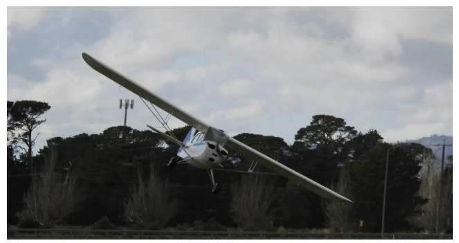
A final bank to line up with the strip.

At the time I didn't think I would get it down in one piece and wanted to land straight away. I pulled the power off then to my amazement and relief it became controllable, but I was still expecting it to resort to its erratic behaviour at any moment.