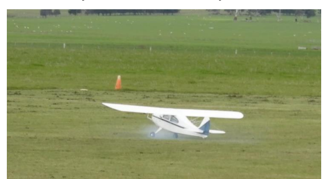
And roll to a stop. The OS95 was still running so that part is all good.

I suspect if the rudder was a major factor together with the bit of left thrust then pulling the power off would make the rudder less effective and thereby reinstated control.