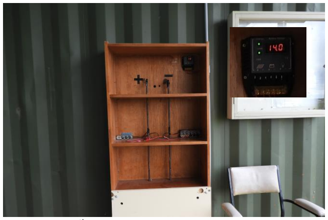
On Sunday 25<sup>th</sup> June it was overcast but still showing 14.0V on the digital display as shown by the inset photo.

Many thanks to Paul Ruddle for setting up the system.