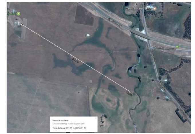
It measured 990m from the edge of the flight line to where the Cularis landed. Murri definitely got his weekly exercise that day – it is pretty hard going on the recently ploughed field!!!