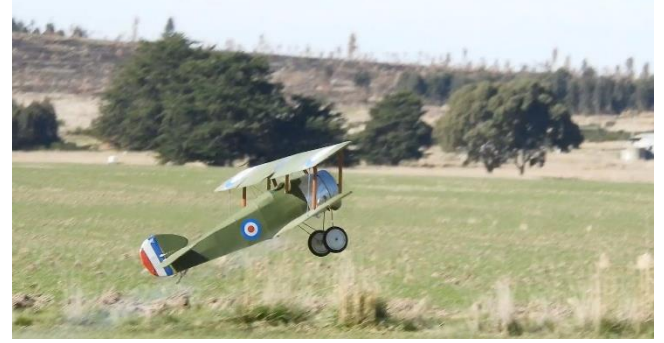
Lift off didn't look too bad – a little steep but wings level and the 91FS had plenty of power to pull it skyward.