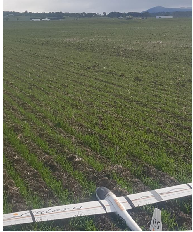
Looking back to the field from where the Cularis landed. The big shed is visible and you can just make out our facilities to the left which is almost 1km distant.