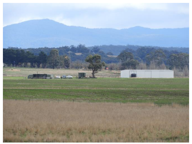
This shot was taken from the side of the hill along Trawalla Road looking back at our field. Camera has 60x zoom which brought it up close.

I went with Murri in his Ute down the freeway to Trawalla Road where we parked and carefully got over the electric fence (not wanting to damage anything – I don't mean the fence!!!) into the paddock walking west back towards the field scouring the landscape for the 2+m glider.