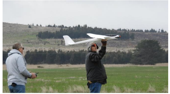
Graeme has gone electric too after buying a foam motorized glider.