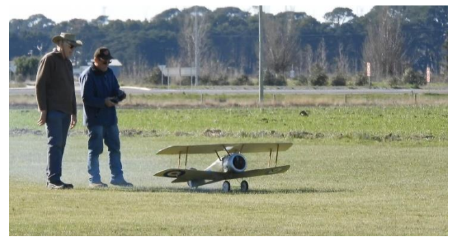
Max doing final control check with nervous Jeff looking on.

The following snaps are frames taken from the video I took of the whole flight which unfortunately ended with a stall and spiral in from about 40 feet. It became apparent as soon as it left the ground that the CofG was too far back making it extremely difficult to control. Max almost got it around a full circuit trying to bring it in but the stalling got too difficult to control and worse with the power reduced trying to land.