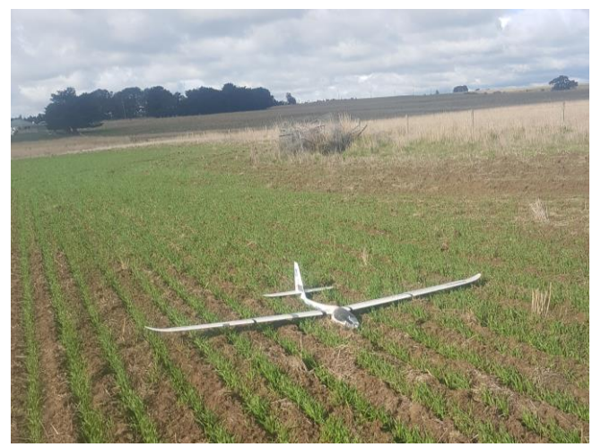
This is where it came to rest. The mound behind it is remains of tangled fencing wire with grass growing through it. It is visible in the Google Earth satellite photos enabling a fairly accurate measurement to be taken.

drove back to the field. Murri then set off on foot to retrieve it now that we knew where it was located.