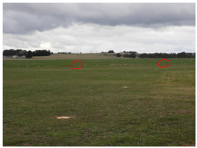
Witches hats (circled in red) have been positioned about a metre inside the crop line at the projected point where the sides of the WNW strip intersect.

For a change rather than battling crosswind on the main strip I thought I'd try the old Shoestring on the WNW strip that heads toward the big shed. No problems on take-off, however on landing it quickly becomes apparent it is difficult to line up because the strip doesn't continue beyond the main runway. Later in the day Murri and I put a couple of witches hats about a metre inside the crop line to indicate the projected sides of the WNW strip. We need to do the same with the E/W strip on the south side. Of course they'll need to be shifted from time to time as the crop grows or the farmer commences harvesting.