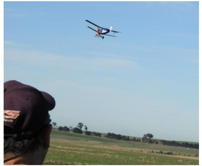
The little Fokker (it's only about 400mm wingspan) performed well in the fine sunny conditions. Murri tells us it has since had a haemorrhage inside – one of the tiny linear servos attached to the main board has stopped working and it is very difficult to repair/replace.

The charging station is fully operational again after the faulty solar panel was replaced recently. It seems to be getting a fair amount of use with the surge (no pun intended) in electric models.