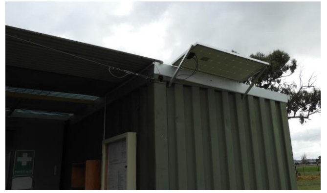
The new solar panel has been mounted on the side of the container roof instead of up on top. The photo shows how overcast it was while still charging the battery at 14.0V.

n Sunday 25<sup>th</sup> June the forecast wasn't all that good but it was quite pleasant at the field albeit cold of course. The wind was light/moderate from the west which isn't our preferred direction at Trawalla like it was at Yendon.