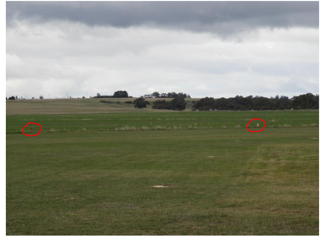
The witches hats should make it easier to line up when landing on the WNW strip.

he cupboard doors above the bench top were taken down on Sunday 25<sup>th</sup> June so Graeme can take 7 or 8mm off the top to provide clearance with the ceiling. One of them has been scraping on the new ceiling lining for a while now.