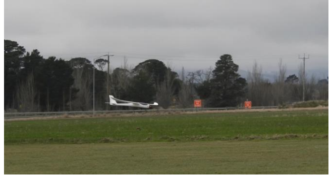
After an 8 minute flight it was time to land. (The time difference on the video clips works out at 8 minutes).