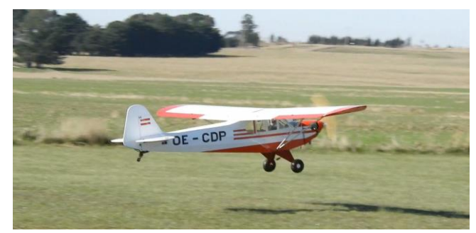
Sunday June 4th. Max's 1/3 scale Cub on take-off.