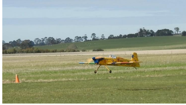
After a few circuits and aerobatics Alan brought the CAP in for a 3 point landing.