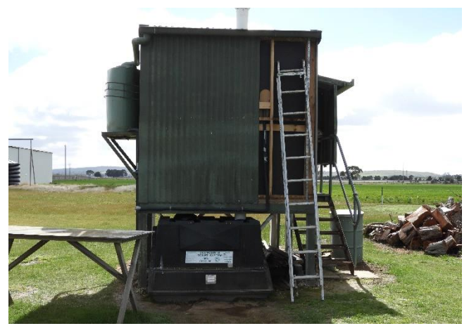
Photo taken 27<sup>th</sup> August 2017 while fixing the burst pipe. Looks like it has burst again.

It looks like we'll have to run the pipe underneath the floor and possibly use poly pipe as well. The minimum temperatures at Trawalla must be colder than at Yendon; in 14 years at Yendon we never experienced the pipes freezing and bursting. The orientation is pretty much the same as it was at Yendon.