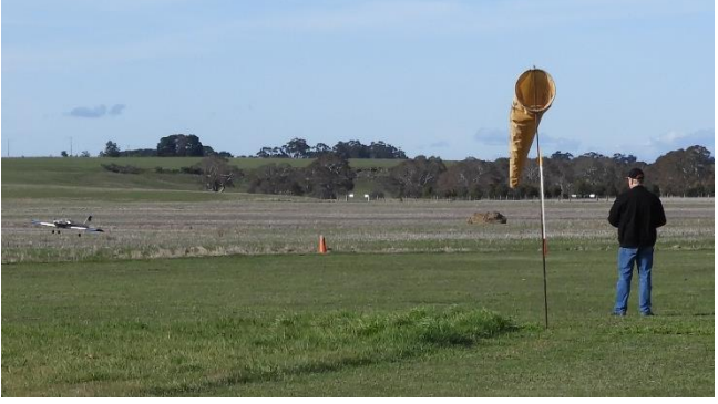
Nigel is also doing low slow passes over the strip with his 46 powered low wing sports model.