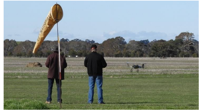
Alan doing a low slow fly-past with his electric SE5A. Photo taken on Sunday 1<sup>st</sup> July.

hilst we've had some lousy weather most weekends we manage to fly. Of course when the forecast is good and it turns out nice and sunny we get a reasonable roll up of members. A few pics are included to