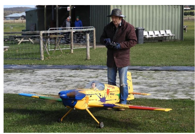
A final rev up before taxiing out to the strip.

was subject to engine loads and attended to a few other cosmetic details.