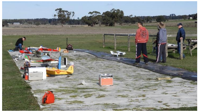
The pit area matting which we want to replace is covered in moss/algae. That could be eradicated or at least mitigated by spraying with a concrete cleaner or even a bleach like White King. Once the matting is replaced it will still do the same thing over winter – it happened at Yendon as well.