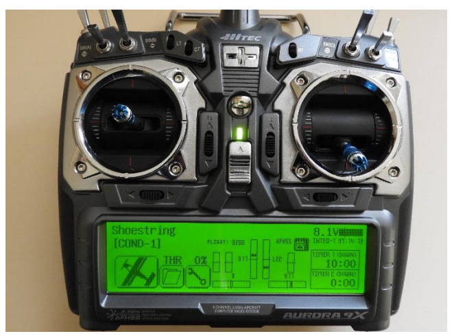
With the new Eneloop Pro 2500mAh battery pack, Hitec Aurora 9x transmitter is holding plenty of battery capacity. It was never like that even from day one.

I used the transmitter last Sunday 22<sup>nd</sup> July and after a couple of flights it was still showing over 8.0V – a solid bar where it shows battery capacity, the old one would've been down near 50%.