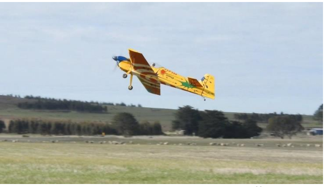
As you would expect the DLE111 had the CAP off the ground in no time. All looked good and Alan was putting the CAP through its paces to pass the requirements of the heavy model inspection which Murri was attending to.

The DLE started quite easily but was noticeably sluggish picking up from idle. Richening the high range needle a little cured that. The engine ticked over very smoothly and doesn't seem to be excessively noisy which is a bonus. The prop must be a good match for the engine/airframe not allowing it to over rev and create propeller tip noise.