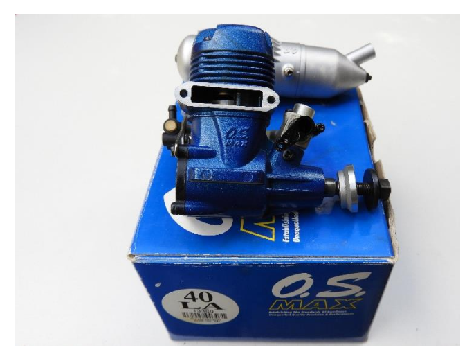
New in box – never run.