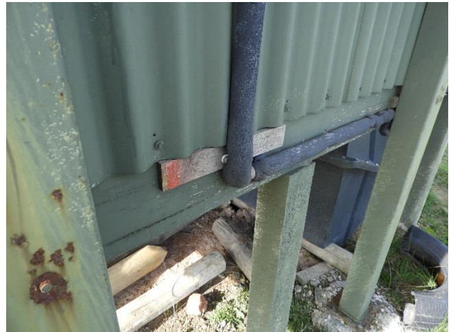
The elbow was repaired on 1<sup>st</sup> July and a clamp fitted to prevent the compression fitting coming off the pipe.