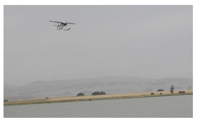
And flying around for a few circuits and aerobatics.