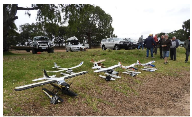
Managed to get a shot of most of the models that were there.

After the extreme heat we experienced in the lead up to the event it turned out quite mild and overcast for most of the morning. The cloud tended lift around midday allowing the sun to shine and warm up a bit.