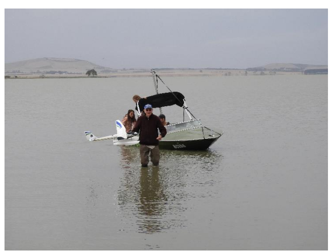
There were other people camped further around the lake shore and they kindly helped out with one of the rescues.