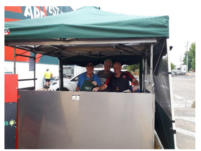
The afternoon shift enjoying themselves.