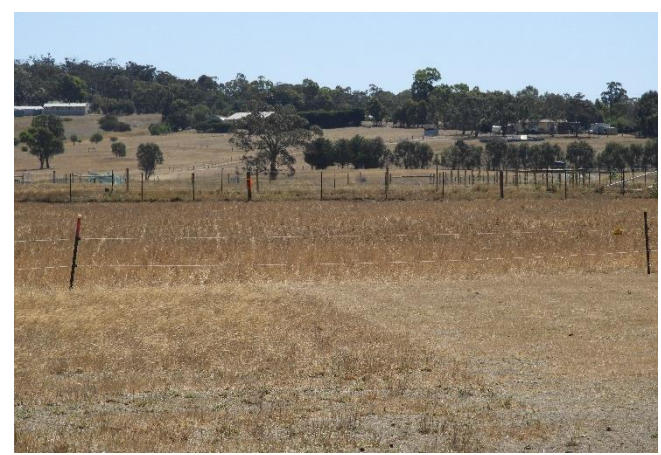
We are hoping the electric fence and thus field boundary can be realigned from the star picket on the left up to the road fence where we have tied a marker strap.

It would make the east/west runway significantly longer and much easier to land on without the electric fence cutting across it at an angle.