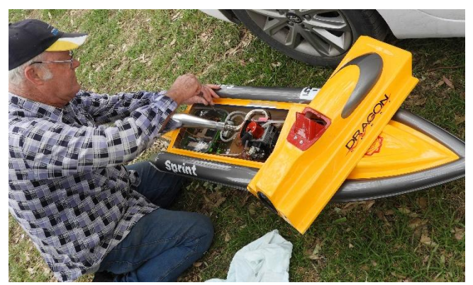
Ted doing some last minute adjustments before launch.

extra variety on the day all helping to make the day a huge success.