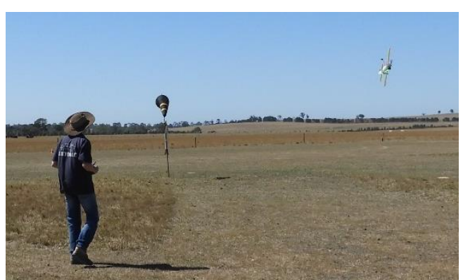
Alan doing some aerobatics after hooking up the new windsock to the pole.

he current field boundary on the south side cuts across the western end of the east/west runway. We are hoping the Trawalla Estate Manager is agreeable