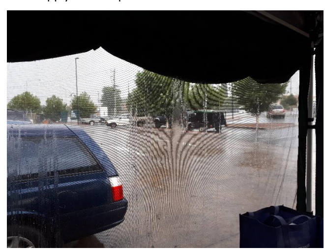
Then the rains came a bit before 10AM!!!

I shall apply ASAP to put us in the draw for another event.