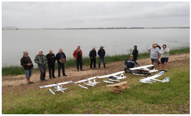
Another shot looking back over the lake.