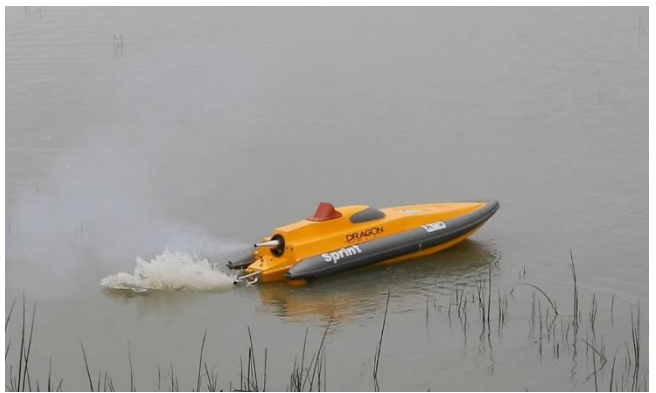
Idling out to deeper water where the prop would get tangled up with weed.

Ted's boat is a Dragon Hobbies deep V hull, 1200mm in length and powered by a 26cc 2 stroke using 30:1 ratio. Construction method is three layer hand laid fibre glass. All CNC alloy steering gear with 6mm flex shaft drive, turning a steep pitch 2 blade "chopper" prop. Cooling system has been modified and now runs a 6volt pump to enable effective cooling when idling. Estimated to have a top speed of approx. 75kph.