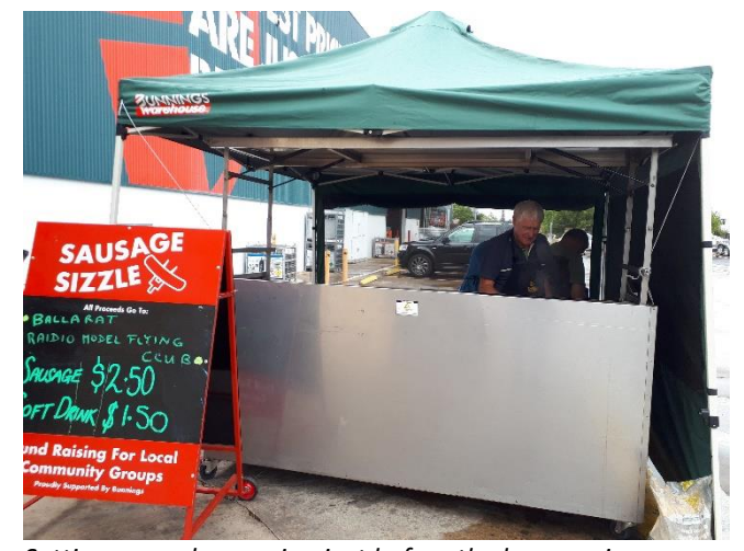
Setting up early morning just before the heavy rain came.

worth doing. We made a profit just over $900 which is not to be sneezed at and slightly better than the previous Friday in February last year. The increase can be attributed to much better drink sales brought on by the warm weather. A Saturday would double that figure but Saturdays are hard to get as there is such a demand amongst the local community groups.