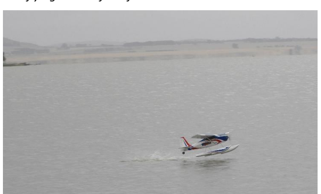
Then back on the deck, I mean water.

Whilst there were very many successful flights there were also a few mishaps requiring the retrieval either by wading out or on a couple of occasions using one of the two tinnies we had. Max and Ricky both brought their boats but we didn't put them in the water until it became absolutely necessary. Going by what happened a rescue boat should be in the water before flying starts. We were on the south bank of the lake and the wind although fairly light was southerly meaning if a model overturned it didn't take long before it was blown a long way out needing a rescue boat.