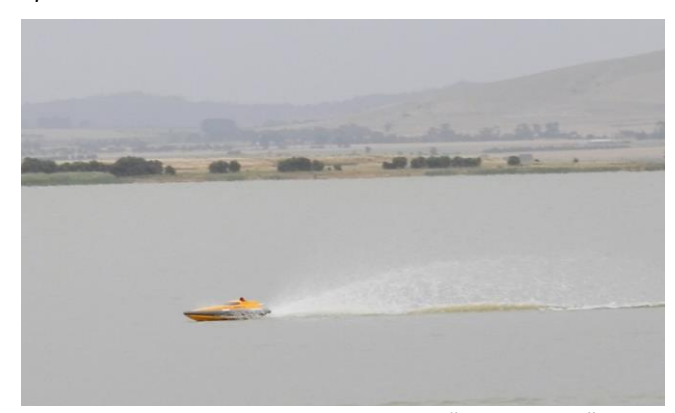
Ted did several high speed runs with a "Rooster Tail" water spout from the prop. I videoed the whole demo and it runs for almost 4 minutes.