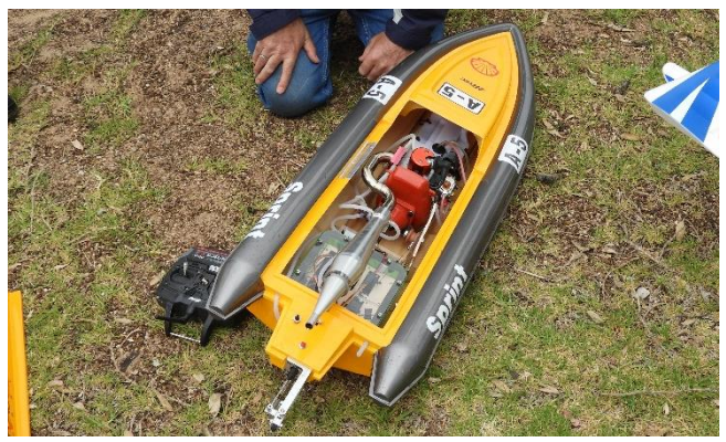
A close up shot the engine and radio installation. The radio gear is housed in a watertight compartment at the stern.

Ted's boat is a Dragon Hobbies deep V hull, 1200mm in length and powered by a 26cc 2 stroke using 30:1 ratio. Construction method is three layer hand laid fibre glass. All CNC alloy steering gear with 6mm flex shaft drive, turning a steep pitch 2 blade "chopper" prop. Cooling system has been modified and now runs a 6volt pump to enable effective cooling when idling. Estimated to have a top speed of approx. 75kph.