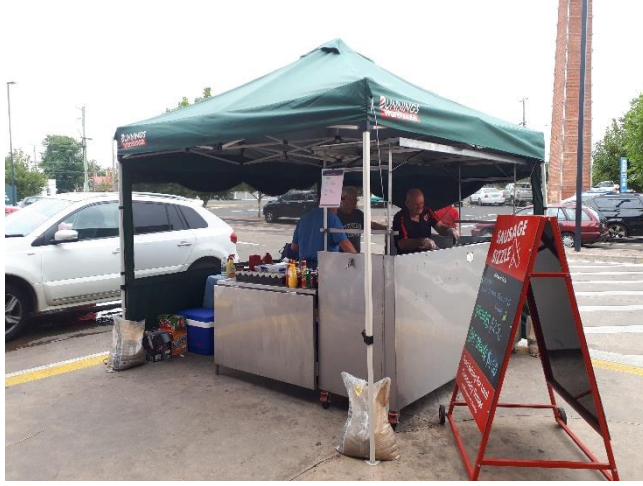
A happy snap around 3:30PM during a quiet moment.