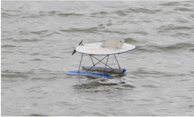
The water was a bit too choppy for Max to get enough speed for lift off. But he had a go!!!