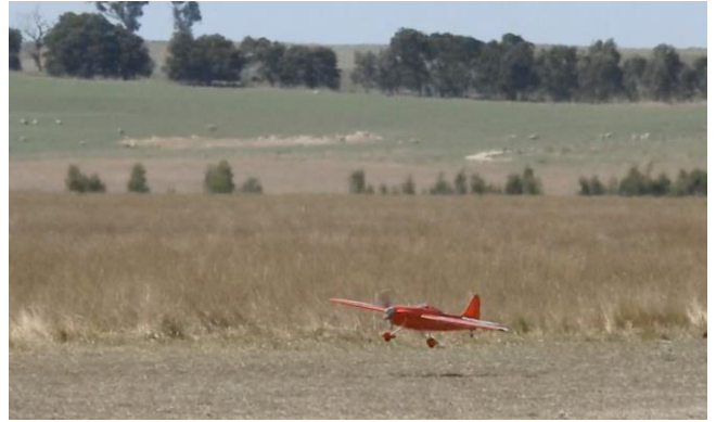
About a foot to go before touch down. And yes it was a good landing.