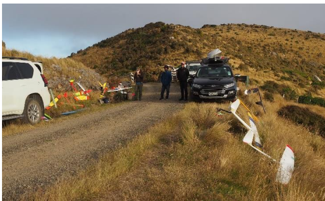
Carbon grows on the side of the road at Wainui.

Nearly all of the gliders were beautifully built, moulded, composite works of art; carbon fibre, Kevlar and fibreglass. Many, if not most, were home built, including some of the fastest. This was my first DS Fest and I must say it’s strange to see half a dozen 4wds all packed to the roof with composite planes about to be tossed off a cliff, or rows of composite planes lined up along the side of a rocky track or scattered amongst the rocks like some strange form of multi-coloured weed.