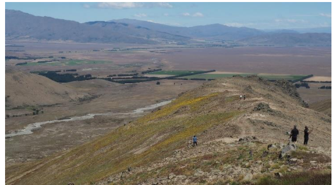
The ridge at Tekapo. Wind from the right. Circuit to the left.

Australia (WA, Qld, NT, Vic). There is no formal competition; it’s a chance to make new friends, catch up with old ones, exchange war stories, show off your latest toy or design and put your piloting and building skills to the test.