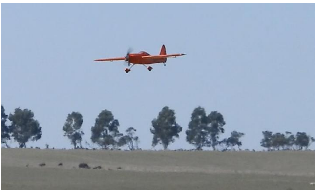
The Shoestring on final approach.