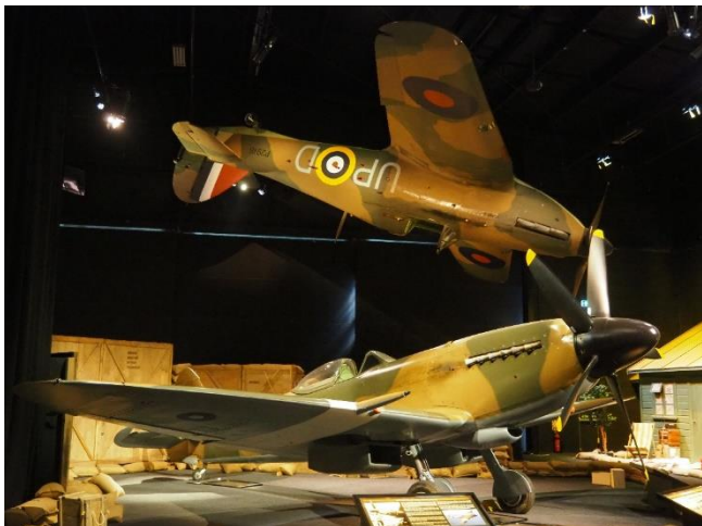
Battle of Britain exhibit. A Hurricane hanging over a Spitfire.