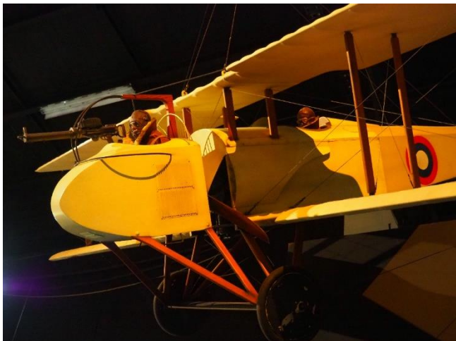
Spad A2, model. How's this for a scale subject? (Where's the prop? Oh there it is!) Behind the gunner. Ed.