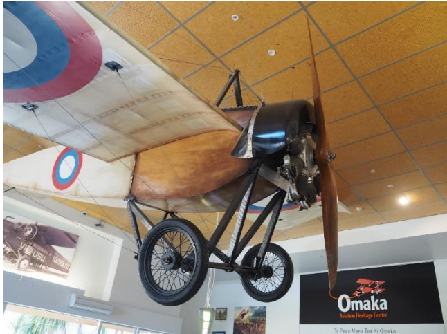
This hangs over the Omaka ticket sales counter.

exhibits from WW1 and 17 from WW2. One of which is the "Stalingrad Experience," a sobering audio visual sequence including a graphic country by country casualty count. Most of the planes are still operational. Amongst the WW1 planes, and exhibits there are also a number of flying scale models. For anyone interested in aircraft a visit to the museum is a must.