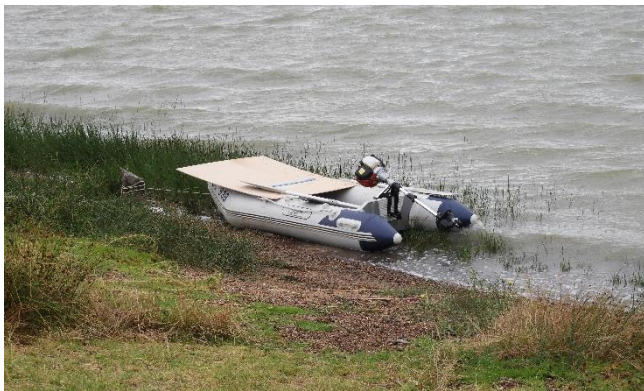
Max's "rubber ducky" rescue boat

Max brought along his "rubber ducky" rescue boat but I don't think it was actually needed this time because the breeze was on shore.