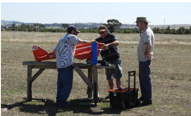
Max also had the DH88 out again after fixing the engine nacelles mounting problem encountered on the previous outing a month ago. There seems to be some other issues that prevented a test flight on the day.