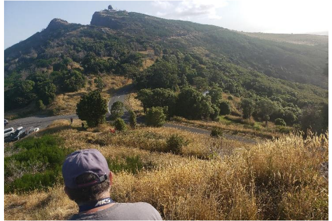
Nick landing at Cass.

There was great camaraderie amongst the pilots, with new and old faces all encouraged and welcomed. With the sun not setting until 9PM most flying days went late; BBQ tea was sometimes organised or we’d stop at a pub on the way back to recap the day’s events.