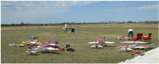
A few shots of the pit area and flight line.

It was all over around 3:30PM after which Henry tallied up the scores on the computer, printed out the results then made the presentations.