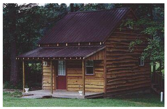
As seen by your buyer.