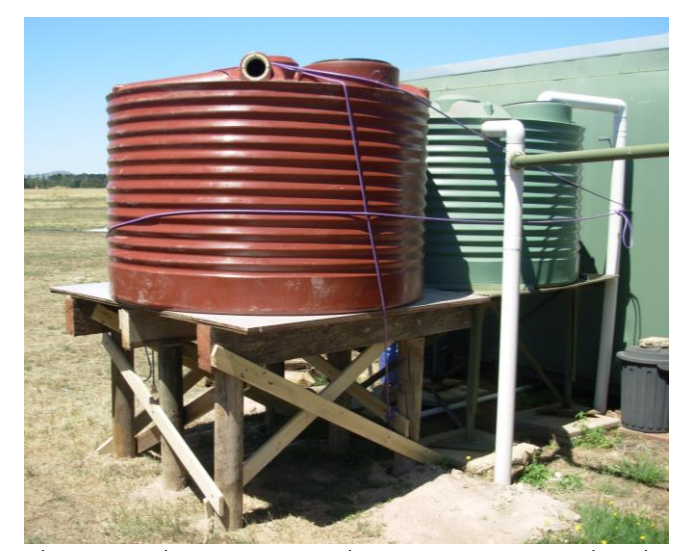
The new tank was empty at this stage so it was tied to the stand in case of strong wind.