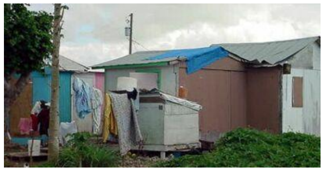
As seen by your lender