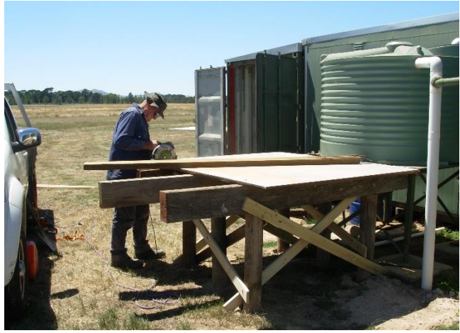
Murri is trimming the tank stand base which is a Laminex flooring product that is really hard to cut – wears out blades in no time.