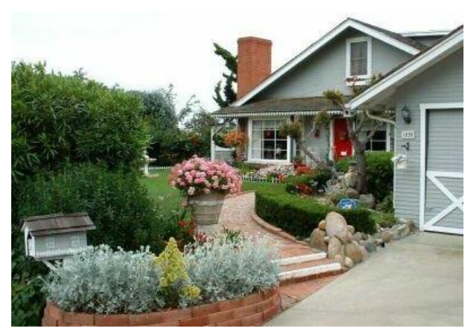
Your House As seen by yourself.