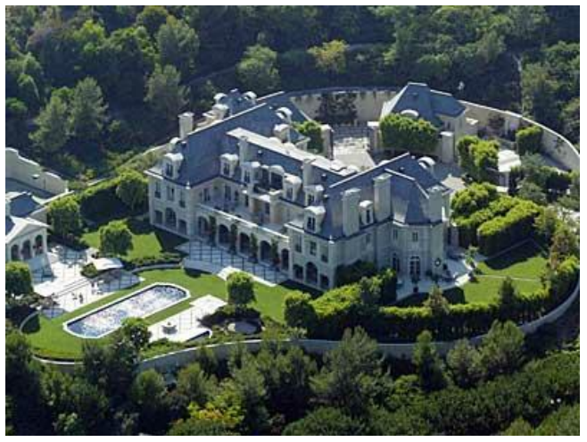
As seen by your Council Rate Assessor