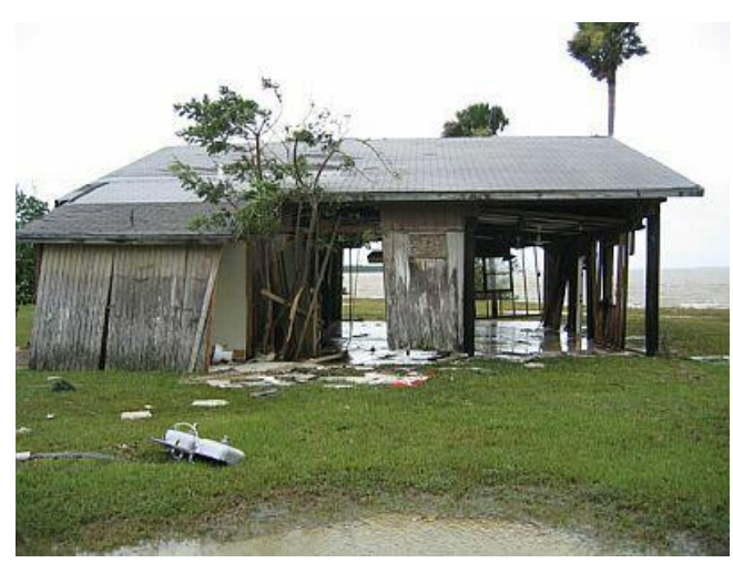
As seen by the bank's valuer