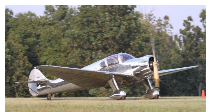
The example restored at Field Air is dark blue with polished aluminium turtle deck.

Here's a little info on the Ryan S-C taken from <u>Wikipedia</u>. Going by the article they are a pretty rare bird.