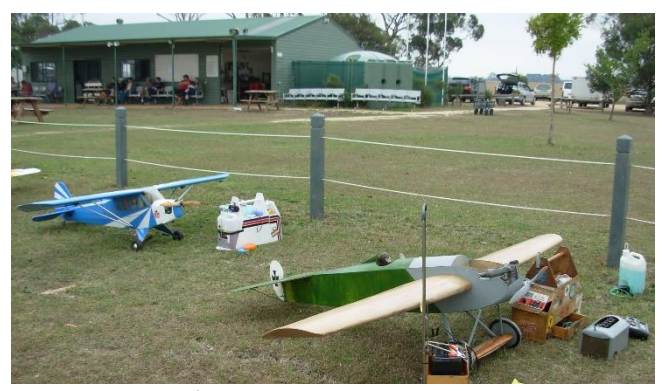
Gary Sunderland's new Fokker V21 monoplane powered by an OS200FS. This model is scratch built by Gary but entered in Flying Only. Steve Malcman's Clipped Wing Cub is behind which came 2^{nd} in Flying Only.