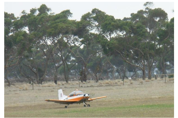
Noel's CT4 has taxied to the end of the runway. Looks like some flap extended for take-off.

The CT4 took off normally and was coming around to complete the first circuit at fairly high altitude when there was a strange noise and what seemed like confetti coming out of the cockpit. Being one of the judges I (Roger) was watching closely and thought that the canopy had blown off. Noel immediately got himself into landing mode and brought the CT4 in safely and did a very good landing as well during a very stressful moment. As it came in, we could see the canopy still attached and folded back where it had struck the dorsal fin. Fortunately his pit crew and onlookers kept an eye on where the cockpit parts that ejected landed and were able to recover the items saving Noel a lot of extra work. As it is, the dorsal fin was smashed, the rear fuselage top decking was buckled and no doubt other damage to the canopy itself. I'm sure Noel will be looking closely at the canopy latch mechanism to determine what went wrong. Maybe in the mayhem of starting the engine it simply wasn't locked properly.