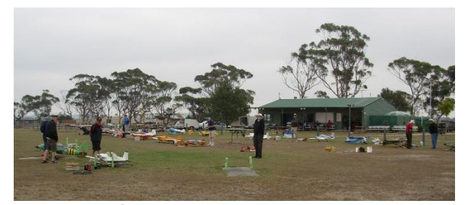
Irrespective of the weather conditions, the club house at Darraweit Guim is always a welcome respite. A place to sit to get out of the sun, the rain or the cold where you can have a coffee and a chat.

normal. (Someone said he must be getting better going by the crap he's hangin' on them!!!)