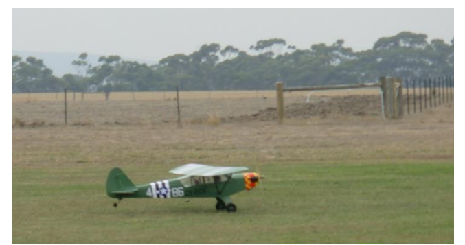
And on the take-off run...