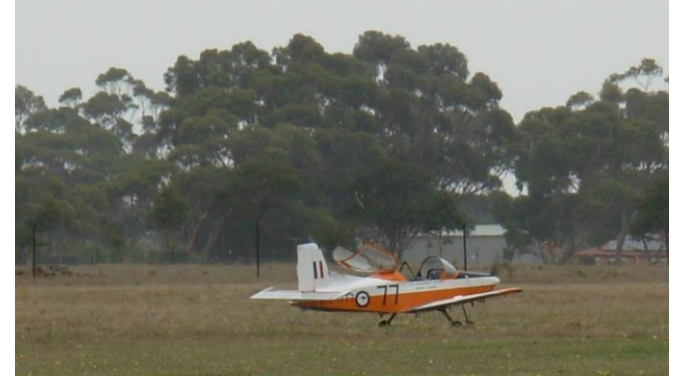
Noel Whitehead's CT4 after it landed safely following the canopy emergency.

Greg Lepp has enhanced the computer scoring program so it's no longer necessary to use the whiteboard to display the list of entrants and their scores. The whiteboard has always been a transport issue, is prone to error while transposing the scores from the computer and then assigning the final ranking. This is now done by printing the scores from the computer and displaying in a prominent place for competitors to peruse.