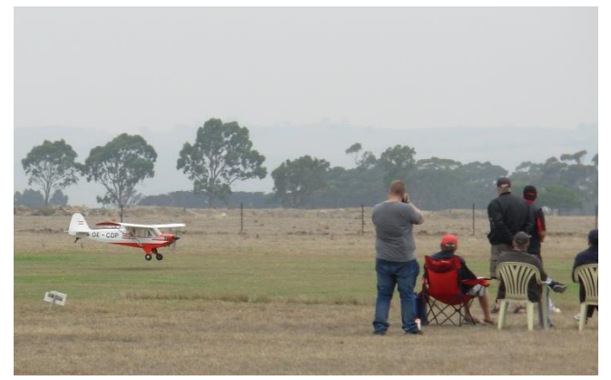
Max is coming in for a touch & go with the 1/3 scale Super Cub. It's not short on power with the DLE 111 up front. Notice the haze in the background – the hills to the east