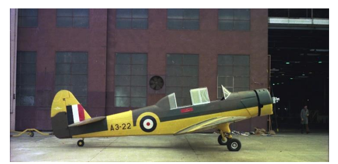
I took this photo way back in 1977 while working at CAC Fisherman's Bend during what was the company's 40<sup>th</sup> anniversary. Gee that's 38 years ago – far out!!!

As a matter of interest the CAC Wackett Trainer of the same era also had a Warner Scarab radial engine.