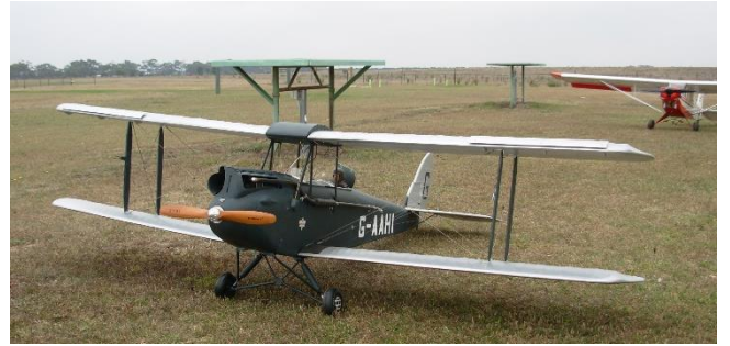
Rob Popelier from Shepparton has a new scratch built Gypsy Moth similar to Noel's but was unable to fly due to what seemed like radio binding problems.