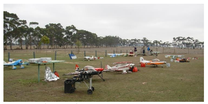
A line up of some of the models entered in the pit area. NFG have installed mains power to the fixed tables in the pit area. Riley Sills (NFG) with the black Sbach in the foreground had a very impressive flight box.