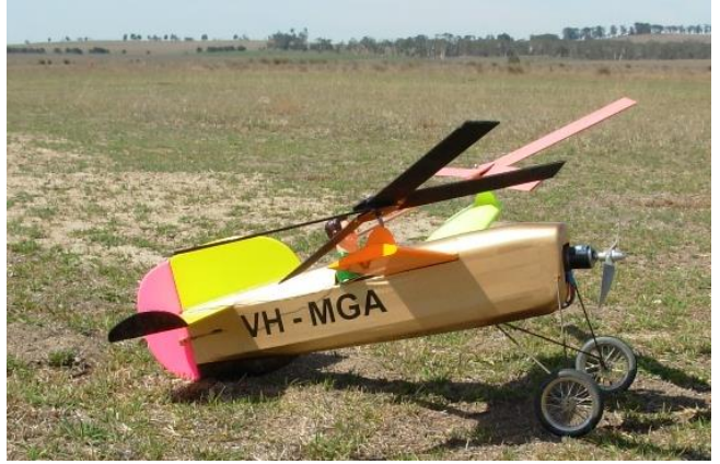
Murri said the most expensive part of it were the wheels.

the plans that were included in the RCM&E magazine April 2003 edition. The semi-scale design was based on the CIERVA autogyro concept.