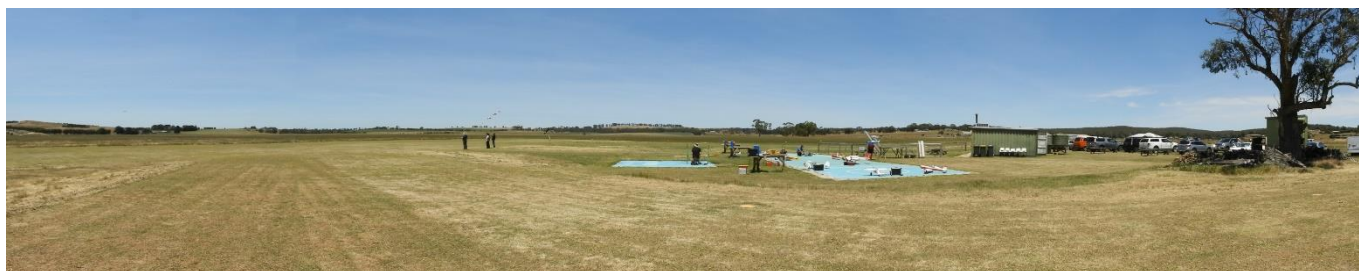
A panoramic shot of the field looking south taken on Sunday 8 th December.

The next general meeting is to be held at the Eastwood Street Leisure Centre in the Canteen , on Wednesday January 22 nd commencing at 7.30PM (Turn left after entry to the Complex, and the Canteen is on the left again). Don't forget to bring a plate for supper.