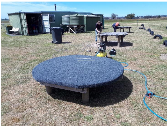
The first table (which was in the compound) came up really well. We had to cut two flats on opposing sides of the round table so there was enough material to wrap underneath.