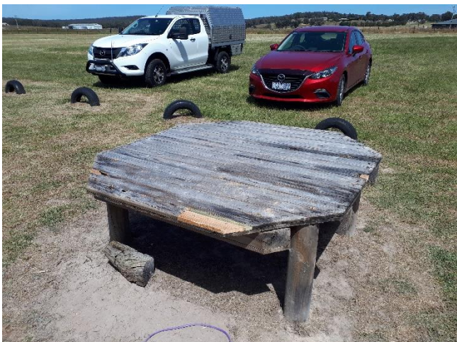
The middle table required screwing down to the stumps as well as patching some rotten boards.