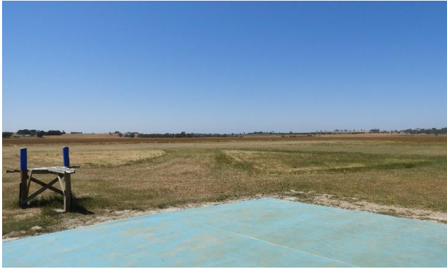
The field is all clear now the fence has been packed away. The paddock is certainly drying out now even after all the rain we had over winter.