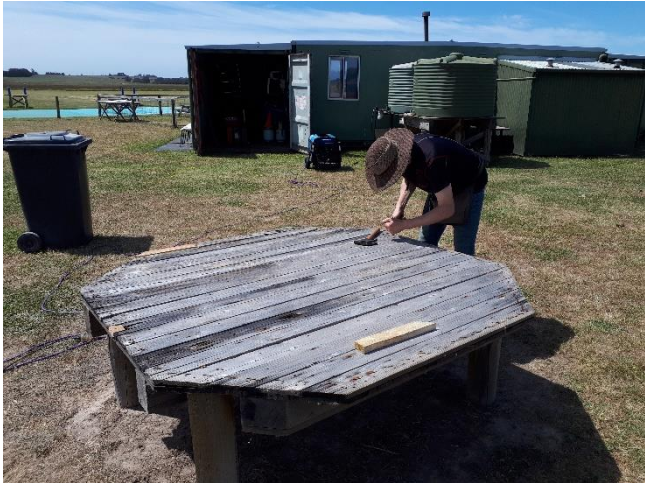
Getting old staples out and patching some broken/rotten boards.