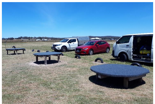
It wasn't long before we had the three tables covered taking about 2½ hours all up.

They have come up really well and are a big improvement on what we had. You can now put small items such as screws on them without the risk of falling between the gaps in the boards. The carpet also works well with hook & loop tape such as Velcro to secure models from rolling off if a bit windy.