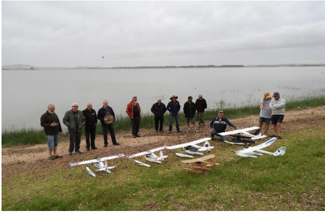
Photo from the inaugural event held on 5 th January 2019.

Last year we held it on January 5 th and met at 9:30AM in Canico Drive near the boat club. The meeting point is roughly 17km from the corner of Cuthberts Road and Learmonth Street. So I guess we'll do the same again this year.