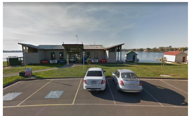
The Ballarat Yacht Club on Wendouree Parade, Lake Wendouree.

The club held this year's Christmas function at the Ballarat Yacht Club, in Wendouree Parade on Friday night 13 th December.