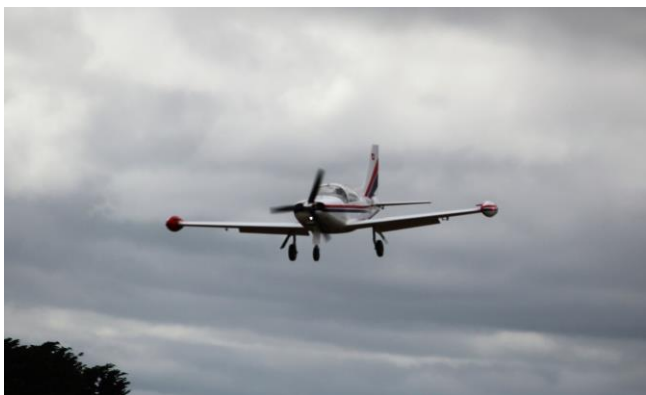
Gear down and full flap – the Marchetti was very steady & stable on landing approach.