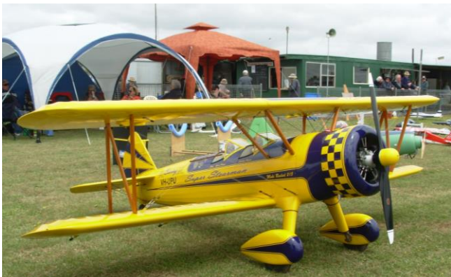
Garry Bergen's 1/3 scale Super Stearman built from a Balsa USA kit and powered by a Moki 215cc 5 cylinder radial. Received the best Biplane award.