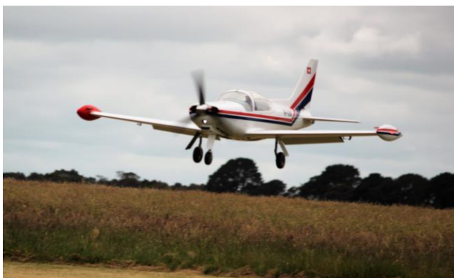
Just over the edge of the strip and moments from touch down.