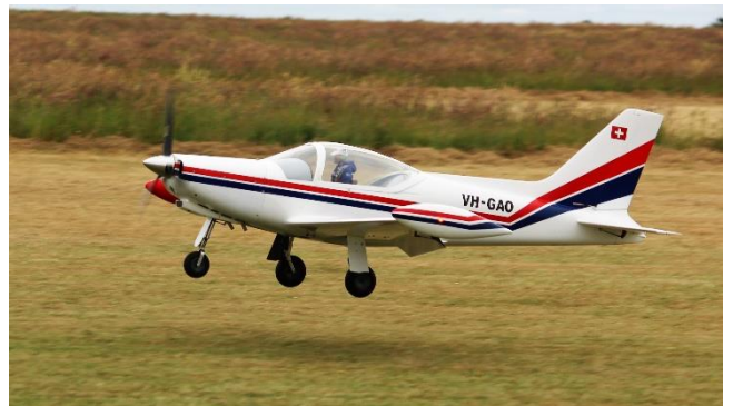
The perfect attitude for a bounce free landing. I don't think it ever bounced on landing. Nice model and well flown.