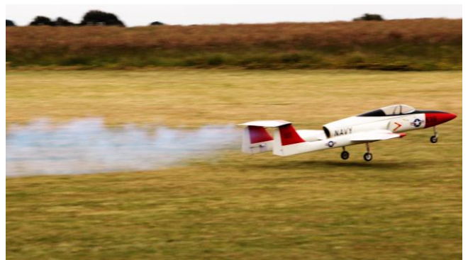
Best Sports Model – Mike Timms (Mildura), turbine model.