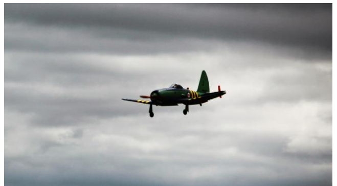
Wayne Goodwin's Westland Wyvern on landing approach. These photos were taken on the Saturday which was mostly overcast unlike Sunday which was sunny all day.