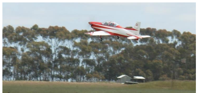
The PC21 on take-off. Peter put on a good flying exhibition and seems to be "at home" with this model now.