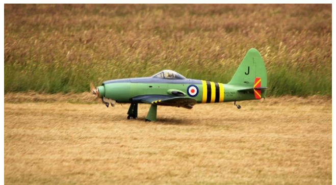
And touch down. This model has a huge fin when you see its side profile. Plus the finlets on the horizontal stabilizer would suggest the full size was prone to yawing.