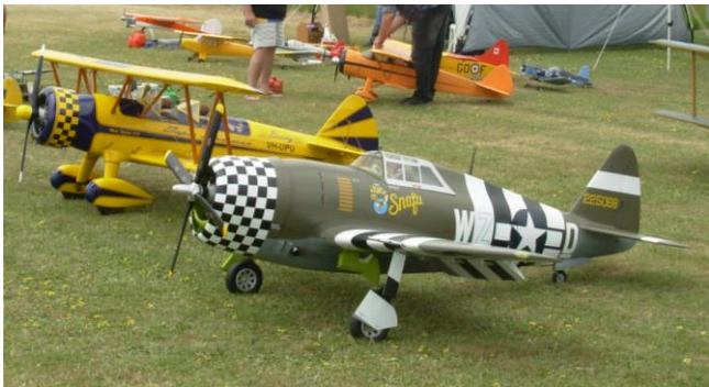
The P47 is built from a CARF models kit and powered by a Moki 250cc 5 Cylinder radial four stroke engine.