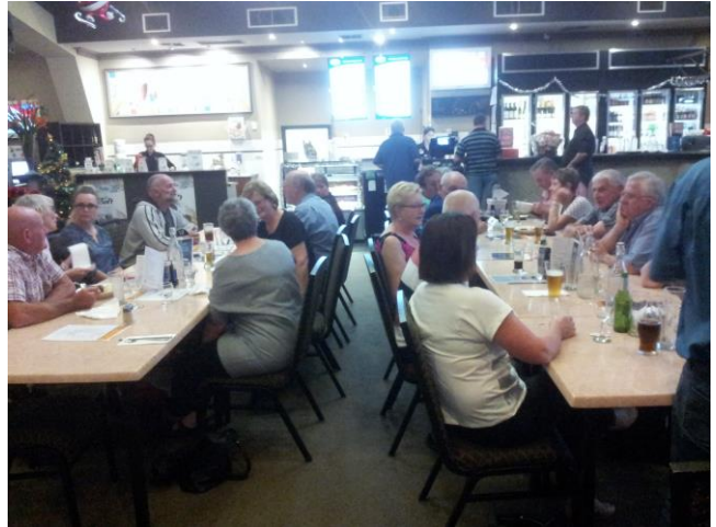
We had two rows of tables.