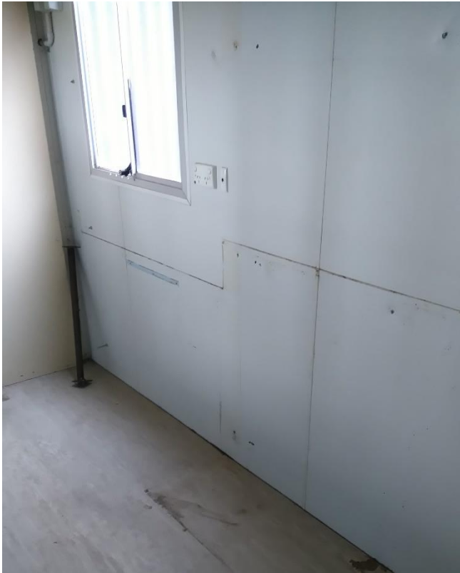
The floor and ceiling mounted cupboards on the back wall have also been removed.

On Sunday 11 th December Graeme was busy fitting the doors & handles after installing the floor mounted cupboards the day before (Saturday).