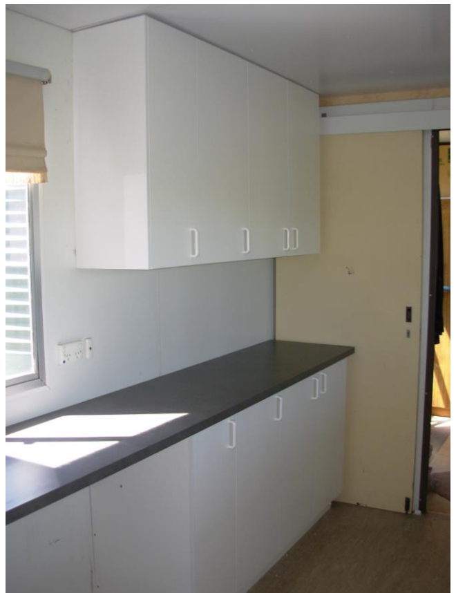
The overhead cupboard in place and all the handles fitted.