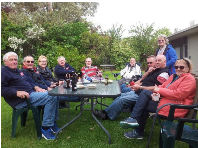
Many of the Ballarat contingent stayed at the Hamilton Lakeside Motel. A few pre-dinner drinks & nibbles sitting out on the lawn is most enjoyable after a day at the field.