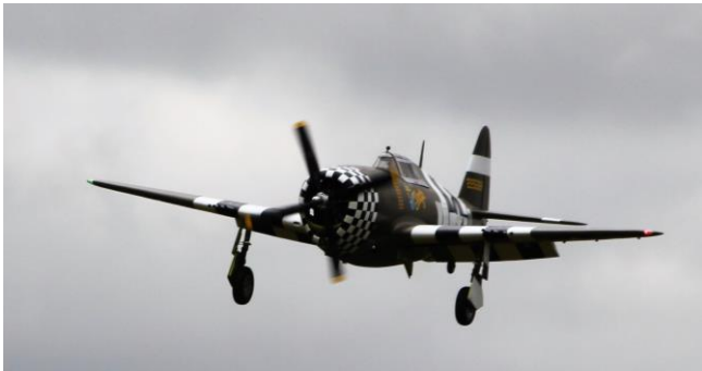
Garry Bergen's P47 Thunderbolt on landing approach. This is a big lump of aeroplane and very stable in the air.