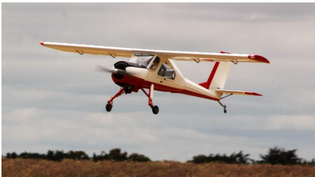
Graeme Allen's Wilga powered by a 35cc DLE petrol engine. Unfortunately on Sunday Graeme pulled the landing gear out when he landed it a bit fast in the freshly mown thicker grass near the north edge of the runway. The knuckle joints dug in as the trailing arm link retracted back against the springs and not helped by the small wheels.