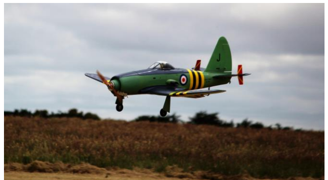
The Wyvern on final approach with flaps down.