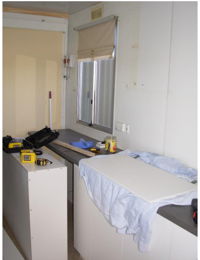
Getting ready to mount the overhead cupboard to the back wall just below the ceiling. (Interestingly the internal lining of the kitchen which is a site hut is sheet steel.)