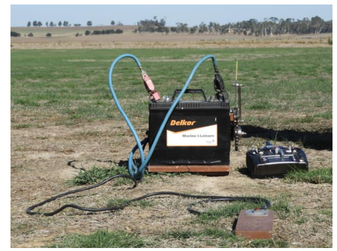
Two hundred metres out into the paddock is a stake with a pulley. The line from the winch drum goes out to the pulley and back so at least 400m of tow line. The pilot controls the winch pull by the foot operated control – a bit like a sewing machine.