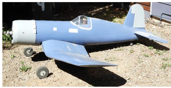
Scratch built (not by GW) and flown once at Yendon circa early 2000's. 2320mm wing span with painted finish. Super Tigre 4500 2 stroke engine. Aileron, rudder, elevator & flap servos. Fixed U/C 120mm lightweight wheels. Without engine $150.

F4U Corsair with Super Tigre 4500: $350 (Neg.)