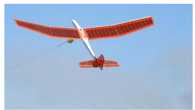
Glider is pulled up by the winch to around 150-160m. Must be somewhat less than the 200m line length from the stake out in the field.