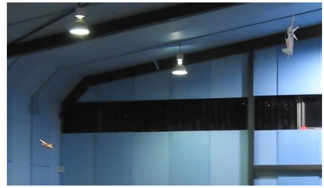
Alan Crisp doing some knife edge passes while lapping Rob Hutchings' slower model on the left.

The event is held on the first and third Wednesday of the month between 7.00 & 9.30PM. We just assume it is on until such time as BAMI decide to have a breather. The next occasion is Wednesday May 2<sup>nd</sup>.