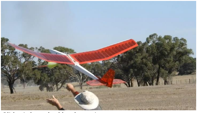
Glider is launched by the assistant.