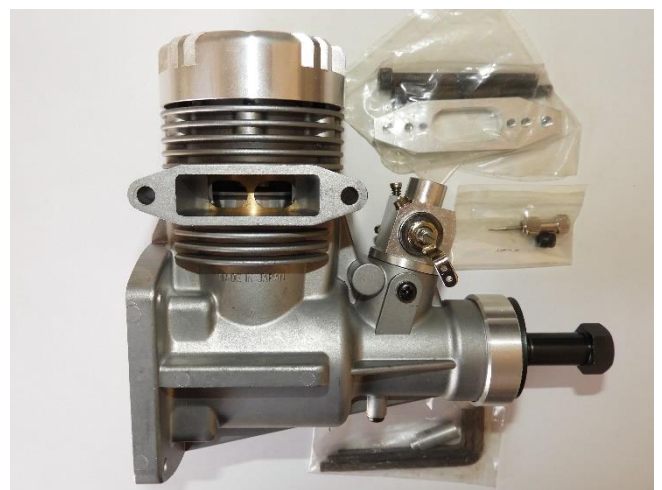
ENYA 180X TN engine, new in box – never run. Comes with a muffler adapter plate. A suitable muffler must be purchased separately."

If anyone is interested or would like more info please let me know ASAP via the editor contact details at the top of page {\bf 1}.