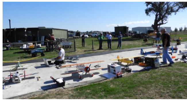
We had quite an array of models in the pits all day long.