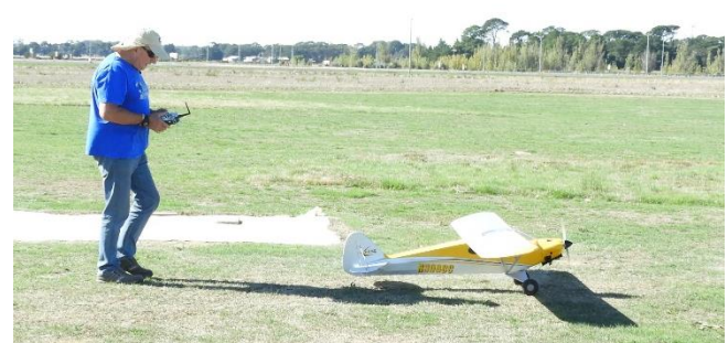
Graeme's Carbon Cub about to take-off.