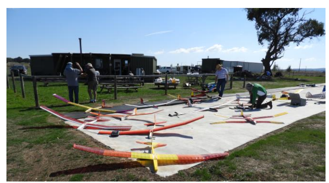
The BAMI members brought along a collection of gliders and old timer models taking advantage of the glorious flying conditions.

The rest of the article consists of photos taken with some comments.