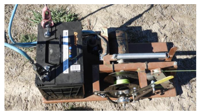
This is the winch the BAMI members use to launch their gliders.