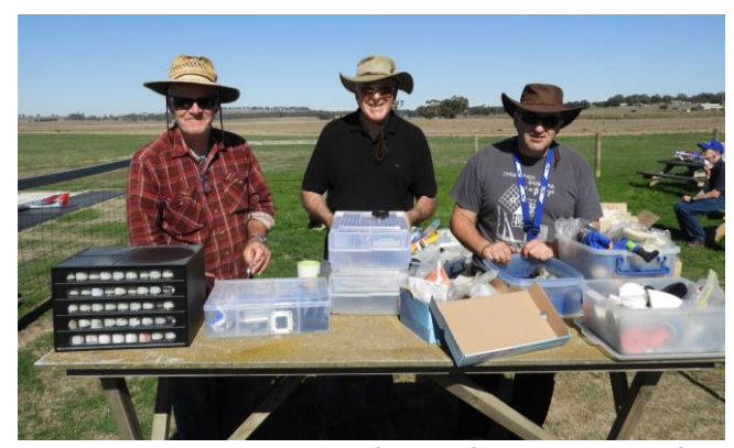
I brought out modelling gear for sale from the estate of the late Graham Waterhouse. We are gradually selling it off and basically down to the accessories items. Maybe some happy customers!!!