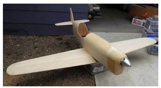
Partially framed up Mew Gull with plans. Not sure of wingspan but quite a large model. Fully built up one piece wing that requires U/C fitment, ailerons cut out and servos fitted. Plaster moulds for wheel pants available.