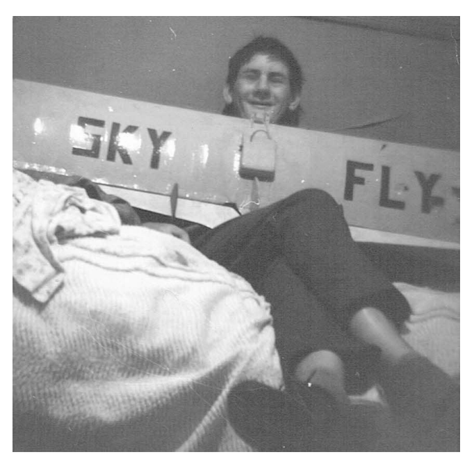
Have a look at the end of the last page.