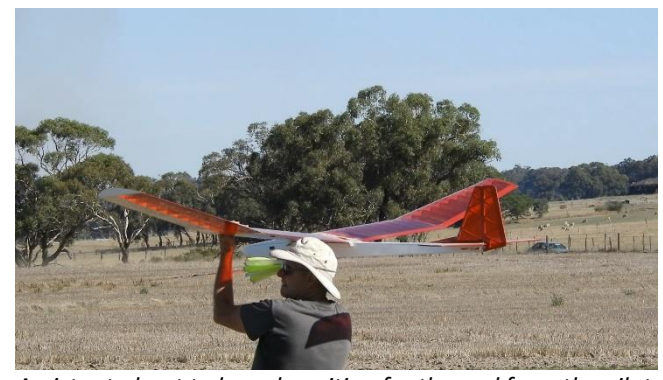
Assistant about to launch waiting for the nod from the pilot.