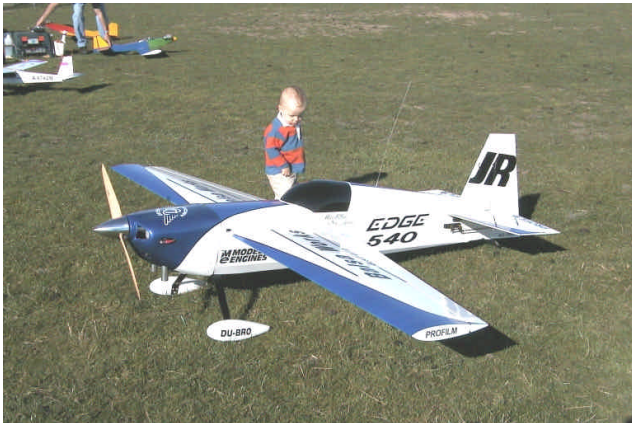
Matt's son Lachlan admiring Dad's new plane. Gee, I reckon I could just about fit in there!!

The Whatt Meter tells me 4 things: Instant current consumption, Power, Volts (for what it is worth), and most importantly it shows me EXACTLY how many mAh I've used since I armed it at the start of the day. Coupled with the fact that my Schulze charger tells me EXACTLY what went into the pack after the discharge/charge prior to flying, there is absolutely no mistake about how many flights I can have before I need to recharge. Lets say the average capacity used per flight is 300Mah (which is for a full, full-on 10 minute flight), and all of a sudden I land and see that the last flight I used 800Mah for example, I know that something has gone terribly wrong to draw that much current and stands as a warning for me to investigate prior to the next flight. It boils down to a pretty solid avionics system.