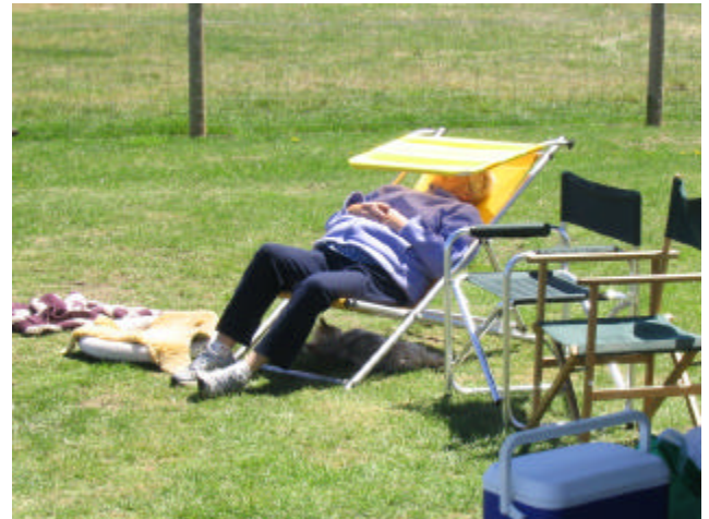
One of the many interested spectators (could hardly contain her excitement)