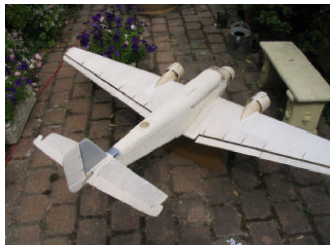
Glenn has done an excellent job on a difficult project.

I started building last July and progress was rapid until I was confronted with the corrugations on the tail feathers and the fuselage. Having spent some time trying to work out the scale size of each corrugation I found that there were three different sizes. In an effort to keep the weight down I decided to make the corrugations out of strips of balsa.