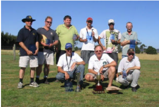
The winners circle.