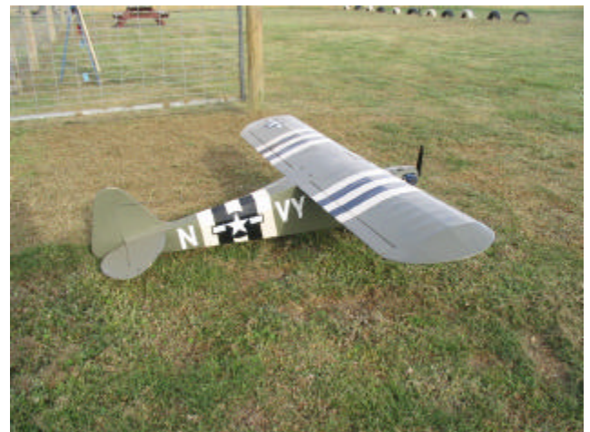
Don't have any details on this model that was seen out at the field on the 26 th January (club meeting night).