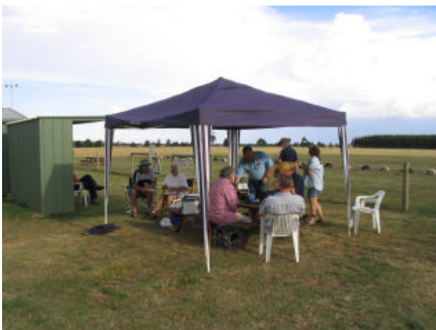
Some of the members enjoying a BBQ tea before the meeting.

Our first meeting of the year was held out at the field on Australia day. Being a public holiday it was expected that we might have been able to have a flight before the meeting, most of us were fooled by the weather it was really windy in the afternoon but around five it dropped and conditions were perfect. We had a nice B.B.Q tea shared with a million flies. The meeting got underway on time at seven. See the usual meeting notes below.