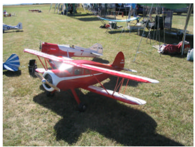
A very impressive looking big Waco bipe.

Fortunately mishaps were few. However Norm Edmunds misjudged his landing approach with his large Cessna Skymaster twin and landed in the long grass short of the runway causing some damage.