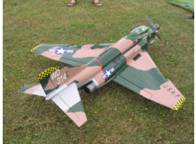
One of the new ARF F4 Phantoms owned by Brian Munns of Geelong. Powered by a 91 2 stroke it flew impressively.