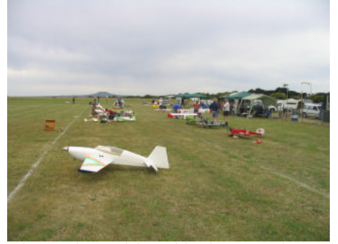
A line up of some of the models. There were a lot more there than what is shown here. It is a big field and everyone spread out.

There was a good selection of items for sale in the buy and swap tent and some good bargains to be had.