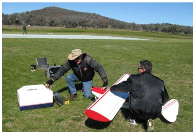
It's show time folks! The pressure is mounting as Graeme starts the Magnum 120 FS in his Super Cub.

In winding up it's great to report that there were no crashes over the entire weekend.