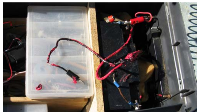
Graeme got a little overheated in Albury, this time it was the battery in his flight box.

Graeme got off to a good start, after assembling his model he noticed smoke billowing from the top of his flight box. Panic stations – the top was ripped off to reveal a mass of melted wires rendering it unusable for the weekend.