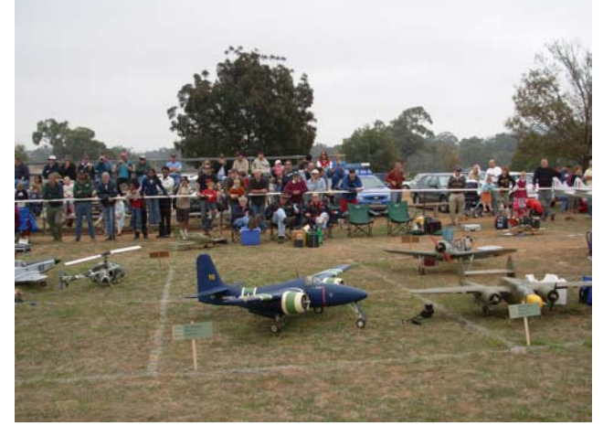
Rod Mitchell's Grumman Tigercat and P61 Blackwidow can be seen here in the foreground. Both were winning entrants.

Although the number of entrants was about normal it was very noticeable that the number of ARF's is increasing to the point that they now have there own section. For the first time since we have been going there was a helicopter and a jet. I fail to understand how a helicopter can be judged in the same comp as fixed wing but judge they did! under Wagga rules.