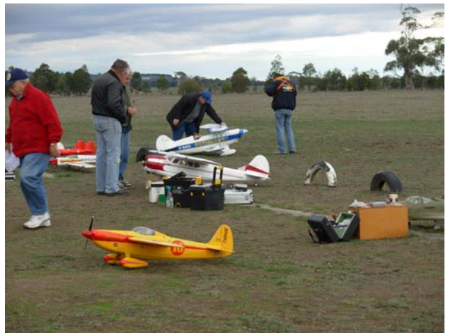
Some of the models entered on the day. Glenn's new Cessna 195 which can be seen in the middle of the photo had its competition debut.

It was nice to see four entries from our own club; Russell had the misfortune to have an engine out just after takeoff causing the Corby to crash and preventing him from any more flying.