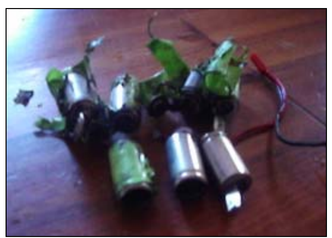
The remains of the battery pack. The ends have blown out of the first two cells.

I came home about 1½ hours later and there was a strange smell in the air – "Dad, your plane exploded". After about an hour there had been two loud "pops" and a burning stink in the air. Luckily my son realised what was going on, pulled the plug and took the plane outside. If he wasn't on the ball I could have burnt down the house.