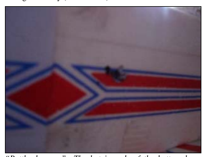
"Battle damage." The hot innards of the battery have melted through the foam.

The battery was a mess; two cells had exploded and had literally torn the pack apart. The remaining cells were all bulging at the end due to the build up of internal pressure. Luckily most of the mess was contained inside the plane but the foam battery compartment had all but vanished into a mess of charred polystyrene. The body was full of black "charcoal" bits and the inside looked like it had been hit by a shot gun; in some places the hot shrapnel had gone right through the body (10mm foam).