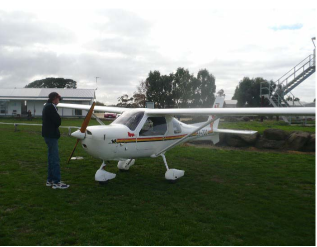
Russell Aggett's son looking over the Jabiru.

learn to fly on the 19/3/08 and have 13 hours of dual flying up and have just started to land the plane so I still have quiet a few more hours to go before I go solo which all up from start to solo is 25 hours. After that, I've got more hours to get up before I can take a passenger with a limit to how far I can fly, then I have even more hours to be able to go cross country with unlimited flying, so all up its about 50 hours.