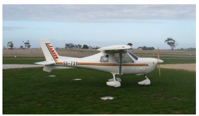
Russell Aggett's Jabiru at Ballarat Airport.

The plane that I have purchased is a LSA Jabiru registration number 55-0731, it is a factory built plane, has a 2.2 four stroke motor and 2 seat dual controls. The Jabiru has a climb rate of 1500 ft/min, a cruising speed of 95-100 kts, and burns about 15L/hour. It has a 60L tank so it has about 3½ hours total flying with about 10L in reserve. Its total take of weight is about 475kg.