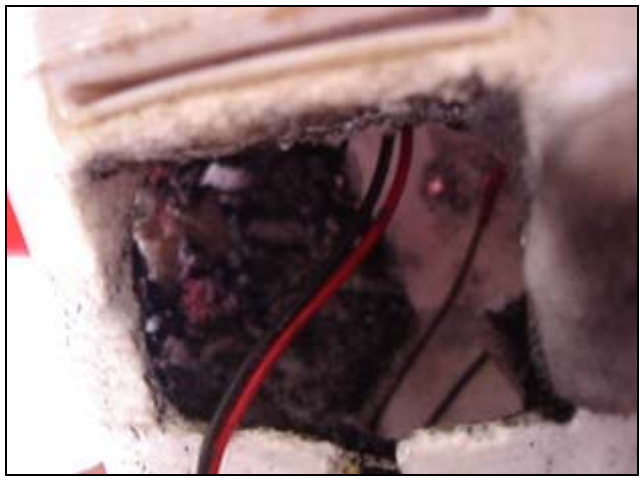
What was left of the battery bay; showing the charred polystyrene. Up to 2cm of foam was melted away.

The problem is not restricted to flight packs. NiMH is fast becoming the standard battery type for receivers and transmitters. Fast-charging and over-charging is the problem. The new battery types are less robust than the old NiCd; which can also explode if abused. When you over charge a battery the energy turns into heat and if you fast charge the heat builds up faster than it can get out and the cell will explode. Fast charging is anything faster than the wall charger supplied with your radio set, generally about 8 to 12 hours. "Peak detect" chargers switch off when the battery is full and are the only way to fast charge.