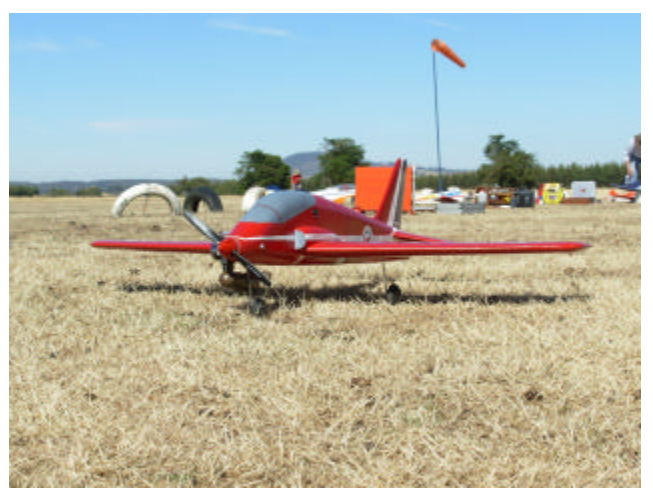
Nick's new semi scale BAe Hawk in Red Arrows livery. Flies very fast with MDS 48 motor.

My new model is a semi-scale BAe Hawk in Red Arrows paint scheme. It has a 50" (1280mm) wingspan, weighs 4lb (1.8kg) and was built from a repaired fiberglass fuse/tail and basic plans. ($5 at an auction long, long ago.)