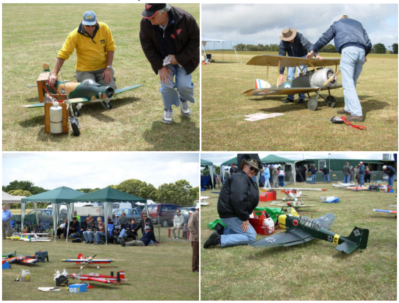
To finish off the newsletter here are a few photos taken a Hamilton 26^{th}/27^{th} November 2005.