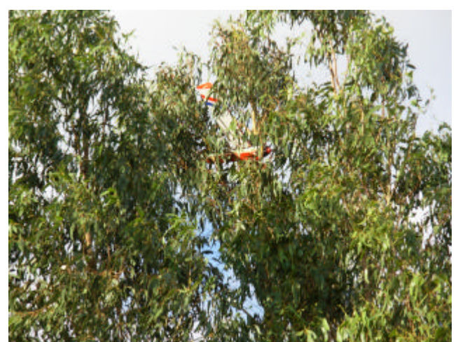
You can just see Bill's Boomerang lodged in the top of the trees on the north side of the field.

it would have to stay up there forever. Bill attempted to climb the tree but could only get halfway then Nathan came to the rescue. After some awkward maneuvering he managed to make it to the top. Once there he removed the wing and let the model fall to the ground.