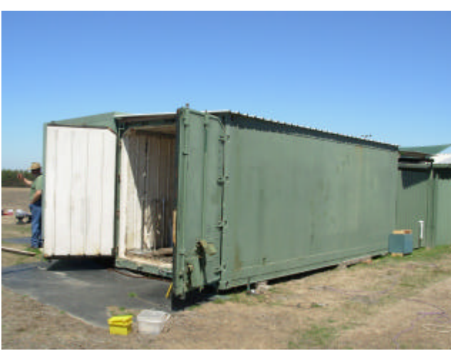
The new roof will make it a much dryer environment for the equipment in the container. The roof has been leaking for many years – it has had several silicone patch-up jobs in the past.