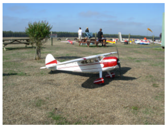
Glenn's Cessna 195 with the pits filled with the APA pattern contestants in the background. Glenn has done a very nice job of this model and we all wish him the best of luck and hope it flies well.

The power plant is a Zenoah 62, as you can see from the photo there is plenty of room inside the fuselage (that's a 24 ounce tank)