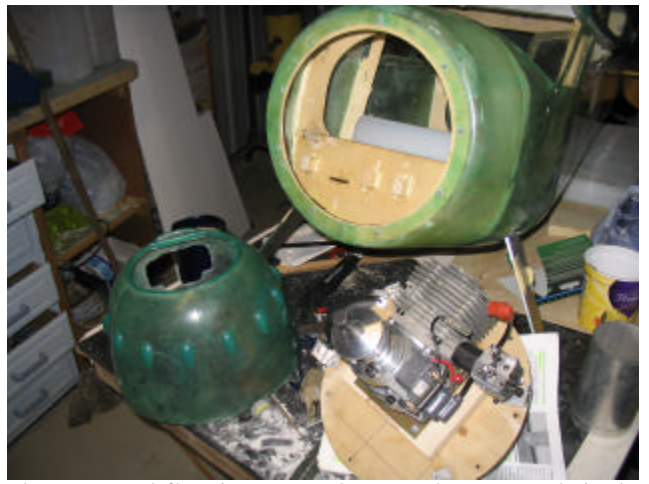
The seats and flooring cover the two elevators and single "jumbo" rudder servo. The throttle servo is mounted on

I (Glenn) took my Cessna 195 out to the field for the first time on Sunday 4<sup>th</sup> February. The model is not quite ready to fly yet but I thought that I would take the opportunity to let Murri (heavy model inspector) have a look at the type and installation of the servos before I fit the cabin detail.