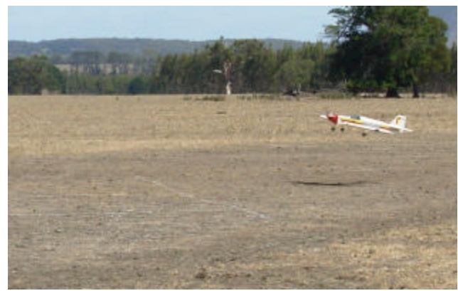
Here we can see Russell's model about to touch down on the 'carrier deck'.

Glenn had rudder servo problem which showed up on take off during the balloon burst. He disconnected the servo and continued on for the remainder of the events.