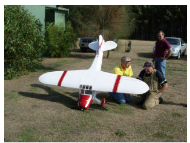
Murri Anstis (Heavy model inspector) is going over Glenn's Cessna 195.

I still have to do work on the exhaust and carburetor to minimize cutting of the cowl. The Cessna has a wingspan of 99 inches and weighs between 23 and 24 pounds. I hope to have it in the air within the next week or two.