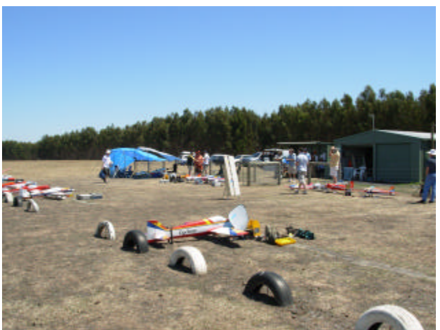
A couple of shots of the pit area. The color schemes on the pattern ships are extremely eye catching.

Henry runs a tight show and was out there on the Friday getting everything ready for an early start on the Saturday. The idea was to get most of the flying done just in case a total fire ban was called for the Sunday.