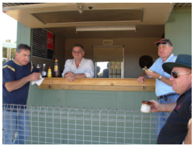
Looks like the canteen staff are taking a breather in between rush hours.

From the comments made by the visitors it appears they all enjoyed their weekend in Ballarat and we look forward to seeing them next year.