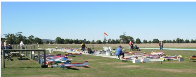
Here's a panoramic shot of the flight line to give an idea of what was happening.

Going by the results further on, the event attracted 23 entrants amongst the four categories ranging from Sportsman to F3A (beginner to guru.) Sometimes they fly two flight lines to get through all the flights but that wasn't the case on this occasion. Maybe there weren't enough judges etc to do so and I notice only four flights per contestant instead of six. No doubt six would have been achieved with two flight lines.