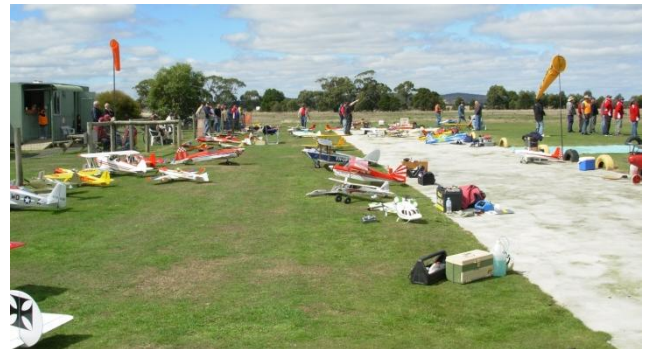
A line up of models on display early in the day.