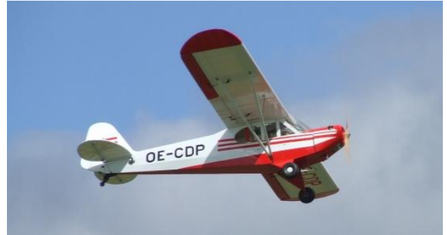
Tony Grieger’s Super Cub looks very realistic in flight.