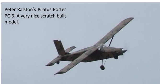
Peter Ralston's Pilatus Porter PC-6. A very nice scratch built model.