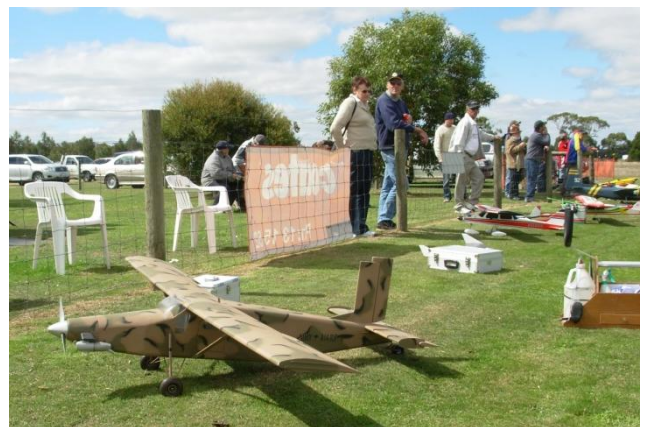
Peter Ralston from the Bellarine Club flew his scratch built Pilatus Porter PC-6. Model has an 80" wing span and is powered by an OS55AX. Given its size it performed well with the smallish engine – must be light.