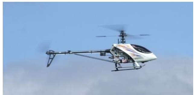
Kevin Curwood (Ballarat Aero Modellers) Align 600 electric powered helicopter, was a standout performer.