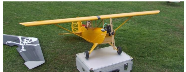
Tim Carter's Pete & Poke which he has built from a Sig kit from memory. Small Saito four stroke up front.