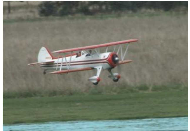
My (Roger Carrigg) Super Stearman powered by an OS200FS on a landing approach. I have to say I really enjoyed my flights on that day!!!