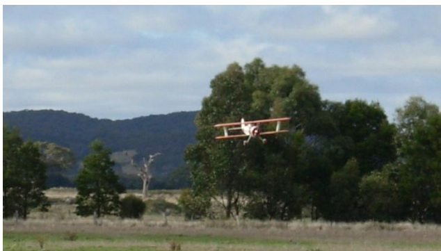
Those trees are a long way in the background although the photo is a bit deceiving.

I (Roger) decided to take my Super Stearman out to practice for the Vicscale Trophy coming up at Shepparton over the Queen's birthday weekend. Unfortunately it takes a fair bit of assembly making it a chore to use for a general Sunday flyer so it needs to be a good day to make