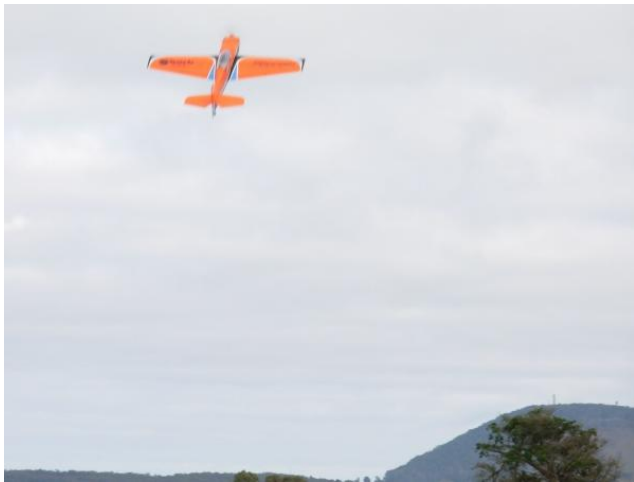
Up, up and away! The Sback had plenty of power to climb out on takeoff.