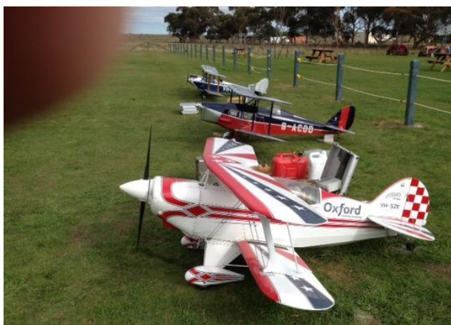
That blur in the upper left corner is Glenn's finger no doubt!!! David's Pitts S2A came 1st and is powered by a 100cc twin petrol motor.