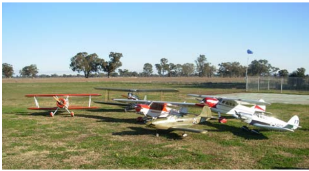
A group photo of our club members models. From left, Roger's Super Stearman, Noel's Gypsy Moth, Graemes's Super Cub, Roger's ol' P39, Glenn's Cessna 195 and Ricks Percival Gull.

We couldn't have wished for better weather conditions. The forecast had been good which may have accounted for the excellent turn out of models. There were 14 entered in Scale and 13 entered in ARF, 27 in all (Brian Whelan had battery problems and could not fly)