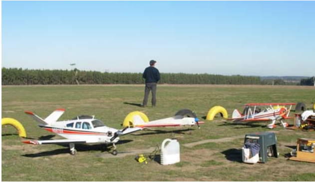
Wayne's Top Flite Beechcraft Bonanza V tail can be seen here in the pits shortly before its test flight. Model is powered by a Saito 150 four stroke.

Back to the pits and the Saito was refueled, retracts pumped up and the motor started and rechecked by holding the nose up. The Saito didn't alter tune at all with the fuel pump fitted which was very reassuring. Final control and range checks were done and everything seemed in order.