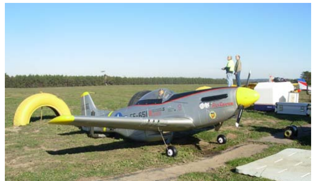
Russell's CM Pro P51 Mustang also with a Saito 150 four stroke engine awaiting its test flight.

Well I must admit I did enjoy flying the Bonanza. However it's a model that will always require plenty of airspeed at lift off with rotation being a little more sudden than expected. (My P39 is a bit like that and I've found that 1/2 flap on take off allows it to unstick without having to raise the nose too much with up elevator.) While downloading the Instruction manual during the week I found a flight test on the Top Flite web site and that model did exactly the same thing only much more severely. I was half expecting it after reading the flight report and was ready for it. The Bonanza required more down trim than expected – the elevators were down a fair bit on inspection when back in the pits. It's a very nice model Wayne.