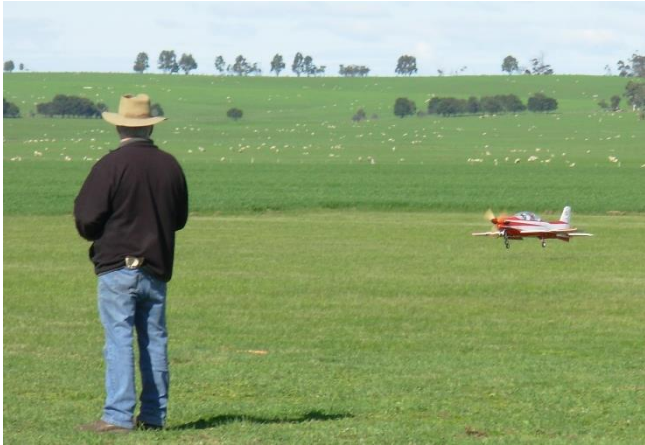
The PC21 moments from its first touchdown. Fortunately it was a smooth one as Peter was unsure about the strength of the main landing gear.