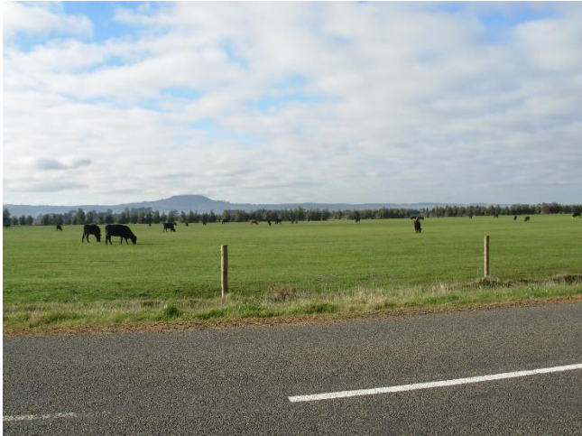
Looking east from Bowes Road, Mt Buninyong is in the background like at Yendon but in the opposite direction. Both fields were on opposite sides of Mt Buninyong and much the same distance. (Approx. 10km.) Actually if you drew a line between the two fields, Mt Buninyong is 2.5km south and the fields were 19.5km apart. Ah, the marvels of Google Earth!!!