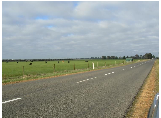
The former Bowes Road field looks fairly large in the photos but in reality it's not big by today's standards. The models have grown in size over the last 15 or so years.