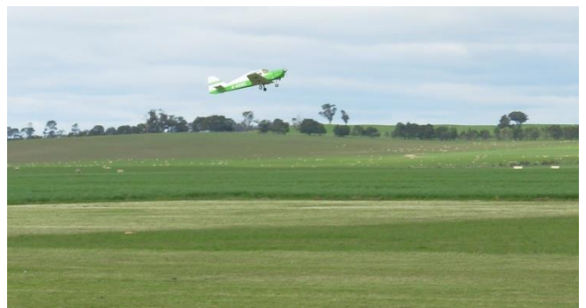
The Beagle lifts into the air once again. Glenn brought it in for a nice landing after a number of circuits.