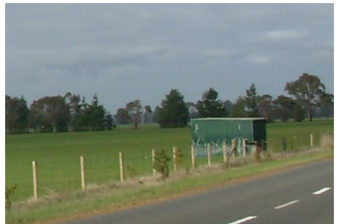
The long-time members will remember the little green shed which was all we had for cover. The container was situated on the far side of the shed to house the mower etc.