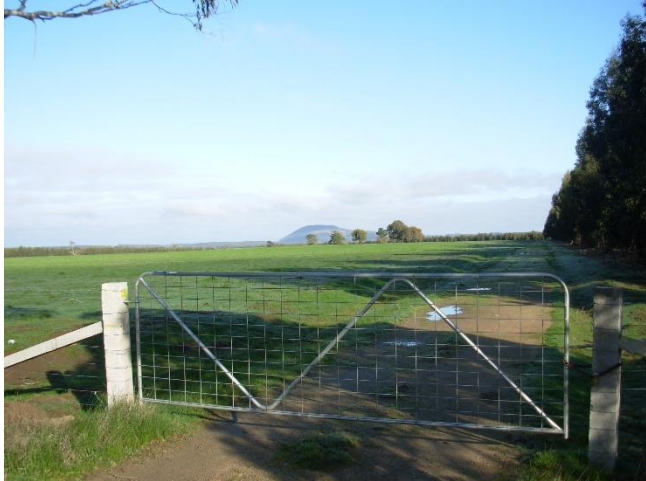
Paddock & track in haven't changed and the trees we planted around the compound are still there.

Pulling up to the gate for the first time in almost two years was strange but at the same time very familiar. The paddock and the track in all look the same – virtually untouched. The only noticeable change is the new fence along Spreadeagle Road. The recent newsletter published by WestWind Energy however indicates that the wind farm is proceeding so developments there are imminent.