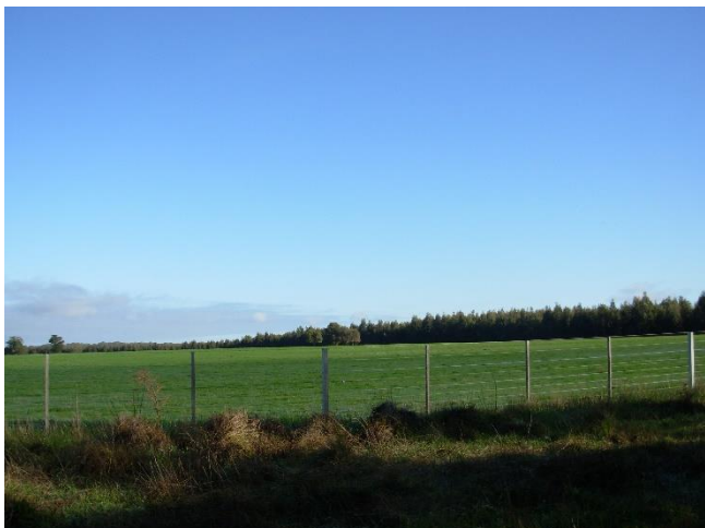
The new owner has erected a new fence along Spreadeagle Road and I believe also throughout the property.