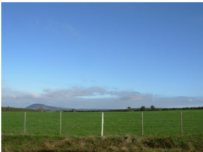
Another view of the old field looking west from Spreadeagle Road with Mt Buninyong in the background.

After getting the shots at Spreadeagle Road I headed home via Bowes Road Ross Creek to get a few snaps of the field that we vacated in 2000 to move to Yendon in the belief that it would be built on in the not too distant future. Those who were members back in the Ross Creek days would remember the green shed we huddled in for a bit of shelter. Boil the kettle on the wood heater for a cup of coffee. It was rather primitive back then, but we still had a lot of fun, just not as comfortable.