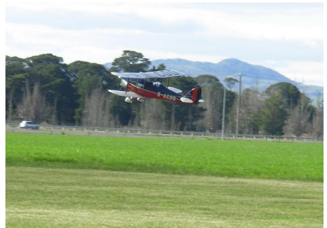
And climb out after touch & go.

See the article further on in the newsletter about the scale world championships.