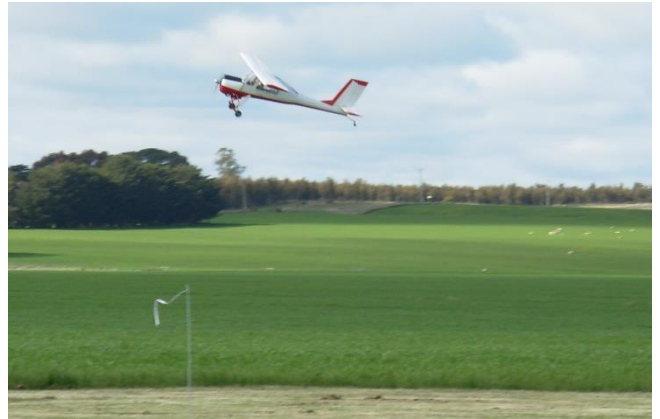
We haven't seen the Wilga in the air for quite a long time. I don't reckon I've seen it since we went down to Warrnambool in early March this year.