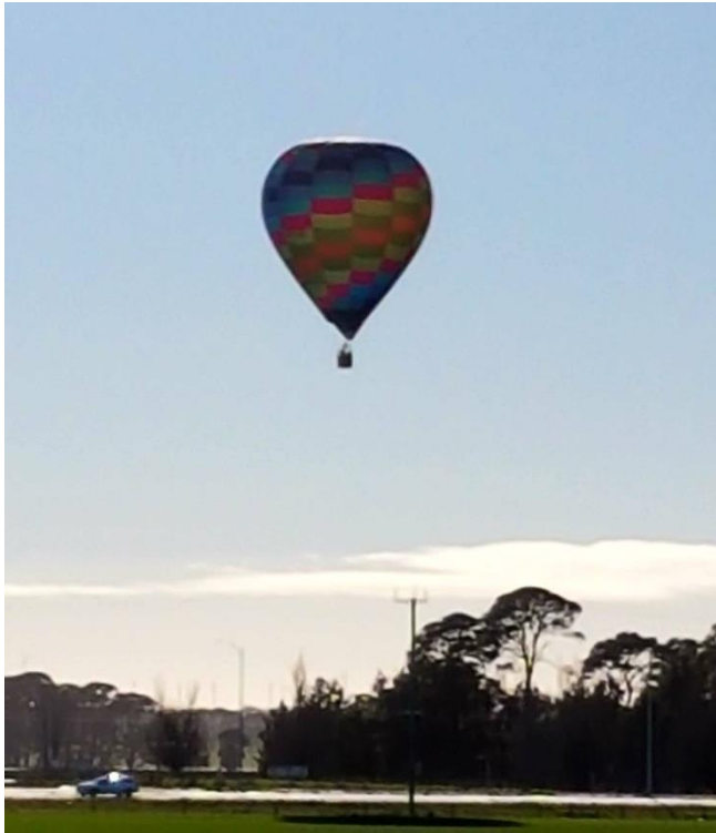
Hot air balloon heading east over the northern end of our Trawalla field on Sunday morning 14 th August, quite low and not far off the freeway. We are used to plenty of hot air, but not in balloons!!!