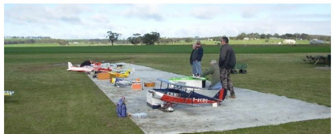
The pits on Sunday 14 th August.