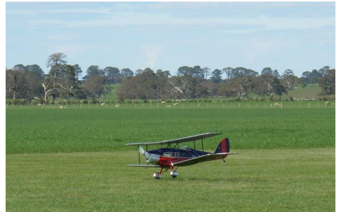
Noel practicing touch & goes on the north/south runway.