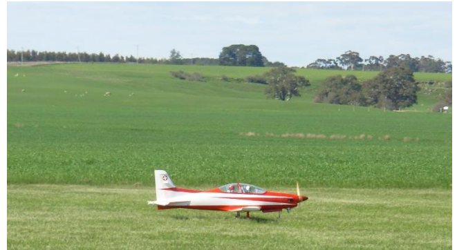
The PC21 taxiing down to the south end of the strip for take-off.

It certainly had plenty of power and tracked straight down the runway so that was obviously all in its favour.