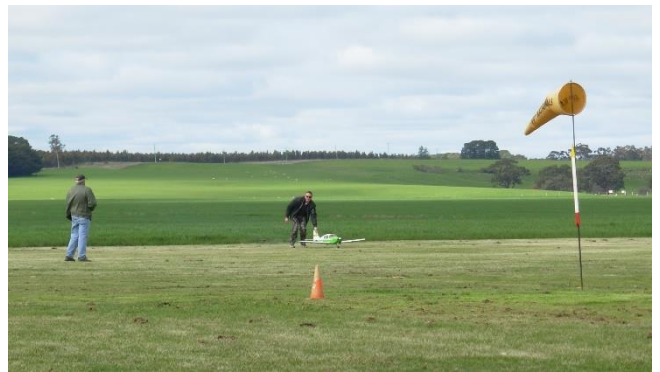
Noel pointing the Beagle's nose into wind for take-off.

Glenn also had his old Beagle Pup100 in the air on Sunday 14 th August. The westerly breeze on the day necessitated use of the east/west runway most of the day. Noel was assisting Glenn.