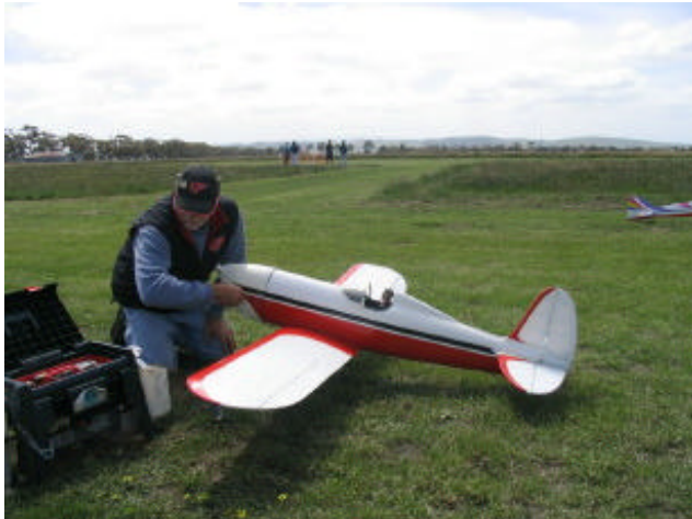
Wayne had a good day out with the OS 120 FS powered Ryan. It looked like glo plug problems at first but turned out to be a flat battery in the flight box – not enough glo.

Unfortunately there wasn't a big rollup but everyone enjoyed the day out and the hospitality of the Northern Flying Group.