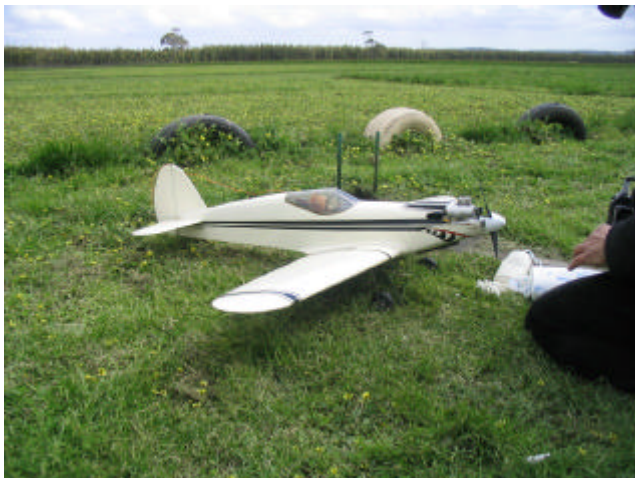
Another one of Len's many models – Powered by a K & B 40, this one is very fast and would have made a good pylon racer in its day.

out of the woodwork lately. Although the model is not new it is the first time it has been out to our new field. It isn't the type of model that you would expect Len to be flying (fast and furious) It is powered by a K&B 40 that I think came out of the Ark! Do you like the pilot?