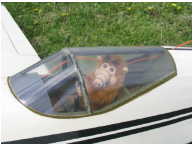
The pilot (Alf) underscores the age of the model.