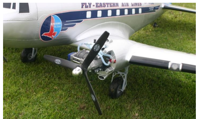
The 11x7 props look too big for the scale of the model. Wayne now has 10" props to try out.

On Sunday 16 th September Wayne brought the DC3 out to the field for engine test runs. Before we get to that I must say that Wayne has done an excellent job building the kit. The almost finished model includes a fair amount of scale detail and a great paint job. It is powered by two Magnum 52 FS swinging 3 bladed props (which at the moment are too big for the 52's and the scale of the model). The model also has Robart retracts for scale realism.