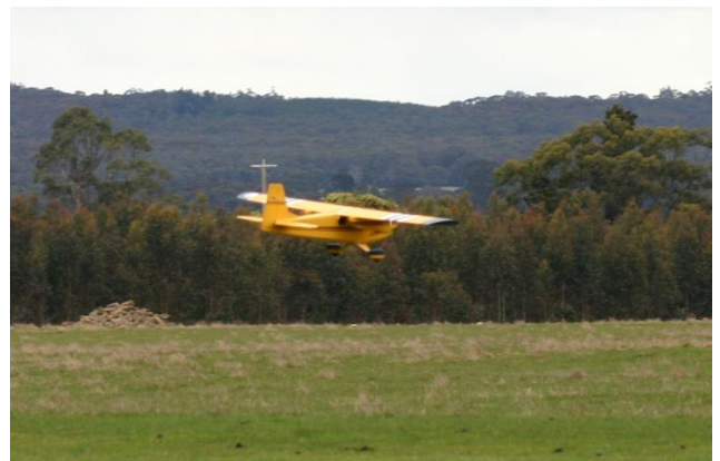
Len's vintage (Circa 1985 from memory) OS15 powered twin doing touch & go's and low circuits in the outfield. (The t&g's were on the strip not the outfield!!!) It's always a pleasure to watch Len fly, particularly the twins.