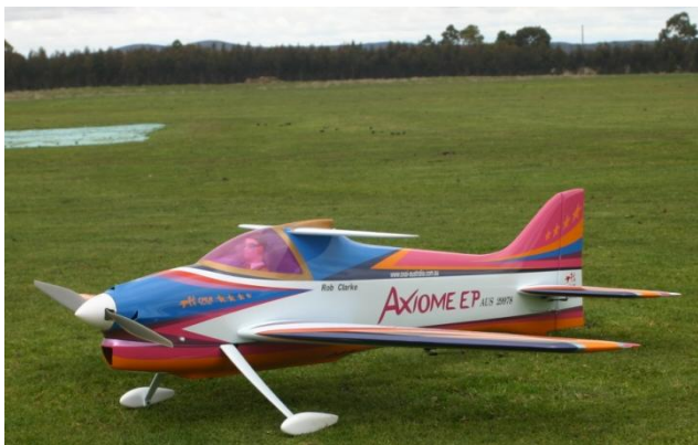
I think Mat just wanted a biplane like Noel!!! The Axiome EP has awesome performance with the powerful electric motor and surprisingly long flight duration.