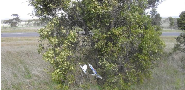
The tiny model came to rest in a tree beside the Yendon-Edgeton road a kilometre from the field. The marked up Google Earth map below shows the suspected flight path although I don't think it traversed that far eastward.

(the way the crow flies) from the place of launch. Myles has provided a marked up Google Earth image of the likely path the model took although I doubt it went that far eastward. Had it not come down beside the road the chances of finding it were very slim – sometimes you have to be lucky.