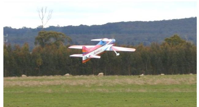
The Axiome taking off so Mat can practice the F3A pattern manoeuvres. There must be a comp coming up soon somewhere!!!