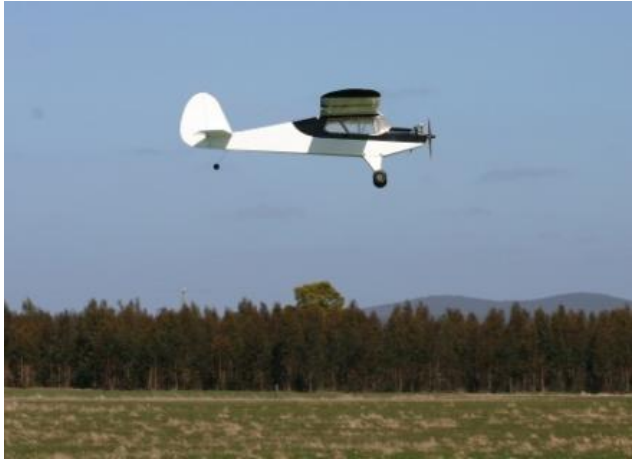
A majestic low pass across the field for the camera!!! The OS48FS powers the Outsider admirably as we all saw on the day. Shows you don't really need big engines if you build light.

This one has a wing span of 84", a dry weight of 2.6kg, is powered by an OS 48 FS modified to suit a 14x6 propeller. It was test flown on Saturday 1 st September. (That was no doubt a perfect flying day!!!). These photos were taken on Sunday 9 th September, a day that also blessed us with excellent conditions.