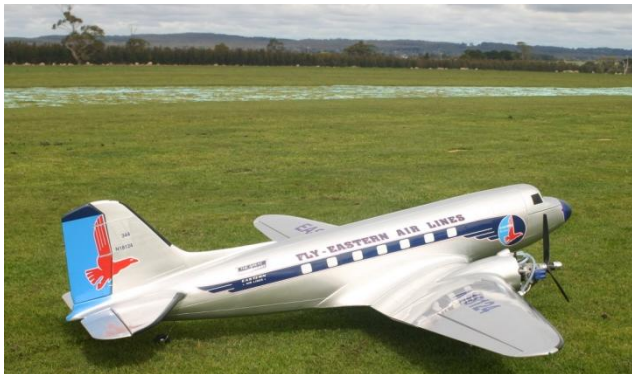
The DC3 looks quite smart in the silver livery. Once the engine nacelle cowls are fitted it will really look the part.

is not the engines but the fuel setup caused by the nature of the model construction. Unfortunately there is very little room in the nacelles with the wheels retracting inside.