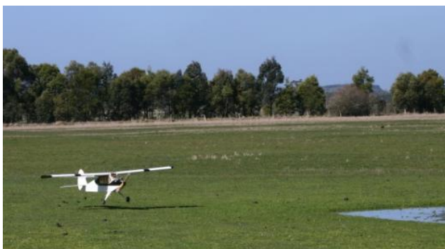
Len bringing the Outsider in for one of many touch & goes. You can just see the water lying on the end of the runway matting from all the rain we've had recently.

Wayne's been building a Top Flite DC3 this year and it is now getting near the pointy end where a test flight is not all that far off.