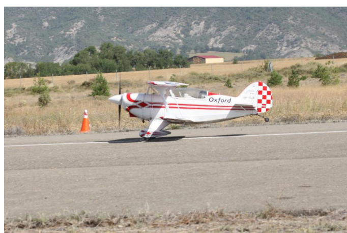
Noel's DH Fox Moth and David's Pitts S2A in action. 20 th and 5 th respectively in F4C.