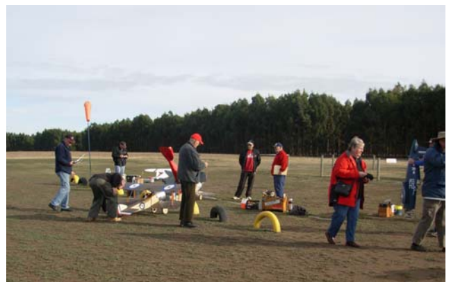
A random photo showing some of the people who attended.