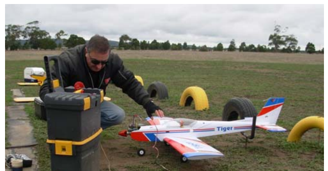
Graemes new Tiger 40 sport model moments before its test flights. 99 bucks – last of the big spenders!!!

The finish on some ARF's these days is getting extremely good and this model is no exception. Covering was tight all over and the edges nicely stuck down.