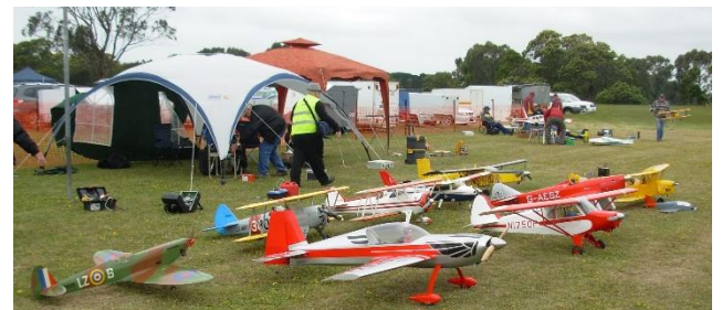
A line up of models belonging to BRMFC members.

Now that the weather was much more conducive to flying there were models in the air all the time. Most of our members managed several flights for the day. It was a southerly moderate breeze for most of the day so we were flying off the western side north/south runway taking off towards the road.