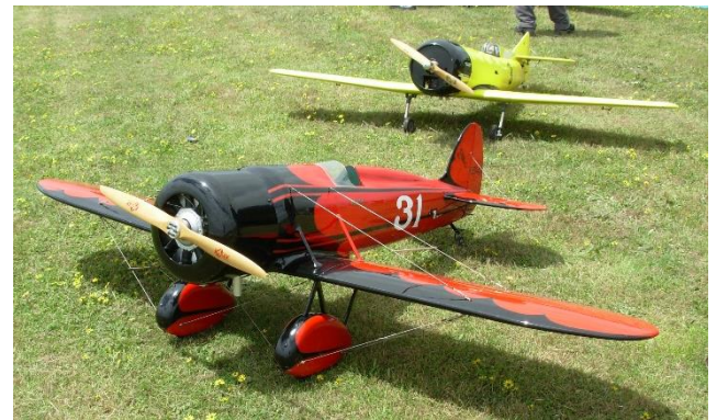
Model of 1934 Travel Air Mystery Ship, powered by 100cc petrol engine. Won President's Choice and also from Adelaide.

back in 2010 and is in my Shoestring replacing the Magnum 80FS. The ASP91FS has clocked up 109 flights and never missed a beat.