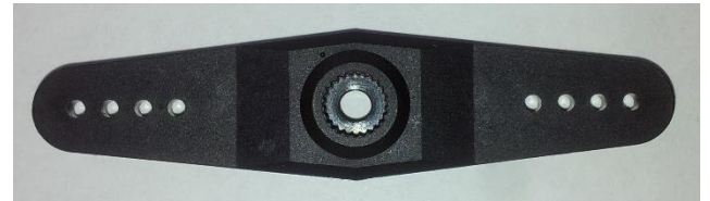
This is the arm supplied with the Hitec 645MG and is for all intents and purposes dimensionally identical to the JR arm above. Once again no marking that identifies it as Hitec to the user. It has 24 teeth in the spline.

The rule is to take extra precautions when setting up Hitec servos if you have an assortment of other brand servo arms on hand. Store your spare servo arms in separate clearly marked containers for each make to eliminate the chance of a mix up and a possible disaster.