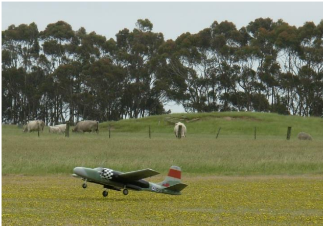
This might be the last photo ever taken of this model (B25 Mitchell) in one piece. I just managed to snap it as it lifted off before climbing fairly steeply, rolling over and going in vertically from about 40 feet. This happened just before the presentations and totally unexpected, I thought to myself could it be reversed ailerons and apparently it was the wrong model selected in the transmitter, so effectively reversed ailerons.

Once again we must thank the Hamilton club for hosting this annual event – it gives modellers a chance to catch up with old friends and you get an opportunity to see a variety of different models. You may also get to sell that unwanted treasure and/or pick up a bargain.