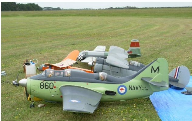
This is a model you don't see very often – well it would be the first example of a Fairy Gannet that I've ever seen. Model from Adelaide had not flown yet and did not fly although an attempt was made. It's powered by a Zenoah 62cc which doesn't seem adequate for a model that size and I think the attempt bore that out. Won Pilots choice.

The number of pilots attending the meet appeared much the same as last year, I don't know what the official entry numbers were. No doubt the forecast wet weather kept a few away. However you certainly see many familiar faces when you get around these modelling events such as Hamilton.