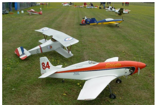
I remember the Stiletto flying – probably the fastest model at the meet.