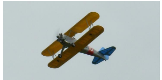
Wayne's PT17 Stearman on an overhead pass during one of many flights on the Sunday. Won Best Biplane.