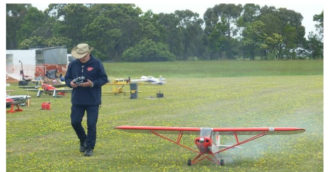
A1 (aka Graeme Allen) is taxiing his new Piper Cub (looks like the clipped wing type) out for one of many flights on Sunday. Model is powered by an OS200FS.

Now that the weather was much more conducive to flying there were models in the air all the time. Most of our members managed several flights for the day. It was a southerly moderate breeze for most of the day so we were flying off the western side north/south runway taking off towards the road.