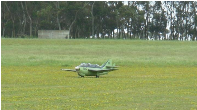
Unfortunately not much happened when the throttle was opened.