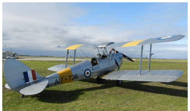
Gary is out front behind the prop pulling it through to start the engine.