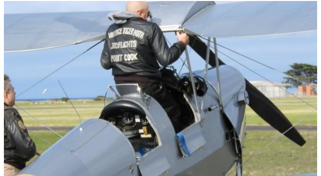
Disembarking the flying steed.