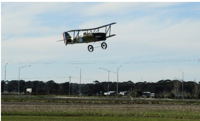
And a low pass over the field for the camera.