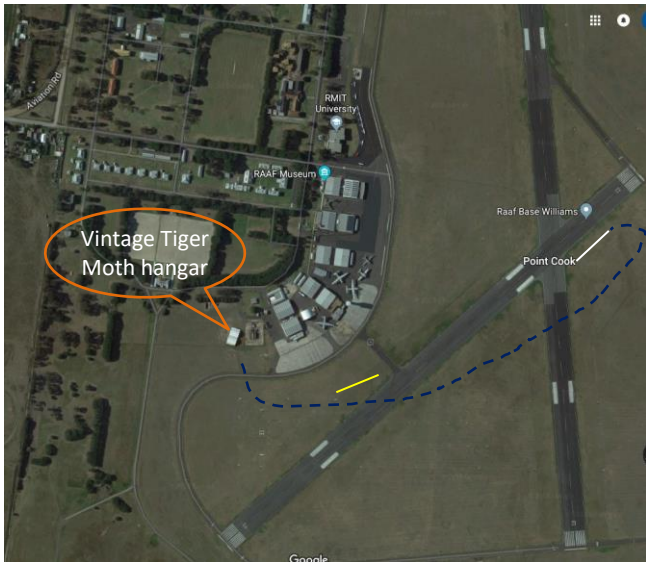
The blue dashed line shows the approximate taxi path out, the white solid line the take-off run and the yellow line the landing path. (Worked that out from the video clips.)