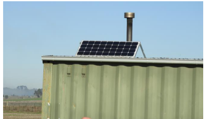
Alan Crisp re fitted the solar panel on Saturday 9 th June to improve the charging rate particularly in winter.

The charging station hasn’t been functioning as well as expected so Alan Crisp re mounted the solar panel on the roof of the container to achieve better charging through winter when the sun is low in the sky. It should now be angled at a suitable compromise between summer & winter. Previously it was mounted from the side of the container however the original panel which failed was on the roof like it now is.