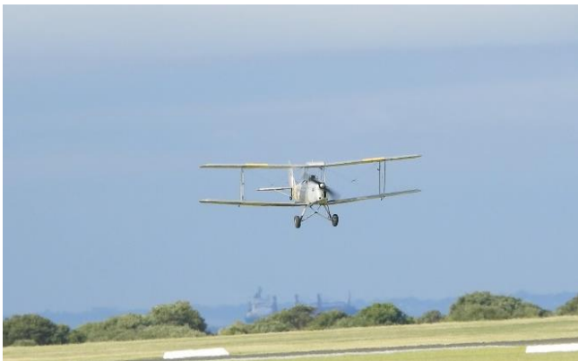
The landing approach from the north east.