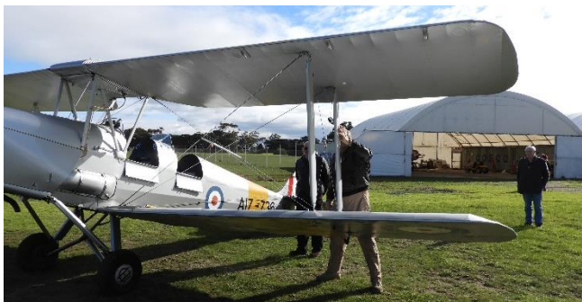
Gary rigging up the camera on the inter plane strut. That will be interesting to see.