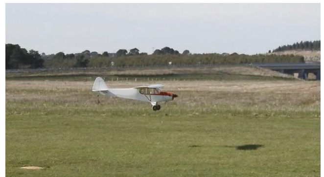
The Cub on landing approach.