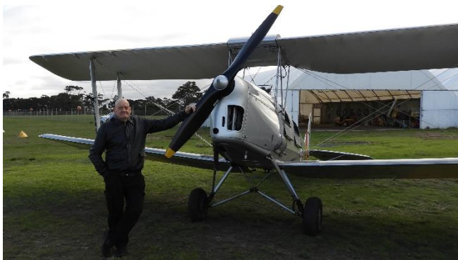
It's only four times bigger than yours Murri!!!