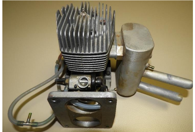
As far as we know the engine has only been flown the once, so in perfect condition. The mount & muffler alone would probably be over $100 to buy.

If anyone is interested or would like more info please let me know ASAP via the editor contact details at the top of page 1.