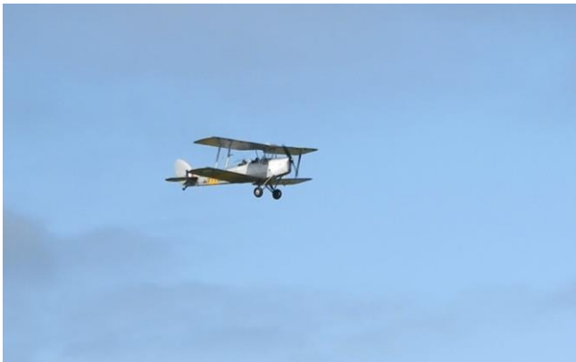
Climbing out past where Glenn and I were standing. We weren't permitted to go out past the hangar otherwise the boys in the control tower get upset.