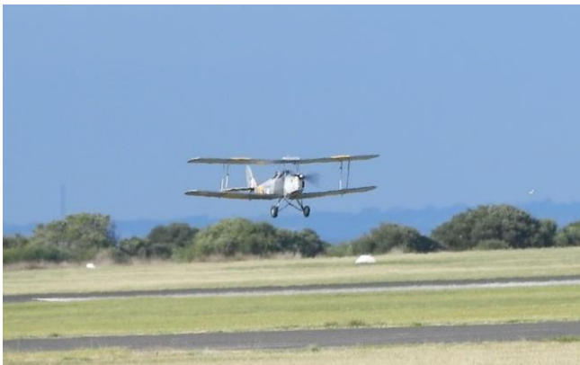
It was airborne in 50-70m of the grass to the side of the sealed runway.