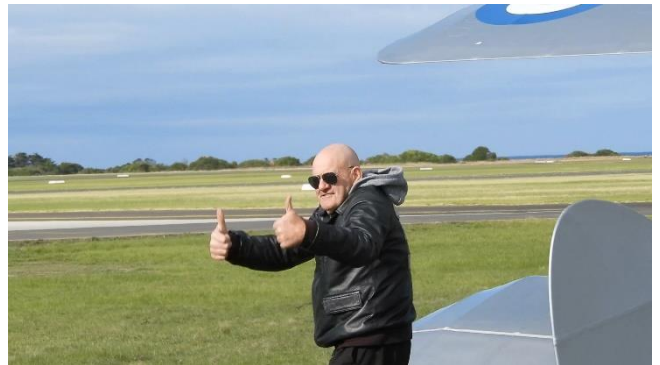
Gee I did it!!!

Murri obviously thoroughly enjoyed the experience and may one day try the aerobatic flight.