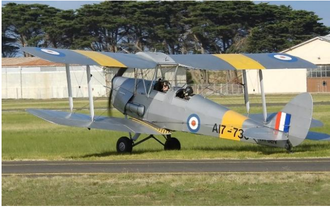
Taxiing out for the take-off run.