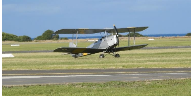
Taxiing back to the parking bay in front of the hangar.