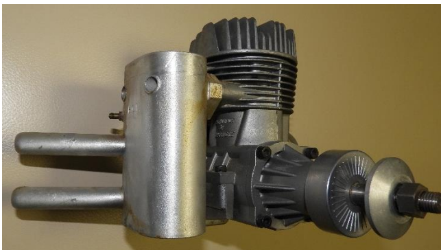
Super Tigre G4500 engine with BCM Pitts style muffler and ST cast aluminium engine mount. Circa early 2000's. Instruction sheet and Super Tigre booklet included. Ex the F4U Corsair (sold).