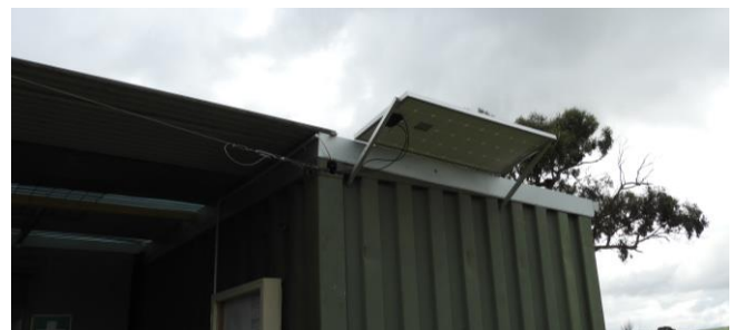
Where the panel was previously mounted. In winter the sun is low in the northern sky at around a 20 degree angle (from the direction of the tree).

It looks like the two lead acid storage batteries which were second hand need replacing probably with a large capacity single unit. They are quite old with the larger truck battery dated sometime in 2000. Tests at the weekend showed the voltage across the battery terminals is continually dropping while charging even a smallish LiPo cell pack. If one battery is losing its charge the better battery will simply discharge into it. The cold nights would not be helping the batteries either.