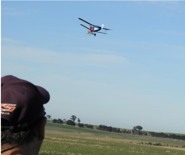
The little Fokker (it's only about 400mm wingspan) performed well in the fine sunny conditions. Murri tells us it has since had a haemorrhage inside – one of the tiny linear servos attached to the main board has stopped working and it is very difficult to repair/replace.

The charging station is fully operational again after the faulty solar panel was replaced recently. It seems to be getting a fair amount of use with the surge (no pun intended) in electric models.