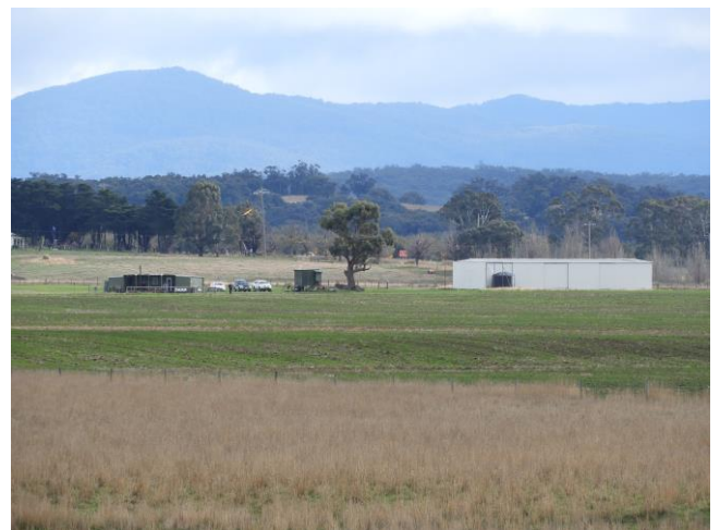
This shot was taken from the side of the hill along Trawalla Road looking back at our field. Camera has 60x zoom which brought it up close.

I went with Murri in his Ute down the freeway to Trawalla Road where we parked and carefully got over the electric fence (not wanting to damage anything – I don't mean the fence!!!) into the paddock walking west back towards the field scouring the landscape for the 2+m glider.