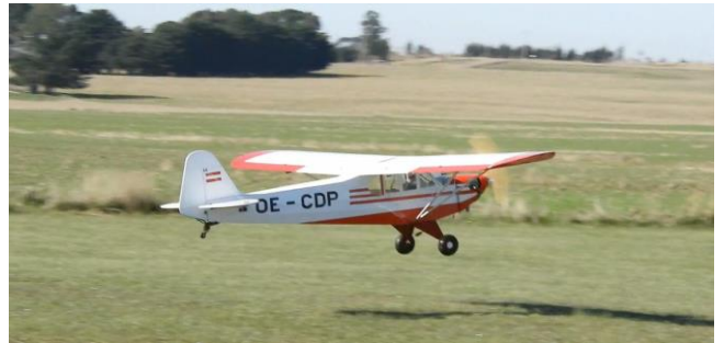
Sunday June 4 th . Max's 1/3 scale Cub on take-off.