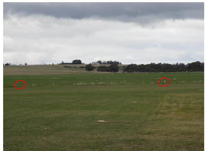
The witches hats should make it easier to line up when landing on the WNW strip.

The cupboard doors above the bench top were taken down on Sunday 25 th June so Graeme can take 7 or 8mm off the top to provide clearance with the ceiling. One of them has been scraping on the new ceiling lining for a while now.