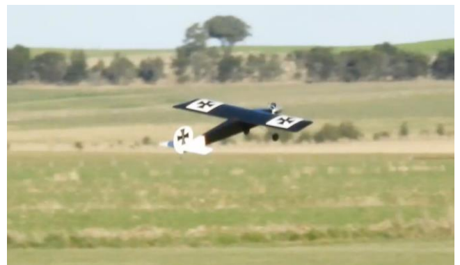
A frame pulled out of the Full HD video I took of the take-off. With my new Nikon Coolpix B700 camera I find taking video and extracting a frame an effective means of getting photos for the newsletter.