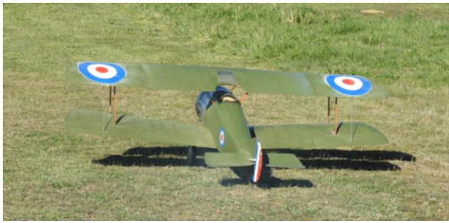
The Camel taxiing out to the strip. You could tell straight away the 91FS had made a huge difference to its response to throttle.

The following snaps are frames taken from the video I took of the whole flight which unfortunately ended with a stall and spiral in from about 40 feet. It became apparent as soon as it left the ground that the CofG was too far back making it extremely difficult to control. Max almost got it around a full circuit trying to bring it in but the stalling got too difficult to control and worse with the power reduced trying to land.