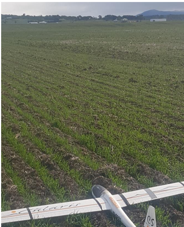
Looking back to the field from where the Cularis landed. The big shed is visible and you can just make out our facilities to the left which is almost 1km distant.