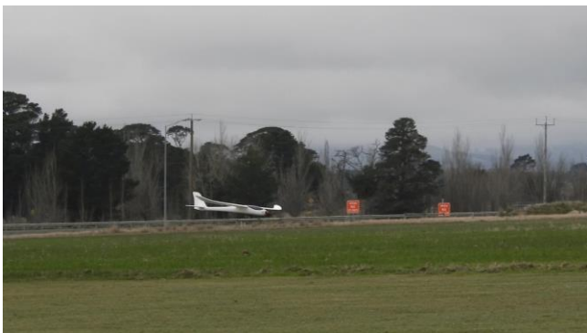
After an 8 minute flight it was time to land. (The time difference on the video clips works out at 8 minutes).