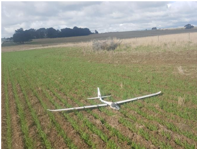
This is where it came to rest. The mound behind it is remains of tangled fencing wire with grass growing through it. It is visible in the Google Earth satellite photos enabling a fairly accurate measurement to be taken.

drove back to the field. Murri then set off on foot to retrieve it now that we knew where it was located.