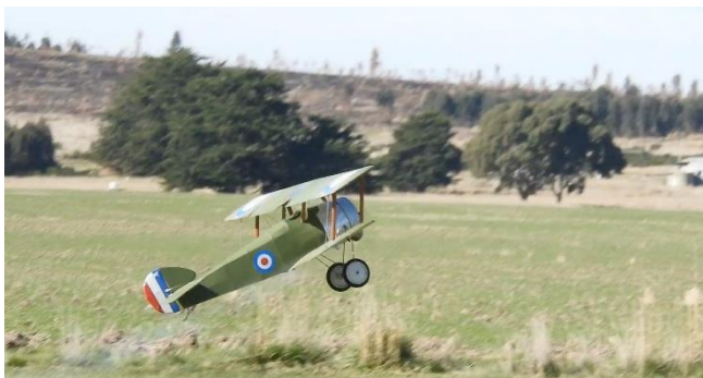
Lift off didn't look too bad – a little steep but wings level and the 91FS had plenty of power to pull it skyward.