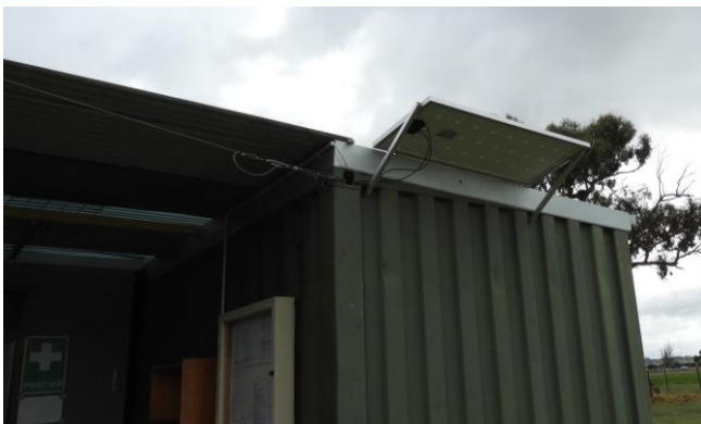
The new solar panel has been mounted on the side of the container roof instead of up on top. The photo shows how overcast it was while still charging the battery at 14.0V.

On Sunday 25 th June the forecast wasn't all that good but it was quite pleasant at the field albeit cold of course. The wind was light/moderate from the west which isn't our preferred direction at Trawalla like it was at Yendon.