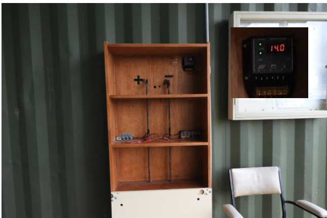
On Sunday 25 th June it was overcast but still showing 14.0V on the digital display as shown by the inset photo.

Many thanks to Paul Ruddle for setting up the system.