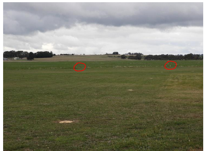
Witches hats (circled in red) have been positioned about a metre inside the crop line at the projected point where the sides of the WNW strip intersect.

For a change rather than battling crosswind on the main strip I thought I'd try the old Shoestring on the WNW strip that heads toward the big shed. No problems on take-off, however on landing it quickly becomes apparent it is difficult to line up because the strip doesn't continue beyond the main runway. Later in the day Murri and I put a couple of witches hats about a metre inside the crop line to indicate the projected sides of the WNW strip. We need to do the same with the E/W strip on the south side. Of course they'll need to be shifted from time to time as the crop grows or the farmer commences harvesting.