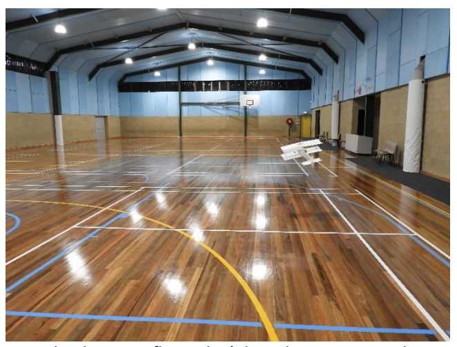
Note the shiny new floor. Alan's bipe doing some aerobatics.