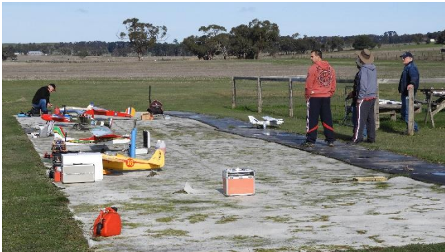
The pit area matting which we want to replace is covered in moss/algae. That could be eradicated or at least mitigated by spraying with a concrete cleaner or even a bleach like White King. Once the matting is replaced it will still do the same thing over winter – it happened at Yendon as well.