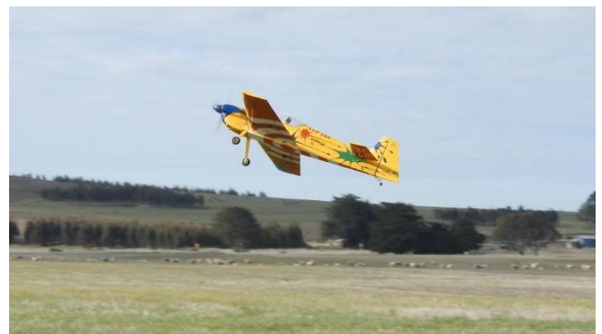
As you would expect the DLE111 had the CAP off the ground in no time. All looked good and Alan was putting the CAP through its paces to pass the requirements of the heavy model inspection which Murri was attending to.

The DLE started quite easily but was noticeably sluggish picking up from idle. Richening the high range needle a little cured that. The engine ticked over very smoothly and doesn't seem to be excessively noisy which is a bonus. The prop must be a good match for the engine/airframe not allowing it to over rev and create propeller tip noise.