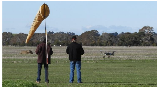
Alan doing a low slow fly-past with his electric SE5A. Photo taken on Sunday 1 st July.

Whilst we've had some lousy weather most weekends we manage to fly. Of course when the forecast is good and it turns out nice and sunny we get a reasonable roll up of members. A few pics are included to