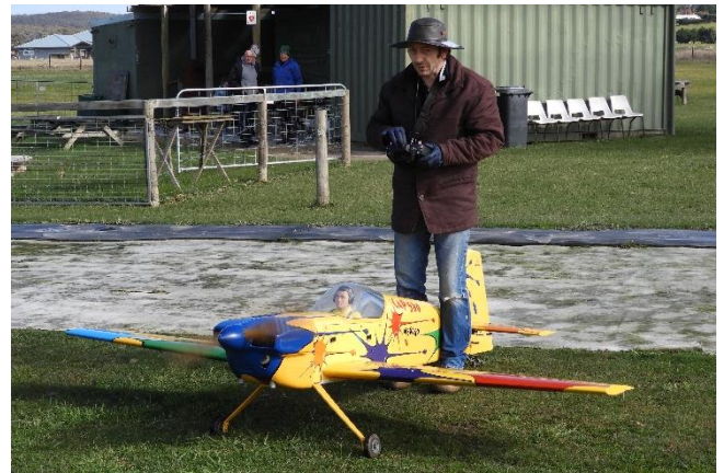
A final rev up before taxiing out to the strip.

was subject to engine loads and attended to a few other cosmetic details.