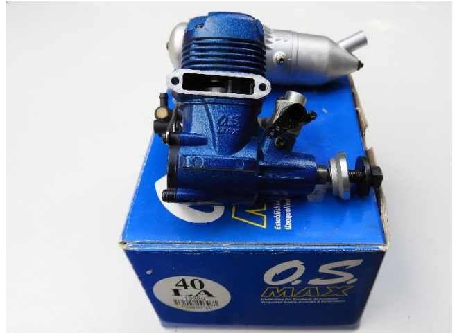
New in box – never run.