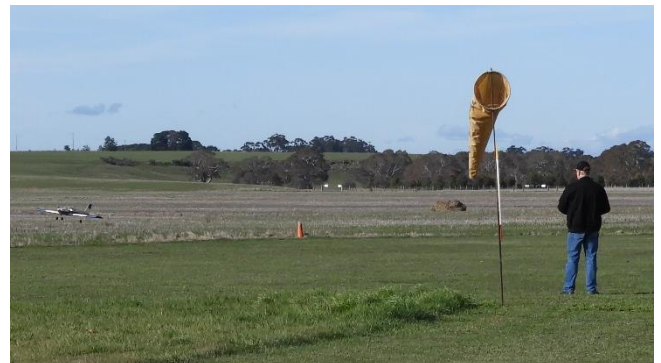
Nigel is also doing low slow passes over the strip with his 46 powered low wing sports model.