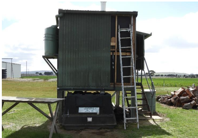
Photo taken 27 th August 2017 while fixing the burst pipe. Looks like it has burst again.

It looks like we'll have to run the pipe underneath the floor and possibly use poly pipe as well. The minimum temperatures at Trawalla must be colder than at Yendon; in 14 years at Yendon we never experienced the pipes freezing and bursting. The orientation is pretty much the same as it was at Yendon.