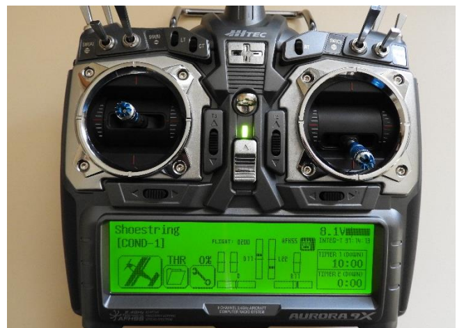
With the new Eneloop Pro 2500mAh battery pack, Hitec Aurora 9x transmitter is holding plenty of battery capacity. It was never like that even from day one.

I used the transmitter last Sunday 22 nd July and after a couple of flights it was still showing over 8.0V – a solid bar where it shows battery capacity, the old one would've been down near 50%.