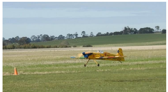
After a few circuits and aerobatics Alan brought the CAP in for a 3 point landing.