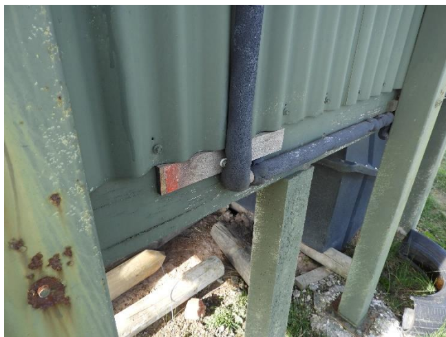
The elbow was repaired on 1 st July and a clamp fitted to prevent the compression fitting coming off the pipe.