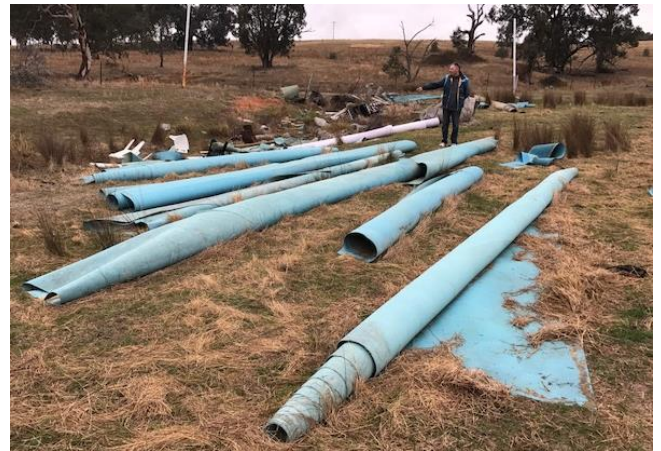
Disused runway matting at the Twin Cities club Albury.

Initially we asked if they had any contacts with the paper mill a few km's to the north of their field the mill being the original supplier of the matting which I believe is used in the drying process.