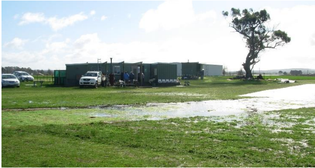
The wet area is where the pits were before we moved the matting. Would have been good for float planes.