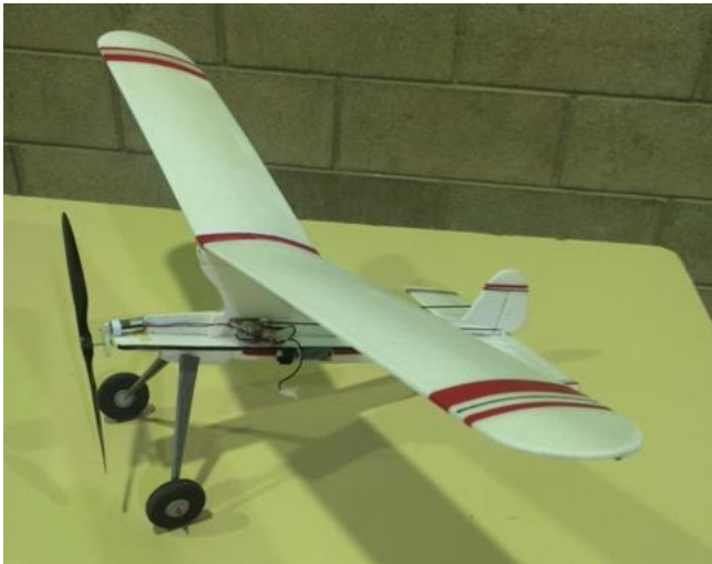
Kevin Howard's ¼ Pint weighs 28g.