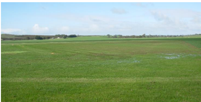
The East/West runway (looking east) is significantly shorter than the N/S and subject to a bit of water collecting at the western end but still quite usable. Probably only get used when there is a strong westerly blowing. That being the case you don't need a very long strip.