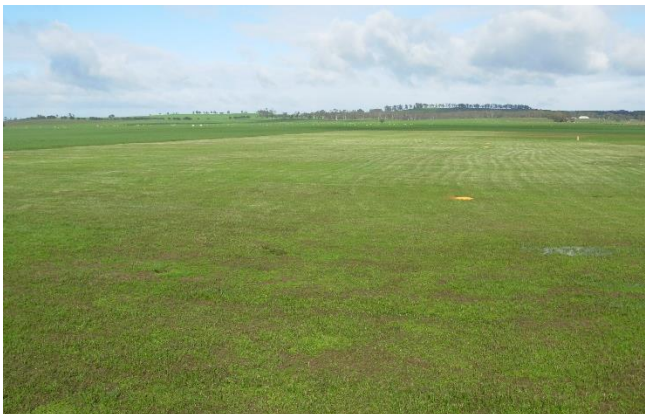
The North/South runway (looking south) is in pretty good shape and fortunately doesn't get water logged even with the considerable amount of rain we've had lately.