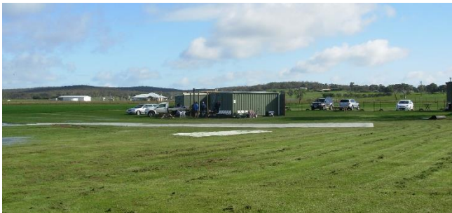
The pits are now on higher ground which is a fortunate side effect of the shift. We may shift the large model start up area to the south end where it would be more central to both runways.