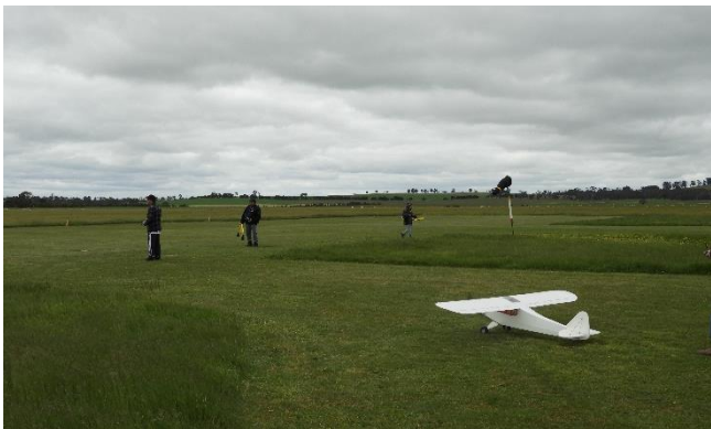
Photo taken on 17 th November 2019 during BRMFC/BAMI interclub day.

The field sure has dried out in the last couple of months. The photo below was taken on 17 th November for comparison.