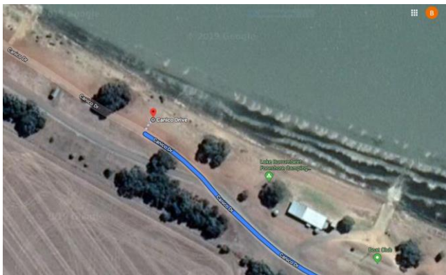
This is the location we used last time so might as well assemble here again after which we can decide the most appropriate spot to use.