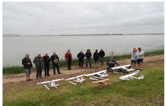
Photo from the inaugural event held on 5 th January 2019.

The club is planning another float day at Lake Burrumbeet on Saturday morning 1 st February. The location is on the south bank of the lake near the boat club.