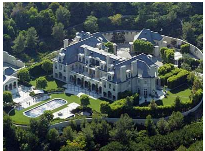
As seen by your Council Rate Assessor