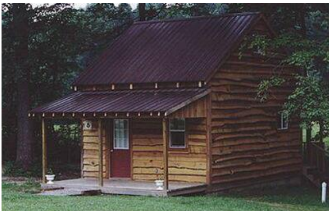
As seen by your buyer.