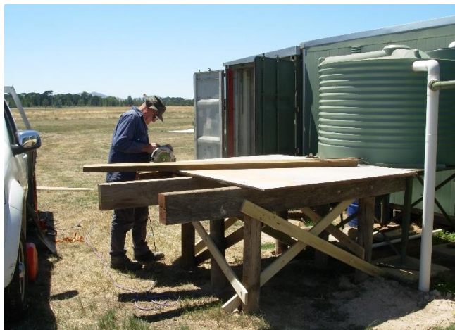
Murri is trimming the tank stand base which is a Laminex flooring product that is really hard to cut – wears out blades in no time.