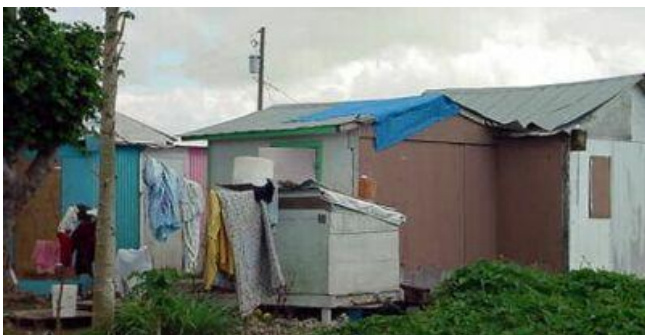
As seen by your lender