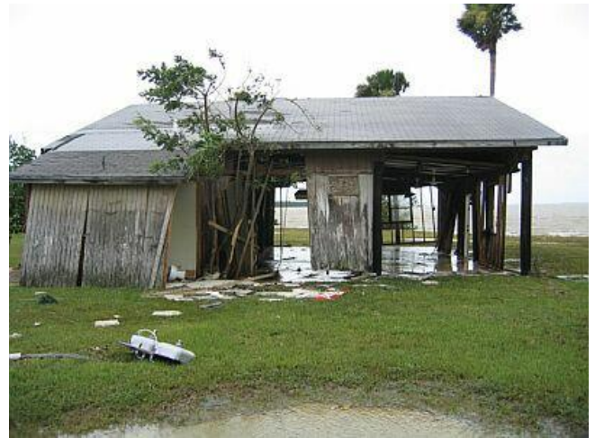
As seen by the bank's valuer