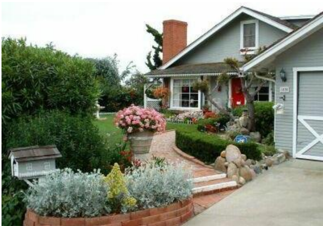
Your House As seen by yourself.