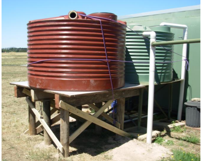
The new tank was empty at this stage so it was tied to the stand in case of strong wind.

Murri built a tank stand for the other water tank we had in the container over the past couple of weeks. It was all hooked up before for the VPA event weekend. Both tank levels equalize by the connection of the outlet pipes which are not shown in the photos but have since been fitted. With both tanks we have a total of 4500L which should be plenty.