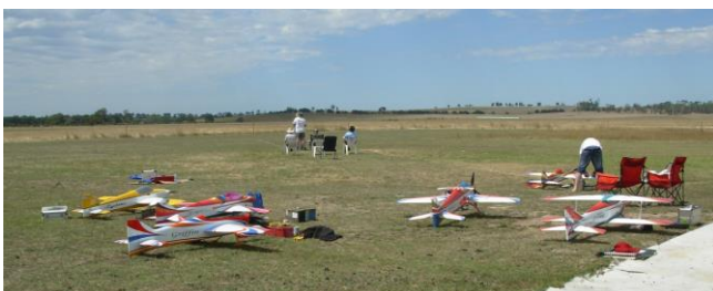
A few shots of the pit area and flight line.

It was all over around 3:30PM after which Henry tallied up the scores on the computer, printed out the results then made the presentations.