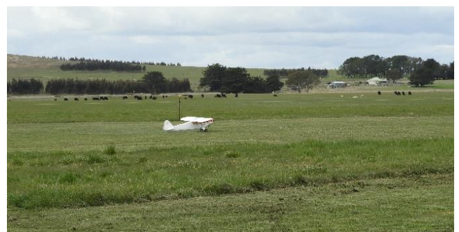
Peter Evans taking off to do a bit of cattle mustering!!! Sunday 2 nd September.