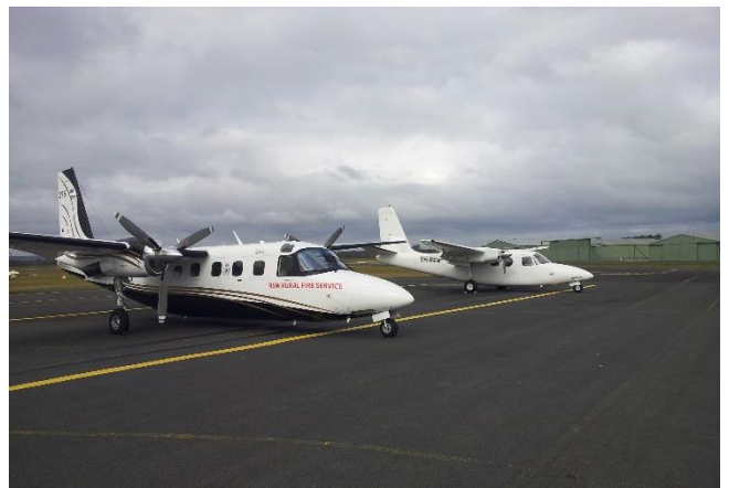
This shot was taken on the tarmac at Ballarat Airport after the short flight from Stawell.