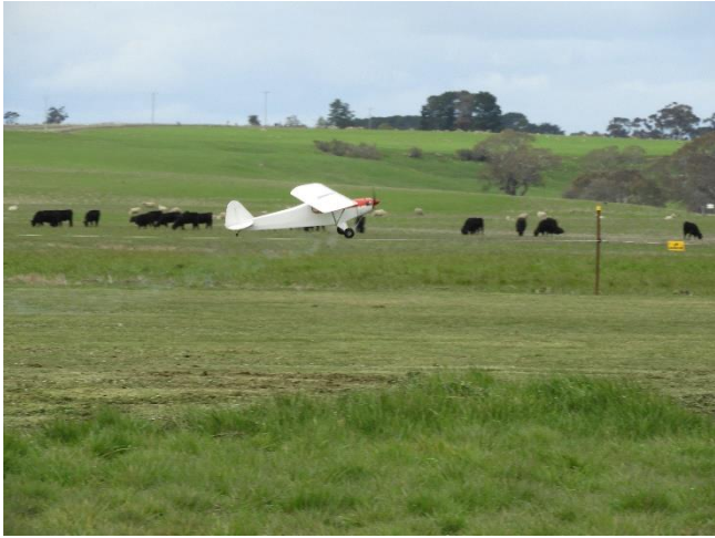
Peter's OS91FS powered Piper Cub on take-off.