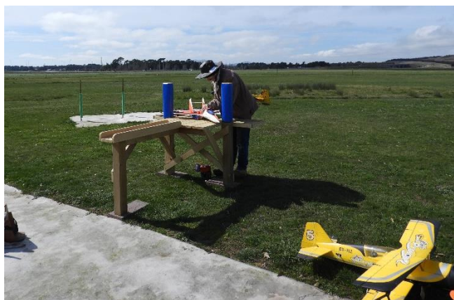
The new start up benches are getting plenty of use.