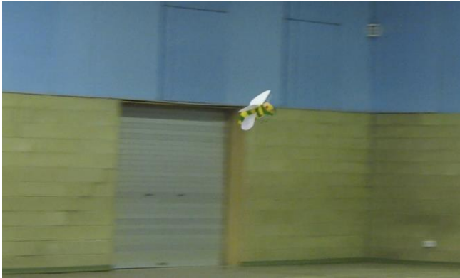
And off it goes in a circle that took it to the full width of the hall. Obviously perfectly trimmed to suit the hall.