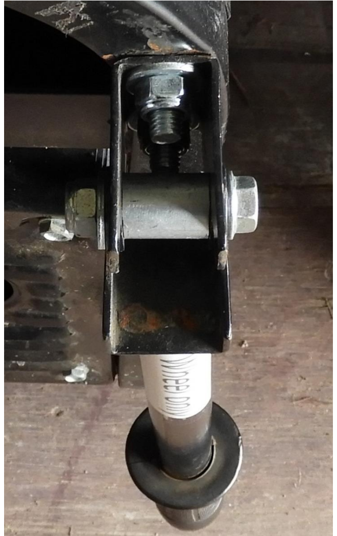
Fitted spacers to the generator handle brackets to prevent the "fingers" from collapsing inward. A job that has needed doing ever since it was purchased. For the money it's a great generator – just needed a bit of finishing off.