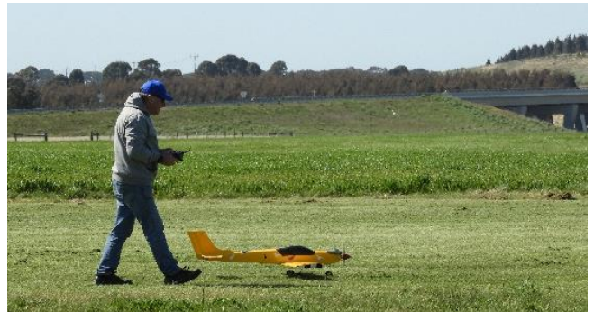
Taxiing out for take-off. I'm not sure if this was the maiden flight.