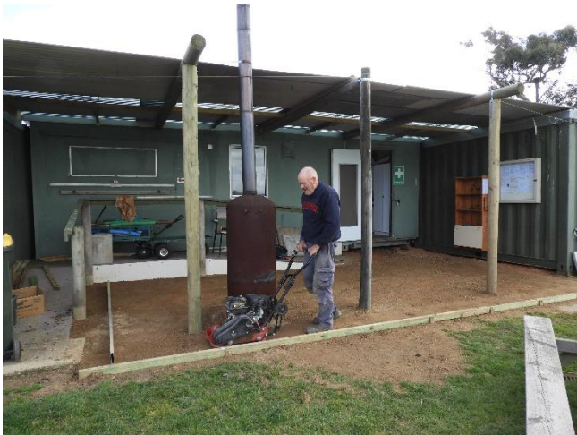
Murri on the whacker to compact the surface in readiness for the pavers. A bit more course fill is required along with fine blue stone dust to bed the pavers on.