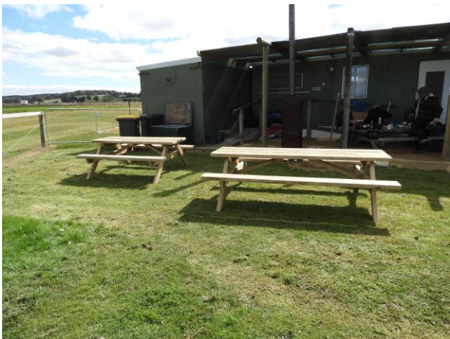
The new table/seats are a welcome addition to the field amenities.