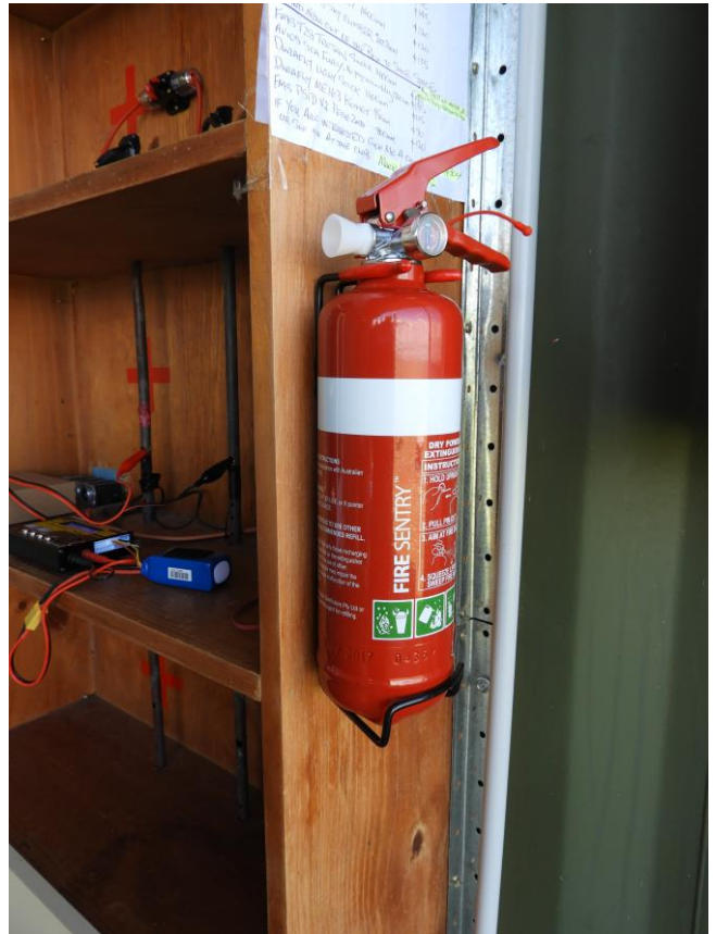
Two new fire extinguishers were purchased recently to mount outside. One is attached to the battery charging station. The other out on the fence next to the pit area. They aren't left out all the time just when needed.