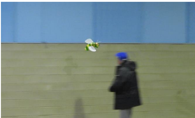
Just completed lap one as it went past Clive.