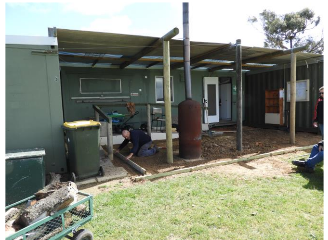
The retaining timber edge was moved out some 150mm to accommodate an even number of 450mm slabs. Originally 600x600 slabs were to be laid.

Last Sunday we started levelling the area in earnest ready for the pavers which are to be purchased following approval at the September meeting.