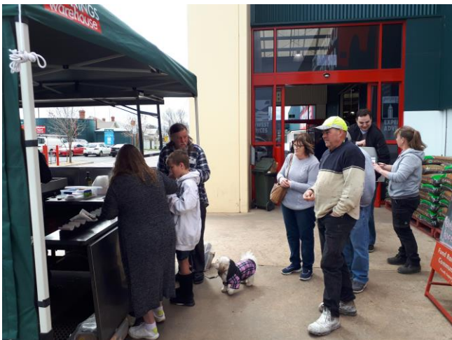
There were still plenty of busy times – quite often customers were queued up waiting to be served.

Many thanks to the members who were able to make it for their shift. I think it was an eye opener for those who haven't done it before just how busy it gets and that was a Friday. Between 10:30AM and 2PM it is full on.