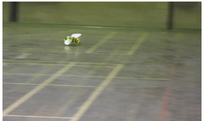
After almost two and a half laps the motor quit and it settled down for a landing. I'm not sure if it is on a timer or that is how long the battery lasts for.

The indoor flying has been extended for an extra month so the next two events are October 4 th & 18 th .