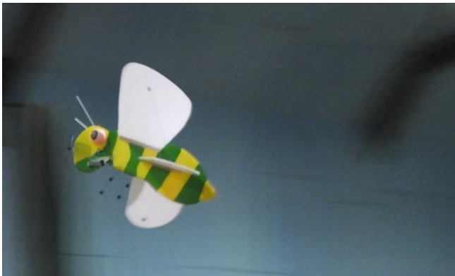
Here it sails past my camera only a few feet out in front.