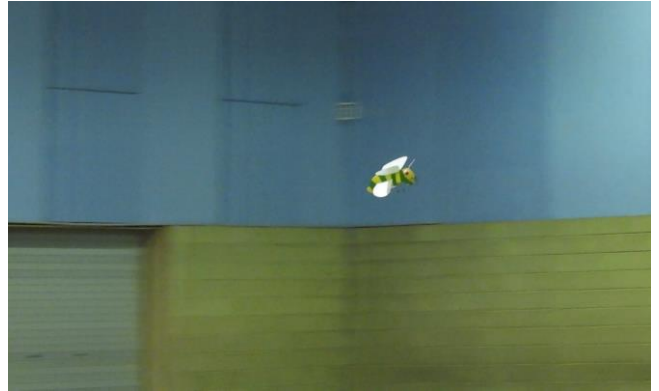
Now on the second lap