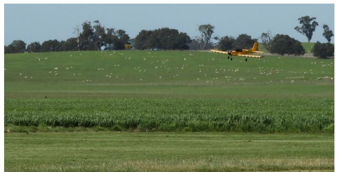
The Sport 40 on a landing approach. Graeme had several flights with it that day.