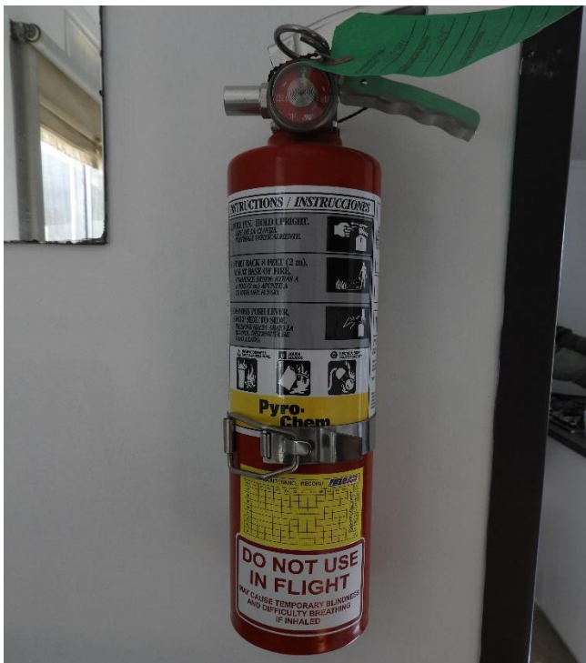
This one is located on the internal wall in the servery area.

Peter Evans was able to acquire two 1kg dry powder fire extinguishers which are removed from new aircraft imported from the USA. These were mounted on the two internal walls of the kitchen on Sunday 27 th August. This one is at the entrance.