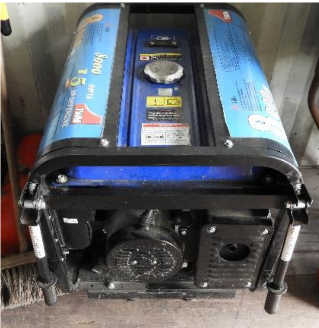
We came across a short length of aluminium tubing in the container during the cleanout and I used it to cut spacer blocks for the handles on the generator. Prevents the supports from collapsing inwards under load.