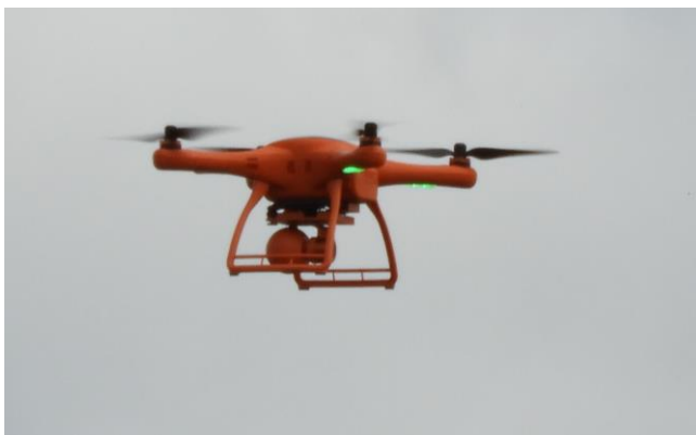
Looks a mean machine up close!!!