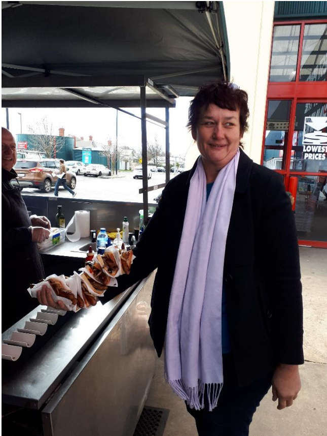
This lady was our best single customer and was quite insistent that she could manage 8 snags on her arm. I said to her "Can I get a photo of that?"