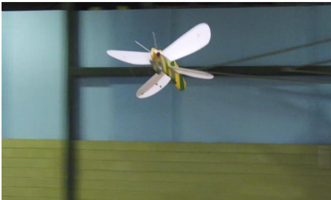
As it came around it only missed the wall by a few feet and really close on the second lap.