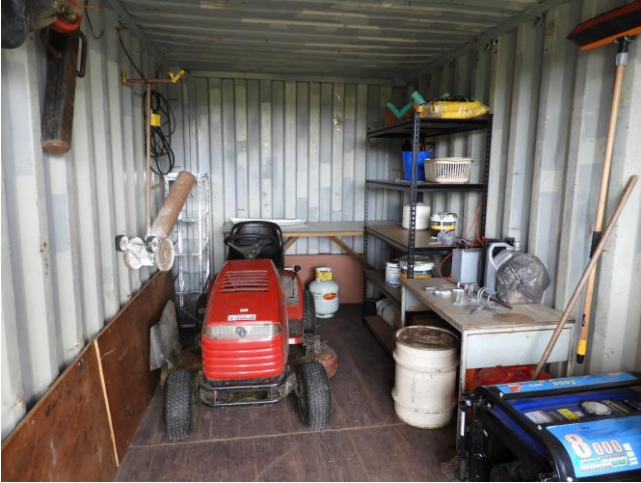
With the acquisition of the shelving unit, which we picked up at Bunnings on the day of the sausage sizzle, the container is now nicely organized with plenty of room to walk down past the mowers without tripping over something.