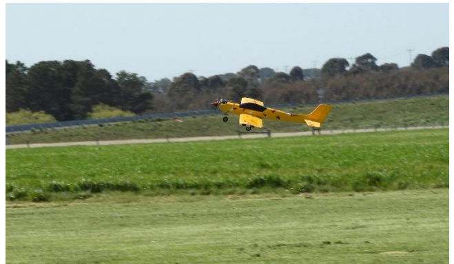
The Sport 40 moments after lift-off. Model seemed to fly quite well from an observer point of view.