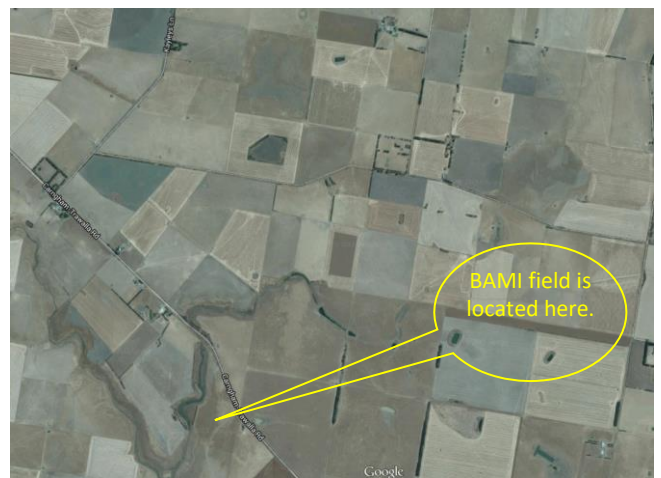
BAMI’s flying field is 847 Carngham-Trawalla Rd Brewster, 32 km from Ballarat.

In order they may adequately cater the event could you please let our secretary know if you will be attending. (See the secretary’s contact details in the newsletter header.)