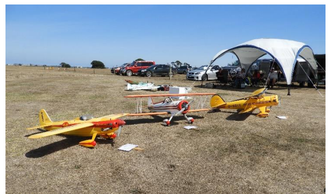
Shoestring, Super Stearman and Waco YMF-5 (all Great Planes models belonging to yours truly) in the foreground with our (Graeme's) igloo sunshade behind.

I'm not sure how many registered pilots there were – maybe 25 or so but enough to have models in the air most of the time. There was a light southerly breeze most of the afternoon with the temperature hovering around 25 degrees – very comfortable indeed.