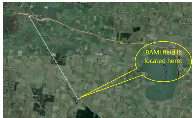
The home of Ballarat Aero Modellers is 12km south east of our Trawalla field.