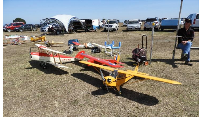
Peter Weston's stable of models in the foreground.

After the customary breakfast at Clarkes Pies Mortlake we arrived late morning. After setting up we settled into a pleasant afternoon of casual flying.