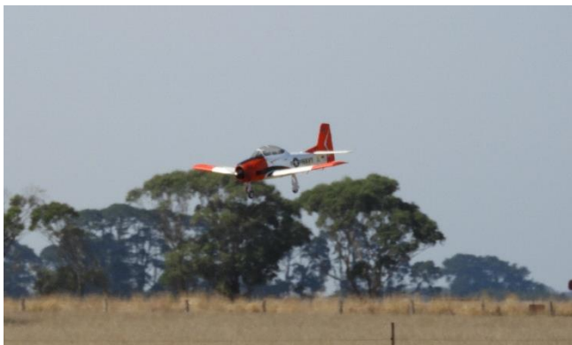
An electric powered foam model of a T28 Trojan. It was quite large and flew extremely well.