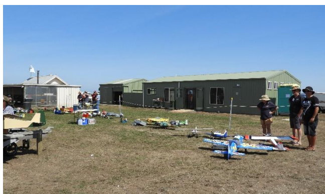
The Warrnambool club's Club House is to have a veranda erected along the entire length and the old building (left) dismantled.