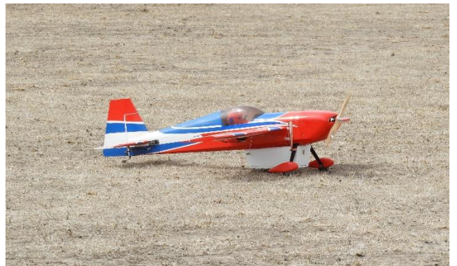
Alan's model with the lolly hopper mounted underneath – doesn't look like much ground clearance.