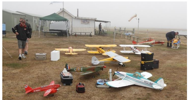
Max's models in the foreground early Sunday morning – note the coats.