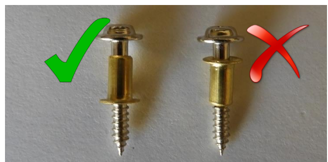
When fitted the correct way (left) the grommet will be held between the head of the screw at the top and the sleeve flange at the bottom, which is in contact with the mounting surface.