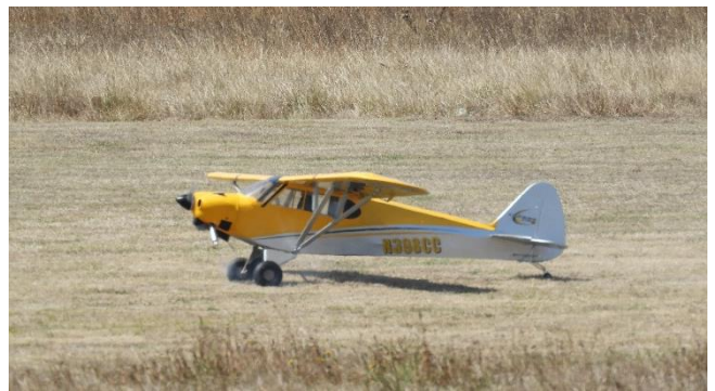
Graeme's Carbon Cub doing a touch and go.