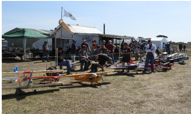
A line up of some of the models on show.

The Warrnambool club held their annual fun fly over the weekend of March 16 th /17 th under near perfect conditions. A far cry from last year's mayhem with the bushfires that threatened the field causing late Saturday evacuation of the campers. The odds are you have to be lucky with the weather at some stage. Having said that most flying events that we go to it's pretty unusual not to fly at all.