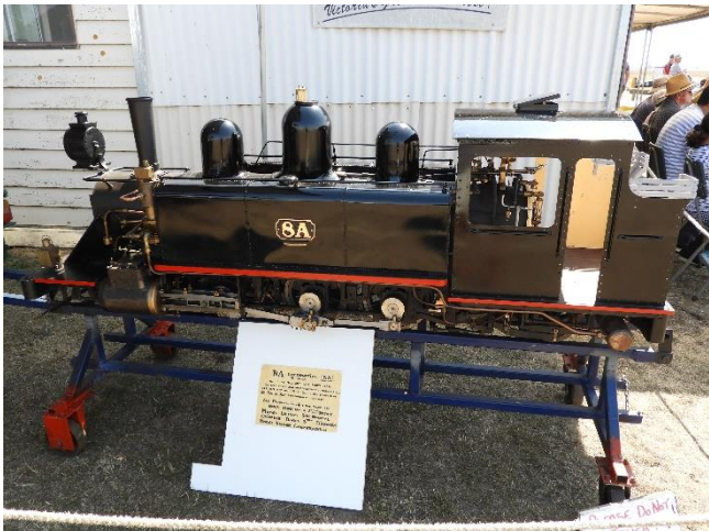
This 1/4 scale steam loco was on display and created quite a bit of interest.