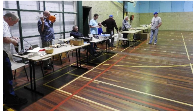
Wednesday night March 21 st

Several of our members have been attending the indoor flying at the Haddon Hall organized by the Ballarat Aero Modellers Club, which started for 2018 on Wednesday February 7 th . Attendances have been pretty good with March 7 th seeing one of the largest turn-outs to date, unfortunately I didn't manage a group photo that night.