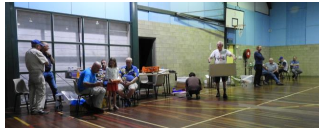
Wednesday night February 21 st

The event is held on the first and third Wednesday of the month between 7.00 & 9.30PM. We just assume it is on until such time as BAMI decide to have a breather.