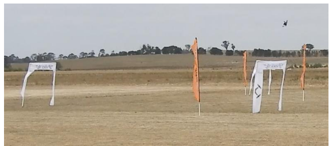
It is hard to capture the realism here, but Nathaniel is flying the drone (upper left) through the white banners using goggles which he sees the view from the drone’s on-board camera.