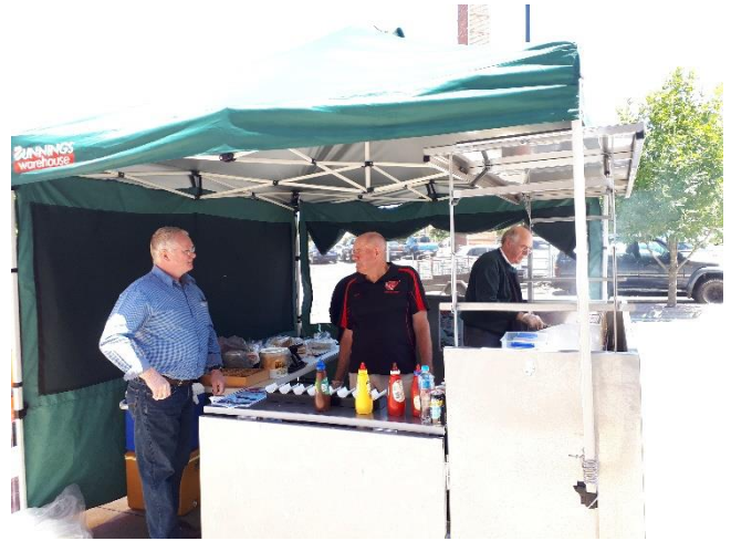
Whilst it seems quite, I've taken photos during a lull in business – customers might not like photos taken.