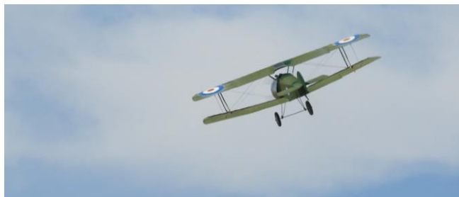
It looked quite good as it peeled off to the left. Graeme was able to get plenty of height so he could trim it out. Certainly no lack of power from the ASP 91 FS.