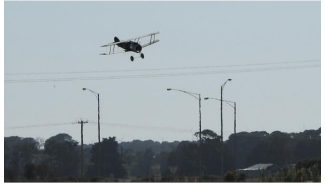
The power wires in the background are hundreds of metres away although they appear close in the photo.