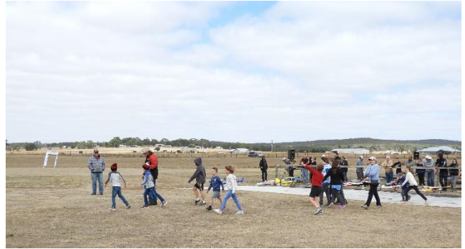
The kids were escorted out on to the runway while Nick’s Edge was circling around waiting for them to be in place for the drop.