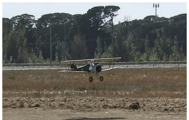
Over the strip and all looking good!!!