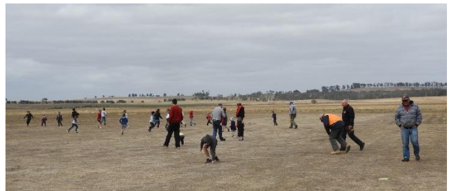
The drop was smack bang in the middle of the strip. It was quite difficult to judge when to release given the drift caused by the strong wind.