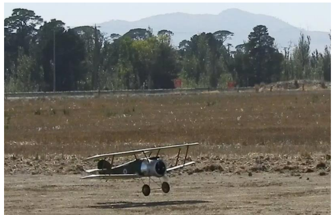
And down with a couple of bounces but all in all a good flight and well done.