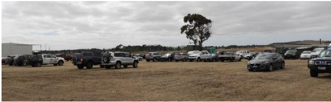
The car park was quite full at times, this was around midday.

Given the windy conditions we effectively pulled the pin on the event a bit earlier than planned by drawing the raffle and making presentations around 2:40PM. Nick was awarded Pilot's Choice for his dedicated flying contributions all day long.