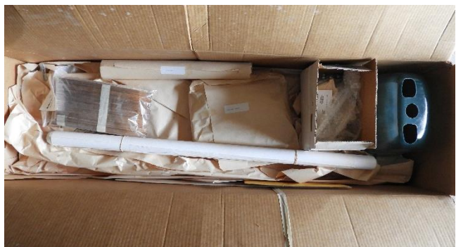
As you can see the parts are still wrapped and sealed. There's lots of hardware and the cowl is extremely strong.

The kit contains an extensive amount of hardware and a sturdy fibreglass cowl.