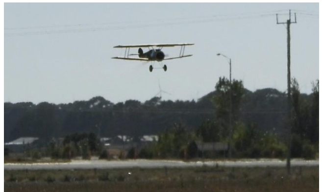
On final approach and into wind – I guess it would have been 20-25km/h.