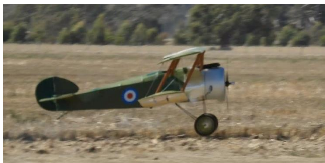
After a relatively straight take-off run the camel departed company with terra firma.