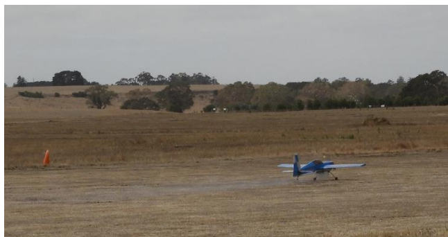
The Edge on take-off with a “belly” full of lollies to drop.