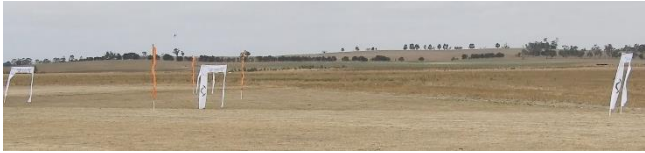
Another view of the entire course. The drone flies the course extremely fast.

Given the windy conditions we effectively pulled the pin on the event a bit earlier than planned by drawing the raffle and making presentations around 2:40PM. Nick was awarded Pilot's Choice for his dedicated flying contributions all day long.