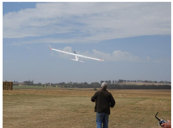
Looks like a successful hand launch on the first flight.