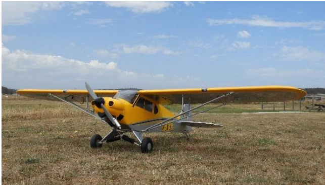
Graeme's new Hangar 9 Carbon Cub at the field on Sunday 7 th January. Powered by an ASP91 four stroke.

Graeme has a new Hangar 9 Carbon Cub powered by an ASP91 four stroke. The model seems to be quite a good performer with good ground handling and in flight characteristics.