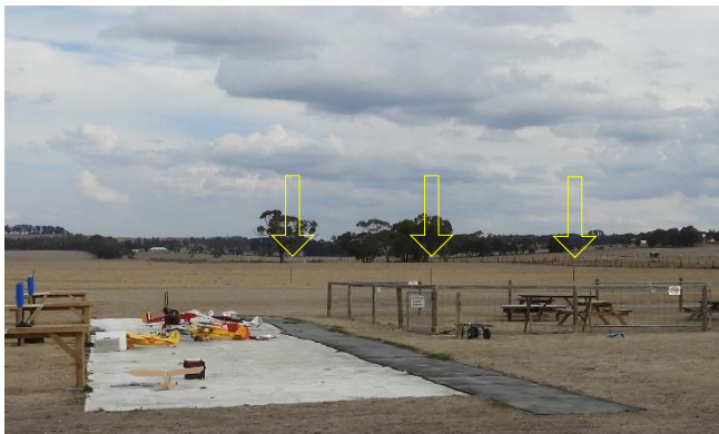
Arrows indicating the temporary posts defining the new southern boundary running roughly perpendicular to the Church Road boundary fence.

The Farm Manager advised that stock would not be in the paddock until August so the electric fence was taken down on Sunday 14 th April. The yellow painted plough discs were positioned over the sleeves that take the removable posts so they don't get overgrown and "lost".