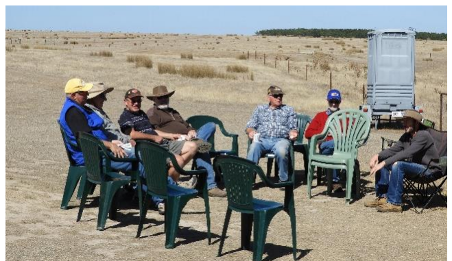
A chance to "shoot the breeze" at lunch time.