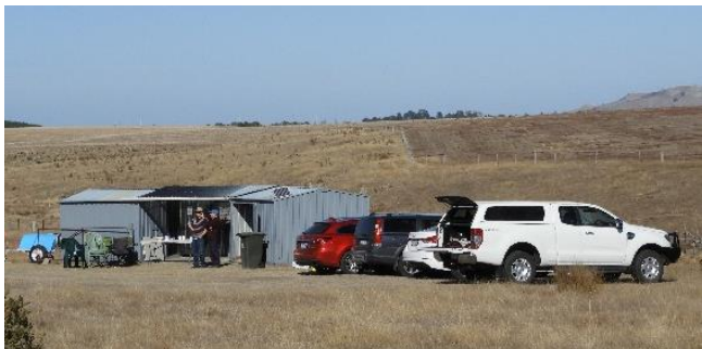
A shot of the club facilities. Those not flying park down next to the building while flyers park up the hill closer to the circle.