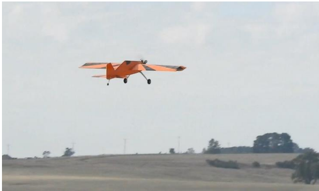
I pulled this frame out of the video on the "busy" maiden flight. Makes it look pretty good!!!