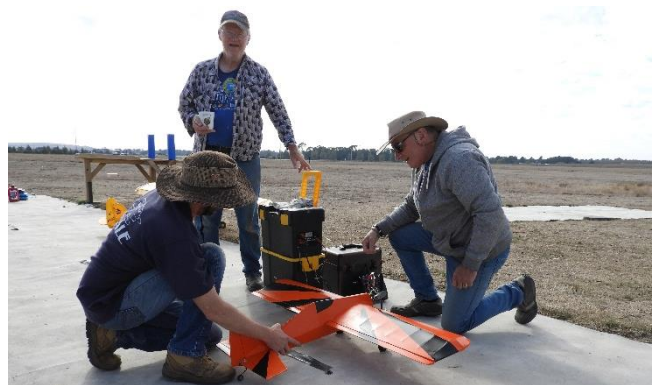
The old OS25 seemed to spring into life okay.