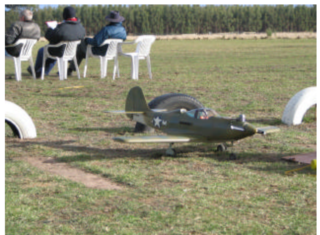
Roger Carrigg's P39 Airacobra powered by a Magnum 91 four stroke. Airframe is 29 years young. The judges can be seen in the background