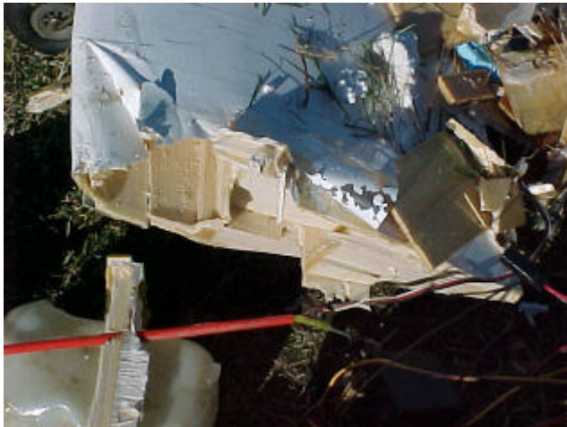
Note that there is no wing joining braces, spar webbing, fiberglass bandage, hardwood supports. The centre section join was only relying on the balsa spars butt joined.

A lesson could be learnt here. When you buy a pre-built model, you can't assume that it is structurally sound unless you know who built it and have confidence in the builder's ability. This also applies to ARF models.