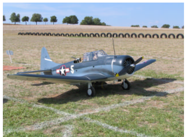
Don Murray's (NSW) impeccable Douglas Dauntless. Around 95" wing span and powered by a Moki 1.8. You have to see it to appreciate the detail.

As usual in these sorts of events, there were a couple of crashes. The first one that comes to mind is a CAP 10B (apparently used by the French Air Force as a pilot trainer) It appeared that the CAP got too far away and the pilot lost orientation causing it to spin into the ground beyond the hill to the north of the strip. The other one was a Piper L4 Grasshopper that lost control and crashed on take off. The pilot was obviously blaming the radio by the way he was gesturing with the Tx.