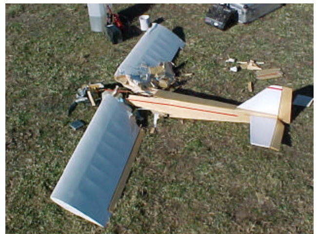
The aftermath of structural failure!

The best flying day that we have had this year was Sunday 8 th May (Mothers Day). Glenn was looking forward to a good morning's flying session but alas it was not to be.