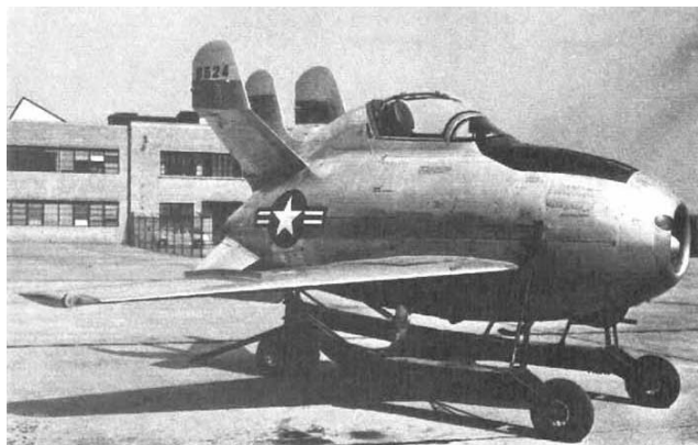
The one and only McDonnell XF-85 Goblin. They sure had some imagination.

sighted the Goblins were supposed to detach from the B-36's, drive off the attackers and then to hook back onto the carrier aircraft.